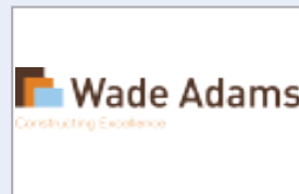
WADE ADAMS CONTRACTING LLC