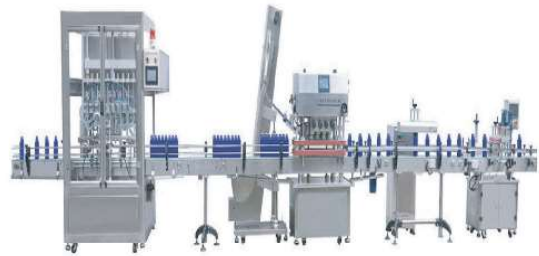
Liquid filling, capping & labeling