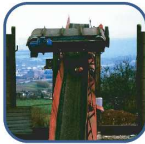
Permanent magnet & Electro magnet