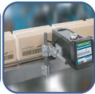
Coding , Marking & Labeling

The team at waylog automation experts in delivering complete automated systems that are capable of completing a manufacturing process or series of processes with minimal human interaction. These independent cells are a cost-effective solution for small to medium sized manufacturers who are looking for increased productivity and efficiency. Our comprehensive automation services include design, build, implementation, service and repair of our systems.