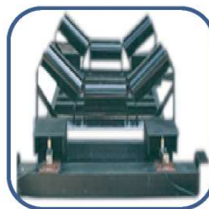
Belt scale system