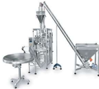
Auger filling machine