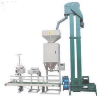
Semi automatic bagging