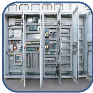
Electrical panel construction