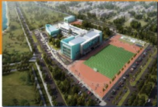
Project: Amity International School Company Name: ShapoorjiPallonji Mideast LLC. Location: Al Bahya, Abu Dhabi, UAE Starting Date: March-2014