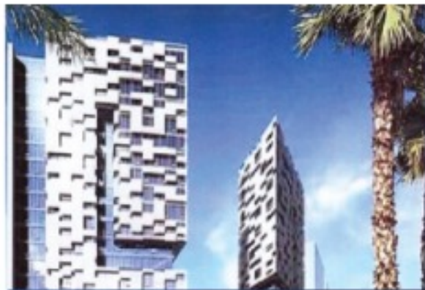
Project: Capital Bay Tower Company Name: Commodore Contracting Co Location: Dubai, UAE. Working period: from April-13 to Dec-14