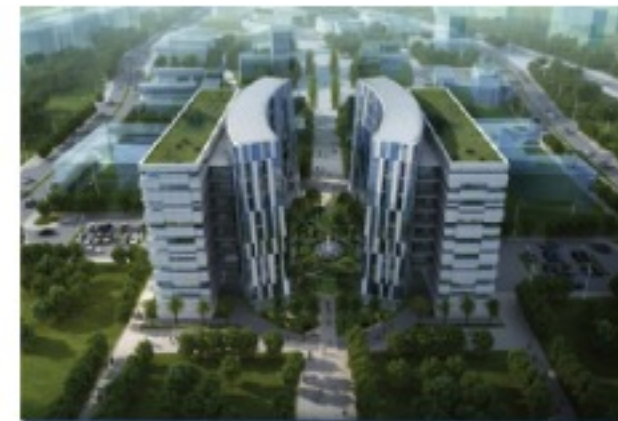
Project: Residential Building at Rawdhat Company Name: Chapo UAE LLC (Engineering Bldg & Civil EngCont). Location: Abu Dhabi, UAE. Working Period: April-14 to March-16.