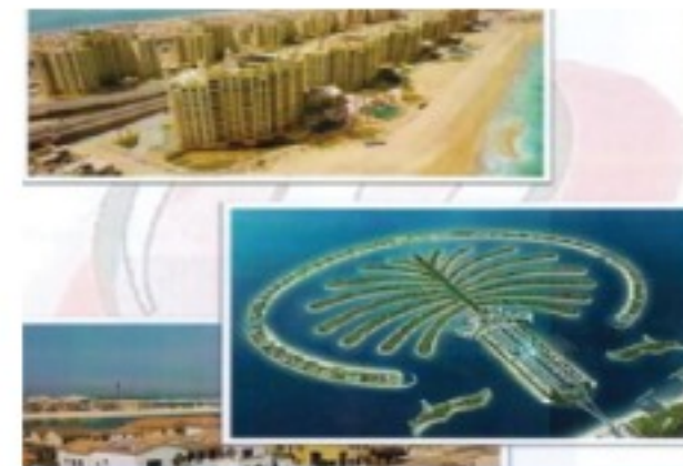
Project Name: Palm Jumeirah Company Name: Al Gaith Construction Company Location: Dubai, UAE.