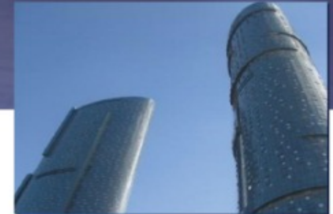
Project: Sun and Sky Tower Company Name: Arabian Construction Co (ACC) Location: Al Reem Island, Abu Dhabi, UAE