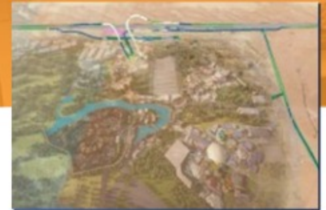
Project: R-1041-Dubai park Access from Sheikh Zayed Road. Company Name: China State Construction Engr. Corp (middle East ) LLC. Location: Sheikh Zayed Road, Jebel Ali, Dubai