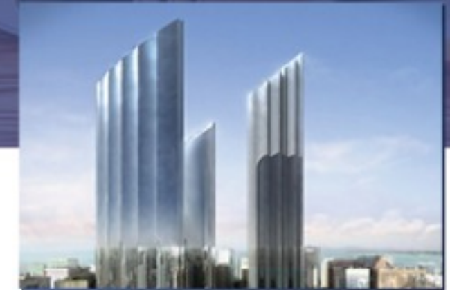
Project: Central Market Redevelopment Project Company Name: Arabian Construction Co LLC(ACC) Location: Al Reemisland, Abu Dhabi, UAE. Working period: Nov-2013 to Nov-2014.