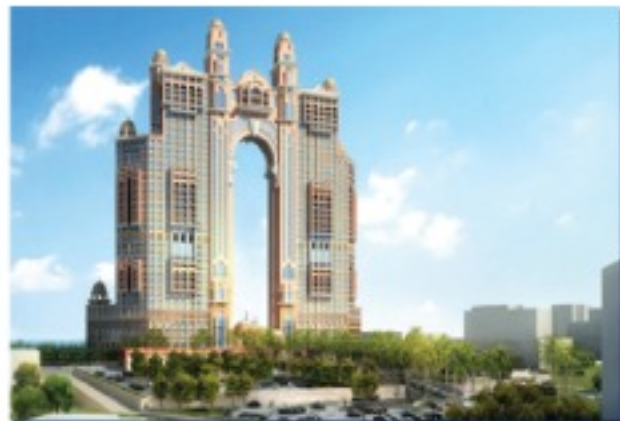
Project: Fairmont Hotel & Service Apartments. Main Contractor: Depa Décor General Contracting & maintenance Co LLC. Location: Marina Mall, Abu Dhabi.