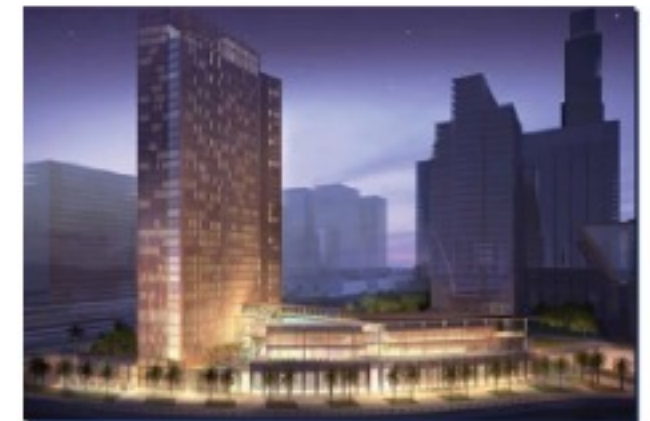
Project: Four Season Hotel Work: Painting. Main Contractor: Al Futtaim Carillion LLC. Location: Al MaryahIsland, Abu Dhabi.