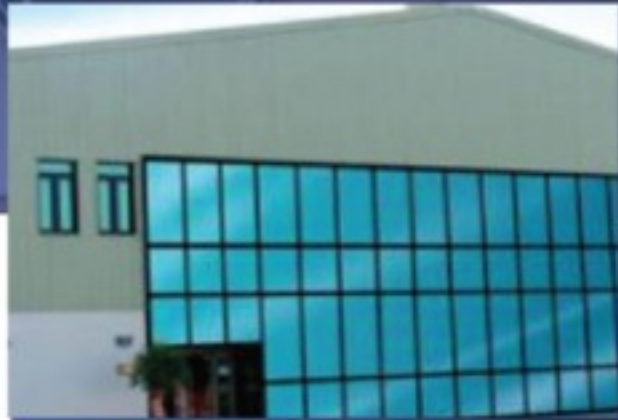
Project Name: Main Contractor: Trust Construction Est. Location: Abu Dhabi.