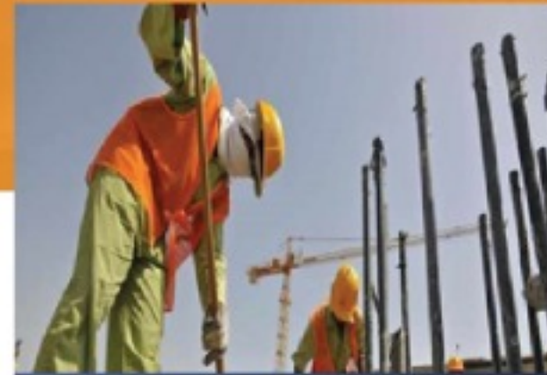
Project Name: Pioneer Company Name: kalba bridge Location: Sharjah i, UAE