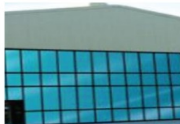
Project Name: Main Contractor: Trust Construction Est. Location: Abu Dhabi, UAE