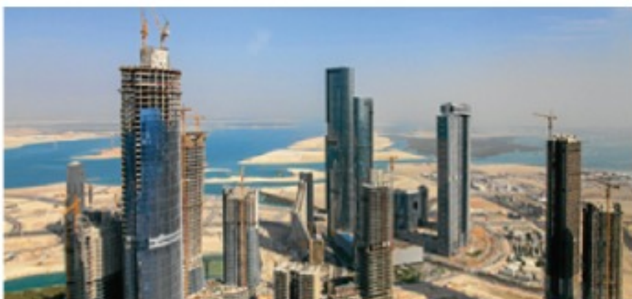
Project: City of Lights Company Name: China State Construction Engineering Corporation (Middle East) LLC Location: Al Reem Island, Abu Dhabi, UAE.