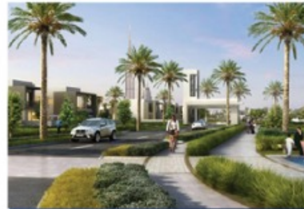
Project: Dubai Hills Estate-Construction of 97 Villas. Main Contractor: Al Basti & Muktha LLC. Location: Al Khail Road, Dubai.