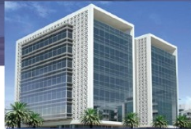
Project Name: Sorouh North Park Office Building Company Name: Orient House for Development and Construction Co. LLC. Location: Abu Dhabi, UAE