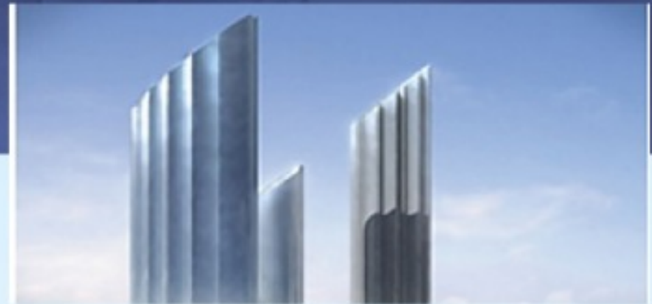
Project: Central Market Redevelopment Project Company Name: Arabian Construction Co LLC (ACC) Location: Al Reem Island, Abu Dhabi, UAE. Working period: Nov-2013 to Nov-2014.