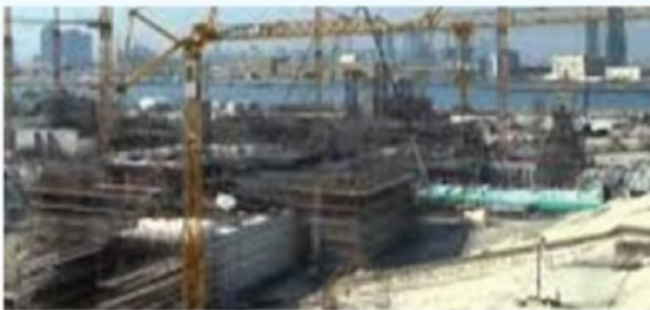
Project: Louvre Abu Dhabi Company Name: Arabtec-Sanjose-Oger(ASO). Location: Saadiyat, Abu Dhabi, UAE. Working period: From Sept-13 to July-14.