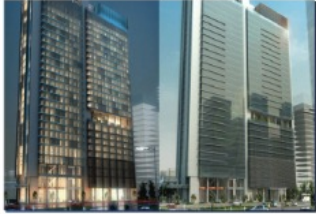
Project Name: Sorouh North Park Office Building Company Name : Orient House for Development and Construction Co LLC. Location: Abu Dhabi, UAE