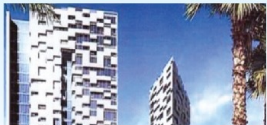
Project: Capital Bay Tower Company Name: Commodore Contracting Co Location: Dubai, UAE. Working period: from April-13 to Dec-14