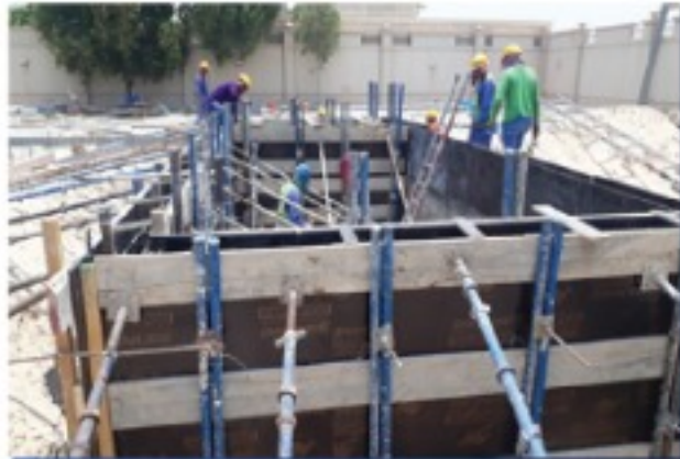
Project Name: Company Name: Royal International Contracting Location: Dubai, UAE