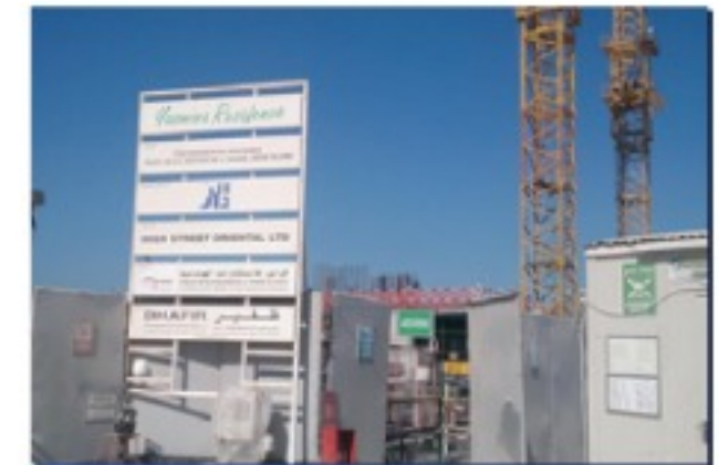
Project: Yasmina Residence-Two Residential Buildings at RSS-C5,C6. Main Contractor: Dhafir development Contracting LLC. Location: Reem Island, Shams, Abu Dhabi.