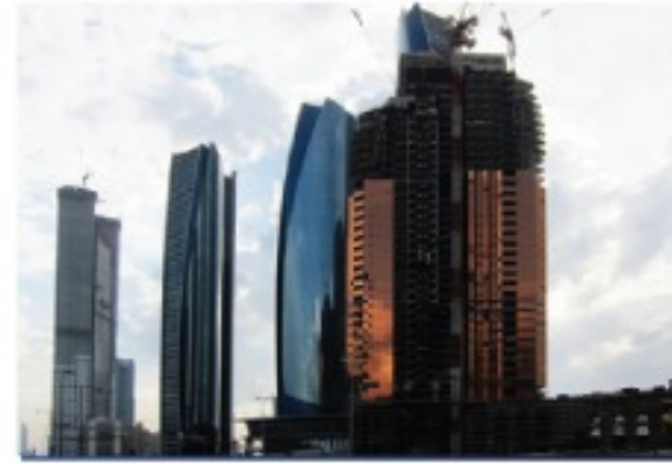
Project: Bab Al Qasr Hotel & Serviced Apartment Company Name: Fino International Contractors Location: Abu Dhabi, UAE.