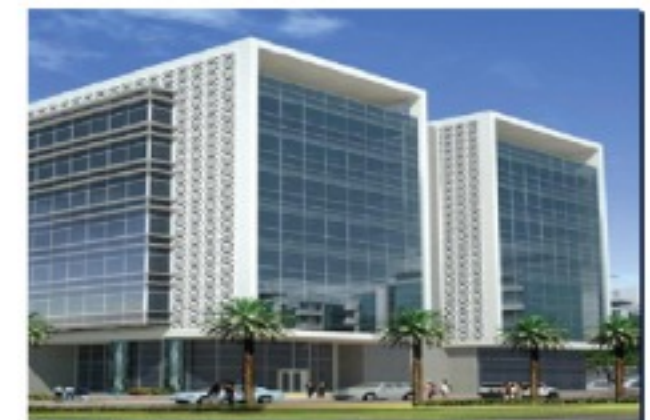
Project Name: Soroush North Park Office Building Company Name: Orient House for Development and Construction Co LLC. Location: Abu Dhabi, UAE