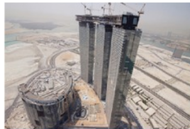
Project: ACC Gate Tower Company Name: Arabian Construction Company (ACC) Location: Al Reem Island, Abu Dhabi, UAE.