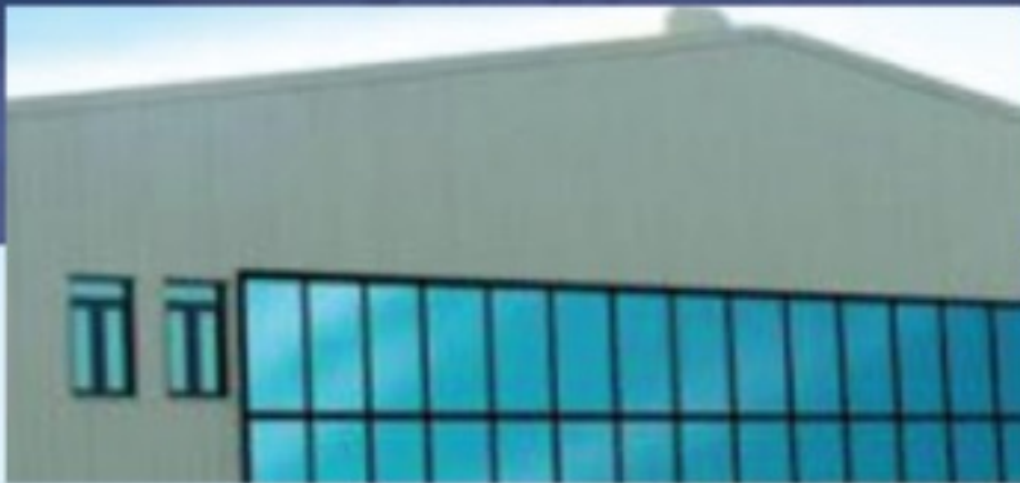
Project Name: Main Contractor: Trust Construction Est. Location: Abu Dhabi.