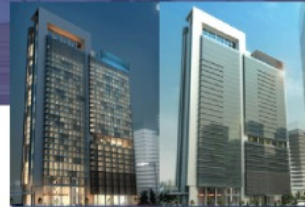
Project: Bloom Central, Zone W-13/01 Company Name: Shapoorji Pallonji Mid-East LLC Location: Abu Dhabi, UAE