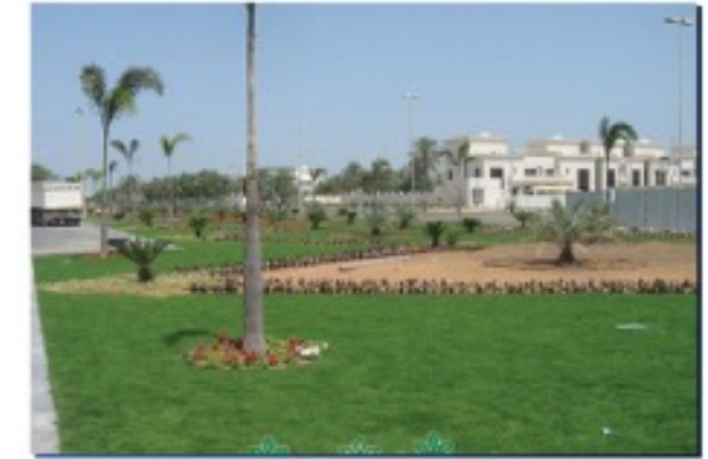
Project: Al Bateen Palace Company Name: Capriole Construction Co. LLC Location: Abu Dhabi, UAE.