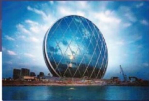
Project Name: Al Dar Yas Island Company Name: Cityscape Location: Abu Dhabi, UAE