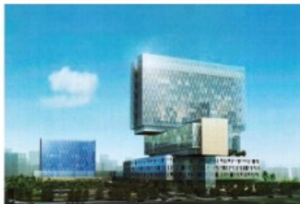
Project: Cleveland Clinic Company Name: Six Construct Co Ltd. Location: Abu Dhabi, UAE.