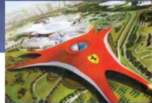
Project Name: Razeen Labour Camp Company Name: Best way Gulf Location: Abu Dhabi, UAE