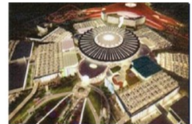
Project: Yas Mall, Yas Island Company Name: Six Construct Co Ltd