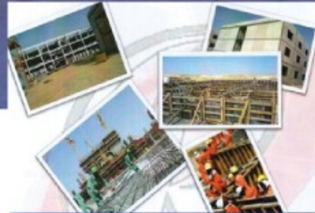
Project Name: Ferrari World Yas Island Company Name: Depa, Abu Dhabi