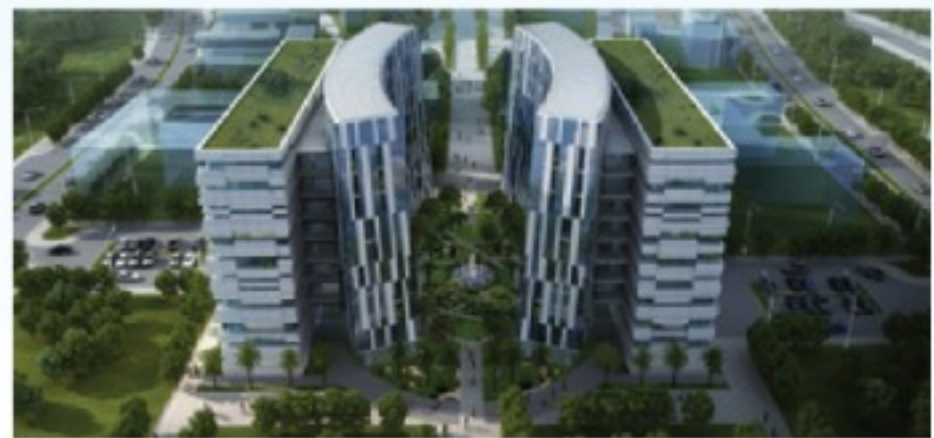
Project: Residential Building at Rawdhat Company Name: Chapo UAE LLC (Engineering Bldg & Civil Eng Cont). Location: Abu Dhabi, UAE. Working Period: April-14 to March-16.