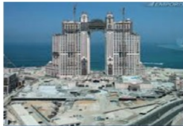
Project Name: Fairmount hotel Company Name: Deepa Location: Abu Dubai, UAE