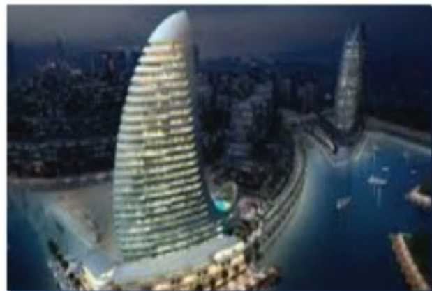
Project Name: Sail Tower Company Name: Al Rakha General Contracting LLC Location: Abu Dubai, UAE