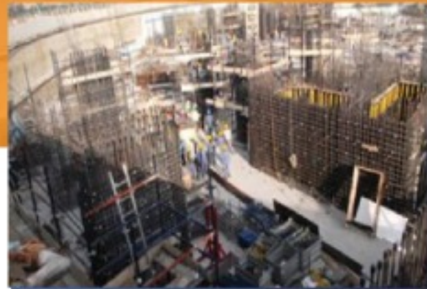
Project: Damac-Paramount Tower Company Name: TAV TepeAkfen Investment Construction & Operation. Location: Dubai, UAE. Working period: from Nov-13 to bill date.