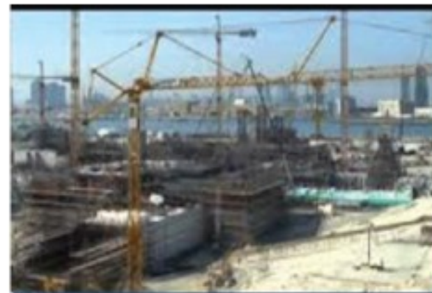
Project: Louvre Abu Dhabi Company Name: Arabtec-Sanjose-Oger(ASO). Location: Saadiyat, Abu Dhabi, UAE. Working period: From Sept-13 to July-14.