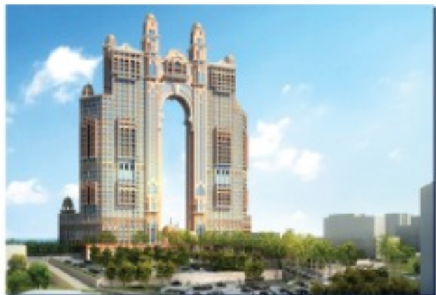
Project: Fairmont Hotel & Service Apartments. Main Contractor: Depa Décor General Contracting & maintenance Co LLC. Location: Marina Mall, Abu Dhabi.