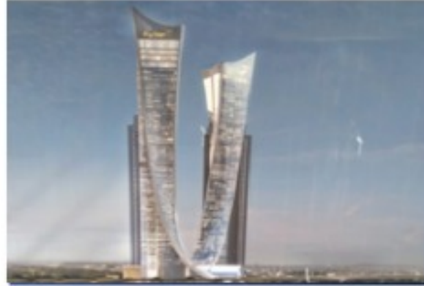
Project Name: Aykon Tower by Damac Company Name: Power Overseas Location: Dubai, UAE