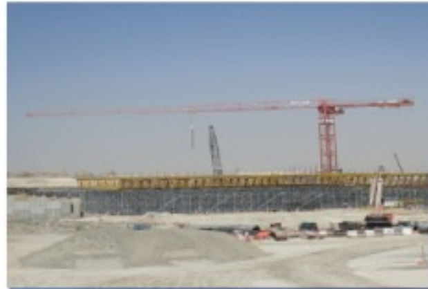
Project Name: Creek Harbour Company Name: Apex construction LLC Location: Dubai, UAE