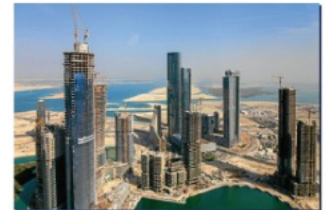
Project: City of Lights Company Name: China State Construction Engineering Corporation (Middle East) LLC Location: Al Reemisland, Abu Dhabi, UAE.