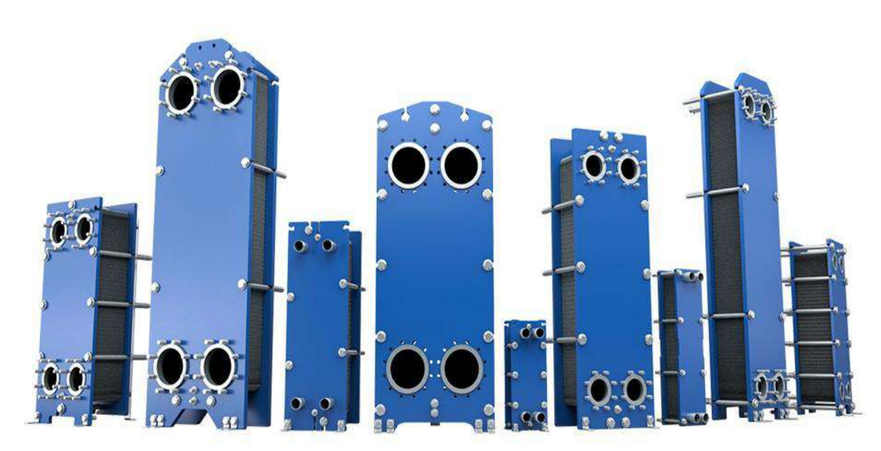
PLATE HEAT EXCHANGERS

Steam engine provides highest quality and lowest cost PHE which help the customer to experience highest quality. Starting from procurement till after sales service, we maintain extensive quality system.