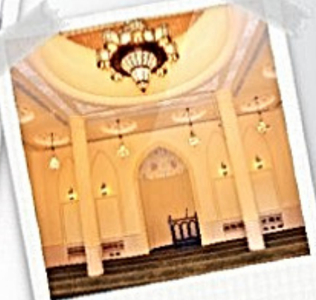
CONSTRUCTION OF MOSQUE @ UMM AL SHEIF AL BARSHA AREA