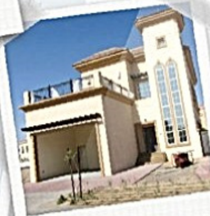
G+1 RESIDENTIAL VILLA FOR PRIVATE OWNER IN "THE VILLA" @ DUBAI LAND ON PLOT RO-017

M/S INTERNATIONAL HOUSE PROJECT MANAGEMENT