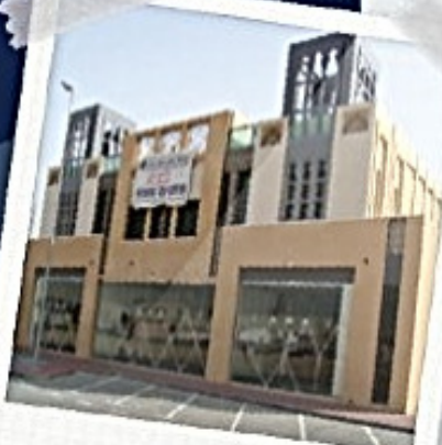
PROPOSED G+M RESIDENTIAL & COMMERCIAL BUILDING @ AL BARSHA

M/S INTERNATIONAL HOUSE PROJECT MANAGEMENT