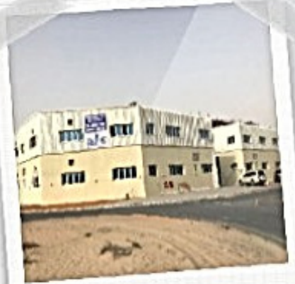
Construction of B+G+2+R Residential Building @ Arjan Project Cost - AED 10,940,000