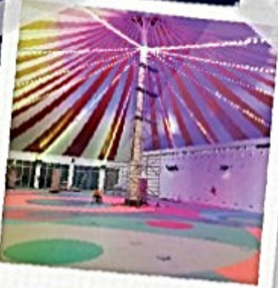
CONSTRUCTION OF GAME ARCADE BUILDING @ FUNFAIR AREA