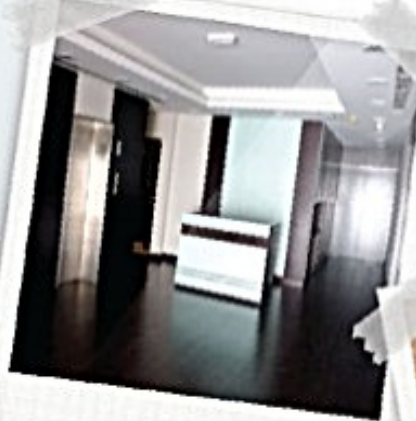
PROPOSED G+M OFFICE & WARE HOUSE @ JABEL ALI FREEZONE

M/S INTERNATIONAL HOUSE PROJECT MANAGEMENT