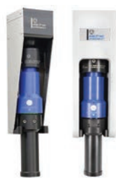
• Parking stations for H2 refueling system