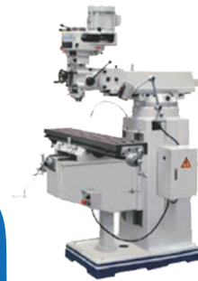
• Smart Mill – EM4S