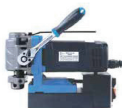
Magnetic Drilling Horizontal Machine