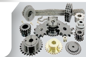
Conveyor Chains in Automotive Industry