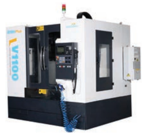
• CNC3 Axis Milling Machines