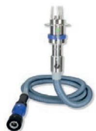
• Refueling nozzle & breakaway coupling