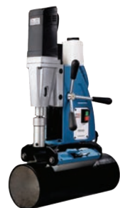
Magnetic Drilling Machine