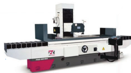
• Surface Grinding Machines