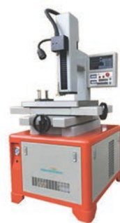
• Smart Hole Drilling Electric Discharge Machine