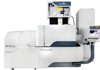
• CNC Wirecut EDM Machines