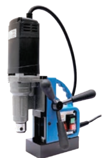
Magnetic Drilling Machine