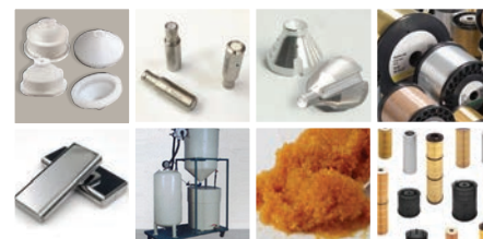
• EDM Consumables