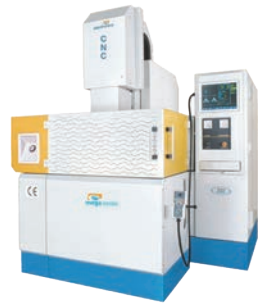
• CNC EDM Machines