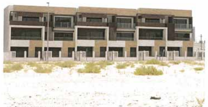
12 Villas at JVC