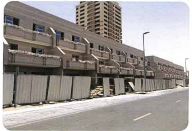
16 Villas at JVC