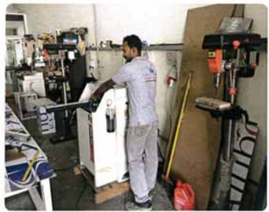
End Milling Machine for Notching