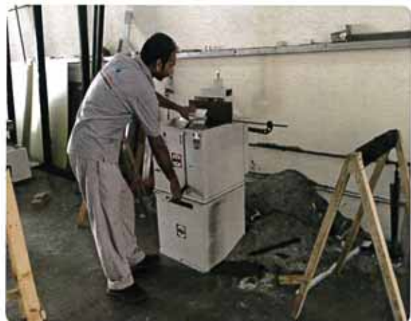
Single Head Cutting Machine