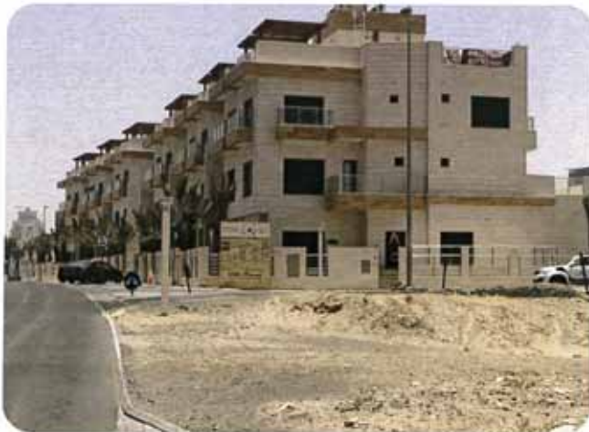
12 Villas at JVC