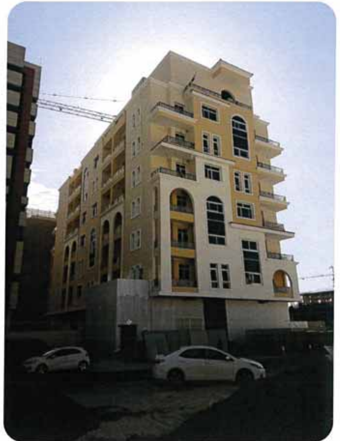
G+6 Building Al Warqa