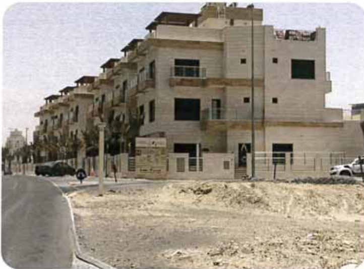
12 Villas at JVC