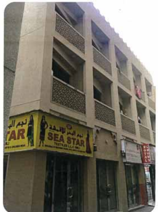
Souk al kabeer