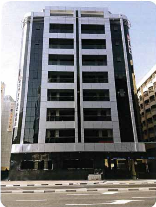
G+7 Building Bank Street client Adil Mustafawi