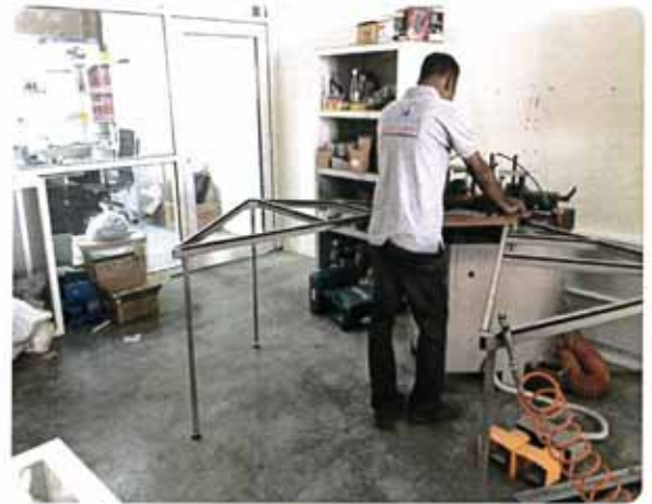
Corner Crimping Machine