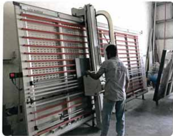
Vertical Panel Saw