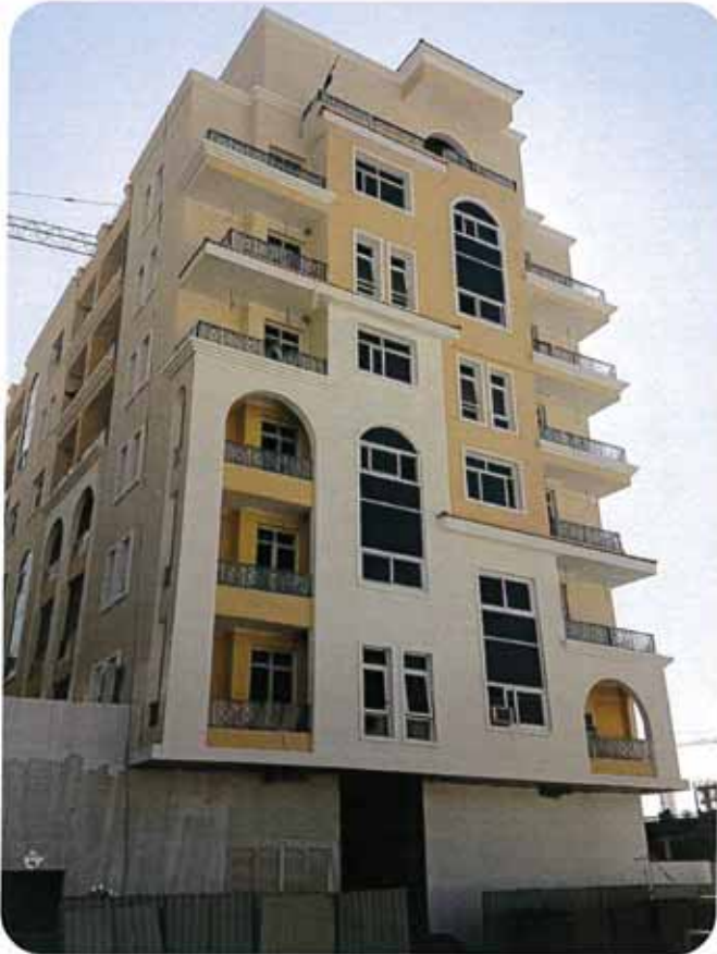
G+6 Building Al Warqa