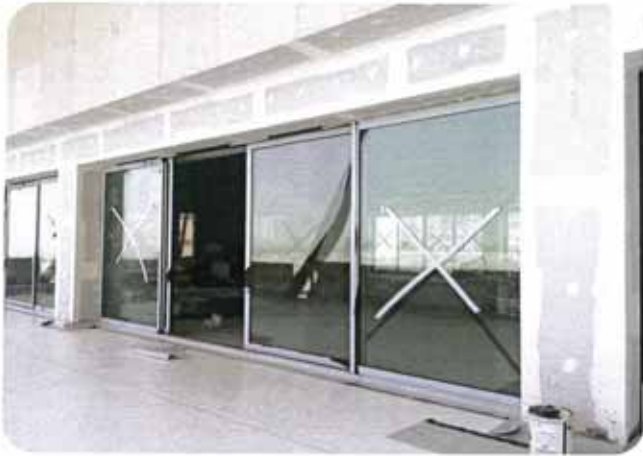
Bab al qasr hotel lift and slide door