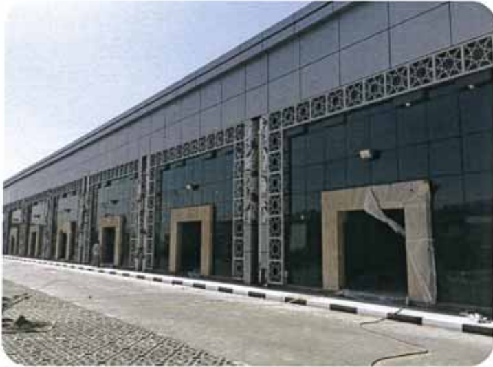
16 office & ware house DIP