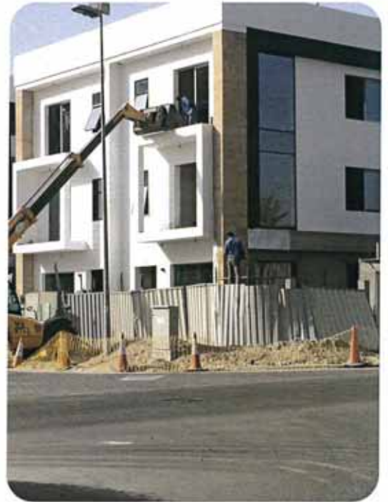
5 Twin villas at J V C