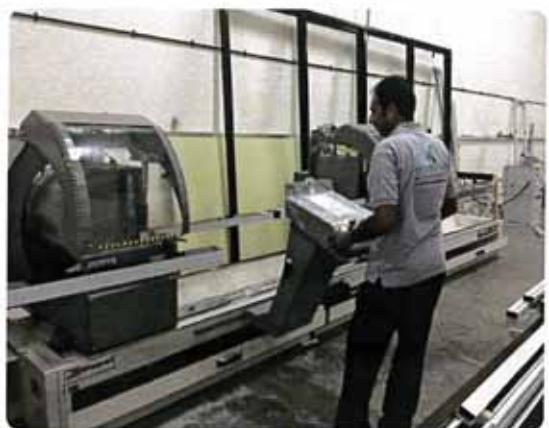
CNC Double Head Cutting Machine