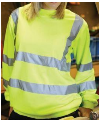
HI-VIS SAFETY T-SHIRT