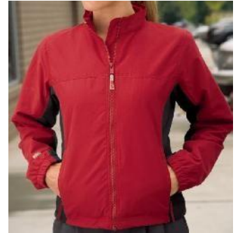
LT DUTY JACKET