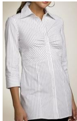
CUSTOM STYLE SHIRT