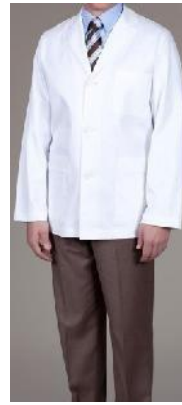
SHORT LAB COAT