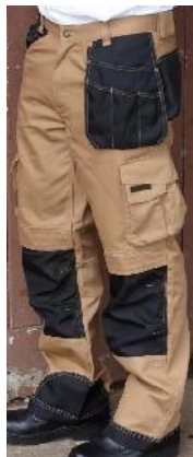
HVY DUTY CARGO TROUSERS