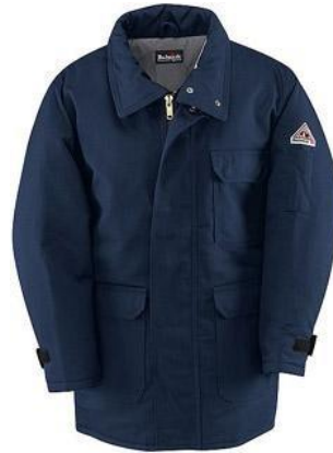
HVY DUTY WINTER JACKET