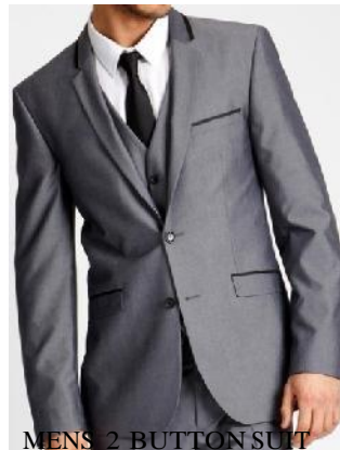
MENS 2 BUTTON SUIT JACKET