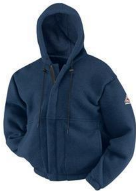
HOODED FLEECE JACKET