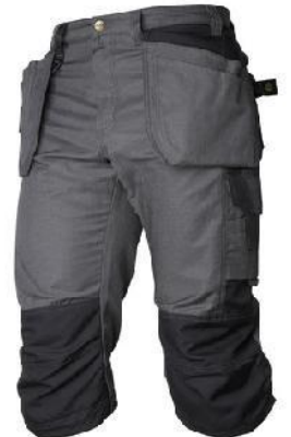
UTILITY 3/4 SHORTS