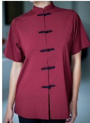
CUSTOM STYLE TUNIC