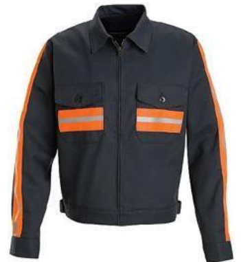
HI-VIS SAFETY SHIRT