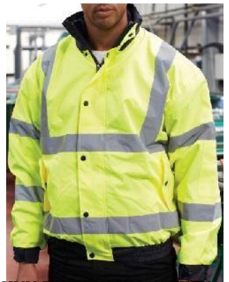
HVY DUTY HI-VIS SAFETY JACKET