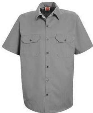
H/SLV WORK SHIRT