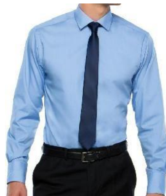
MENS FORMAL SHIRT