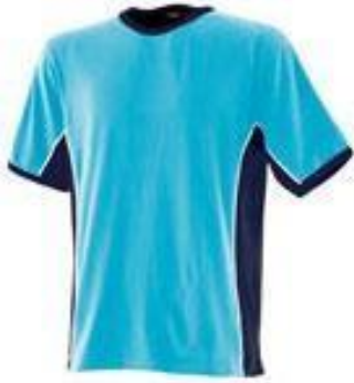
ROUND NECK T-SHIRT