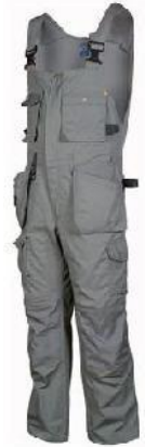
FULL BACK BIB COVERALL