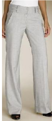
WOMENS FLARED LEG TROUSERS