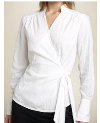
H/SLV WORK SHIRT