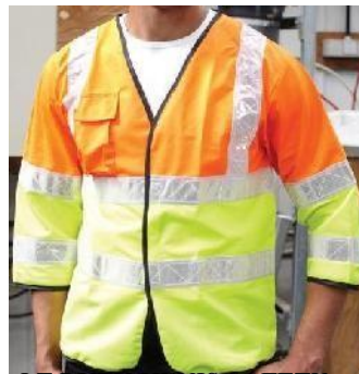
LT DUTY HI-VIS SAFETY JACKET