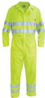
SUPER HI-VIS COVERALL