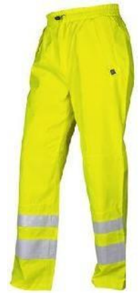
SUPER HI-VIS TROUSERS