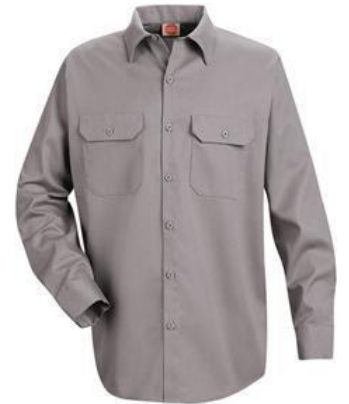
F/SLV WORK SHIRT