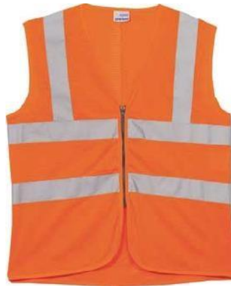
HI-VIS SAFETY VEST