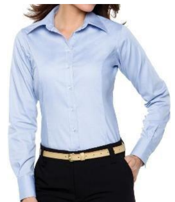
WOMENS FORMAL SHIRT