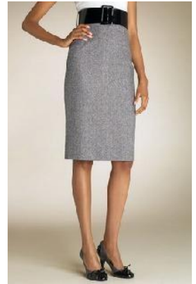
KNEE LENGTH SKIRT