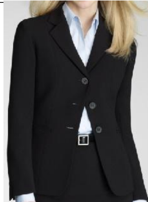
WOMENS 3 BUTTON SUIT JACKET