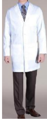
MEDIUM LENGTH LAB COAT