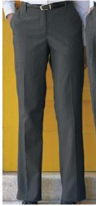
WOMENS STRAIGHT LEG TROUSERS