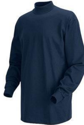
FULL SLEEVE T-SHIRT