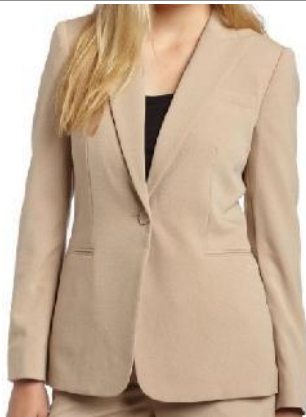
WOMENS 1 BUTTON SUIT JACKET