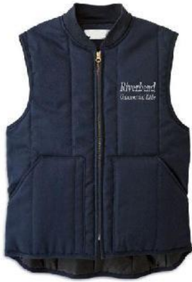
SLEEVELESS WINTER JACKET