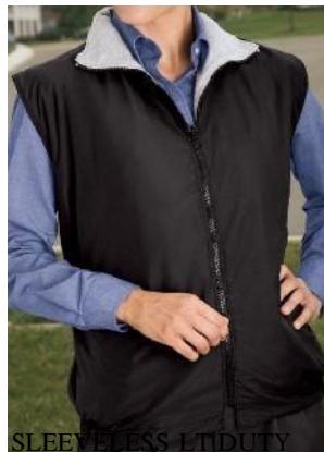
SLEEVELESS LT DUTY JACKET