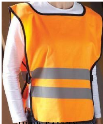
HI-VIS SAFETY TABARD