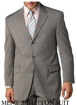
MENS 3 BUTTON SUIT JACKET