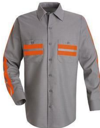
HI-VIS WORK SHIRT