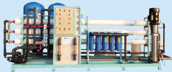
100000 BW RO PLANT