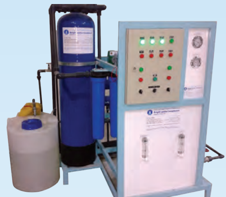
3000 GPD BW RO PLANT