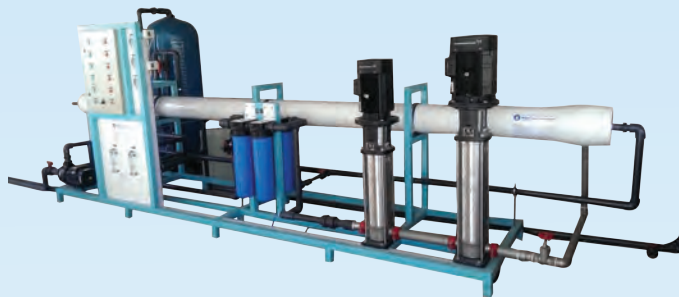
20000 HBW RO PLANT