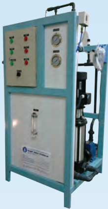
1500 GPD BW RO PLANT

Industrial and Commercial reverse osmosis systems are designed according to the analysis report of the water sample. All our RO plants are carefully customized and configured. The plant remove physical, chemical contents and biological contents of raw water. Our RO plant is widely accepted due to its simple operation and ability to withstand in feed water quality