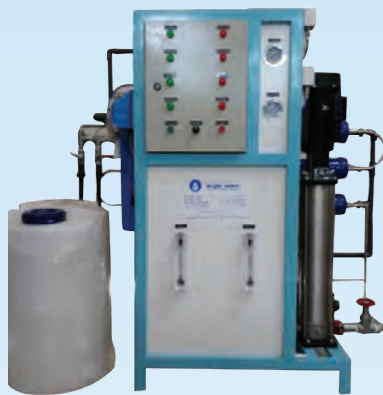
5000 GPD BW RO PLANT