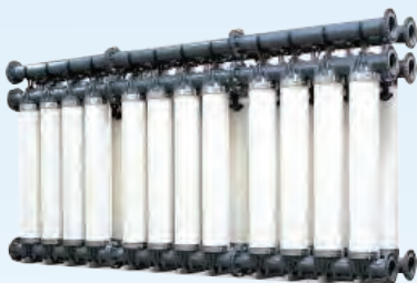
ULTRA FILTRATION (U F)