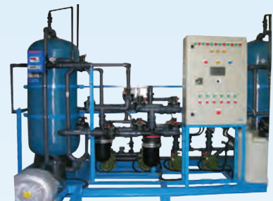
GREY WATER TREATMENT PLANT

The treatment plant will remove excess colour, odour, suspended particles, bad taste, turbidity, iron, hardness, etc. in the raw water.