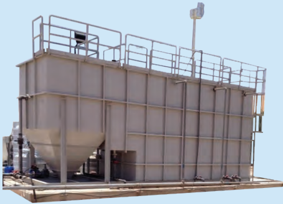
STP 250 CMD