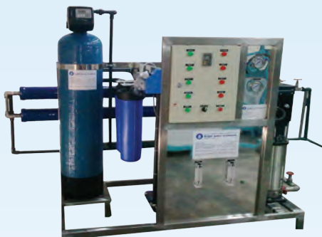
6000 GPD BW RO PLANT