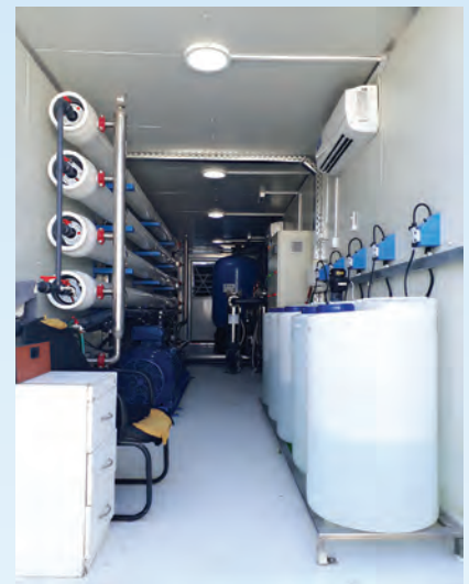
CONTAINERIZED SEA WATER DESALINATION PLANT 300 CMD