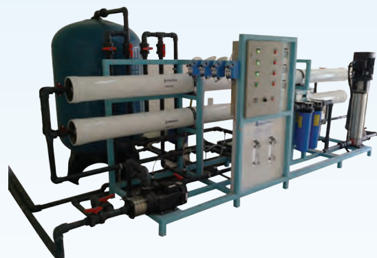
50000 GPD BW RO PLANT