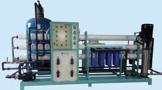
60000 GPD BW RO PLANT