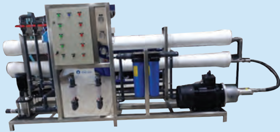
20000 GPD SW RO PLANT