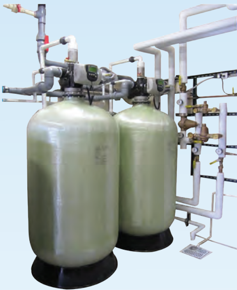
MEDIA FILTRATION SYSTEM