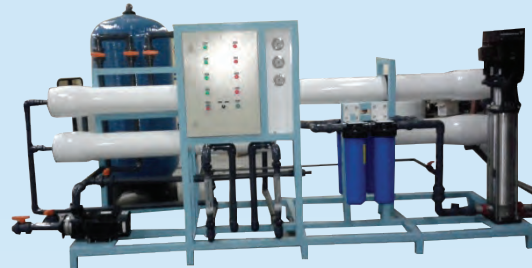
30000 BW RO PLANT