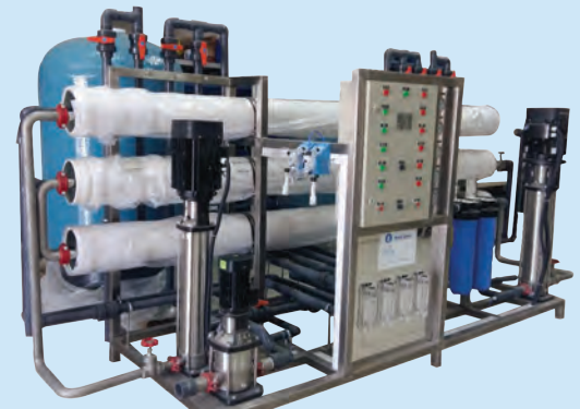
30000 GPD HIGH BRACKISH WATER RO PLANT