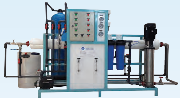
10000 GPD BW RO PLANT