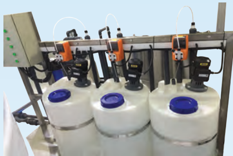
MINERAL INJECTION UNIT