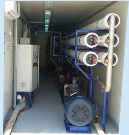
CONTAINERIZED SEA WATER DESALINATION PLANT 240 CMD