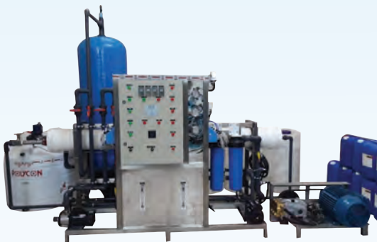
10000 GPD SW RO PLANT