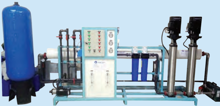
10000-15000 HBW RO PLANT