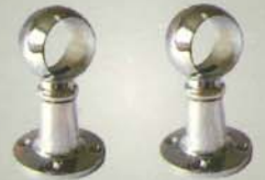
Simple Pipe Holder