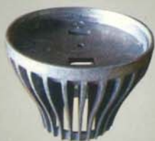
Aluminium Light Cover