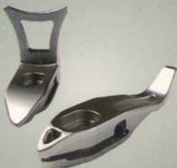
Fancy Curtain Hook