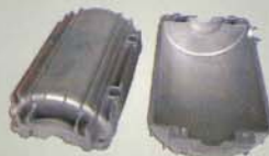
Street Light Cover