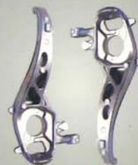
Window Handel Lock