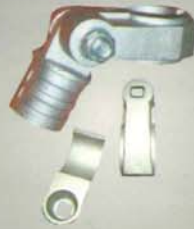
Aluminium Scaffolding Clump