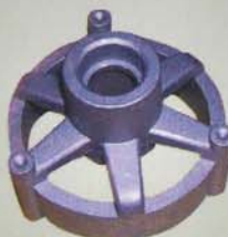
Motor Side Cap