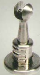
Fancy Pipe Holder