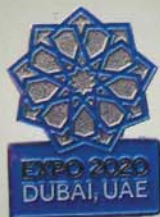
Aluminium Expo Mono