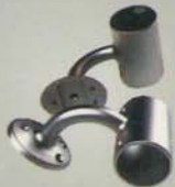
Round Pipe Holder