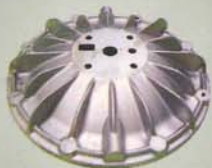
Motor Body Cap