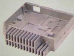
Aluminium Computer Part