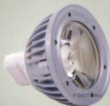
Aluminium Light Fancy Cover