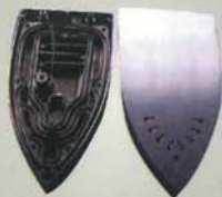
Aluminium Iron Base