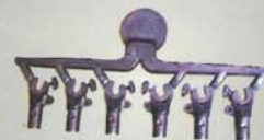
Aluminium Auto Parts