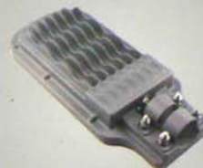
Street Light Fancy Cover