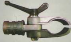
Aluminium Scaffolding Stabilizer Set