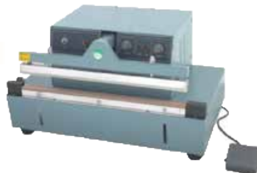
TABLE TOP SEALER

It's ideal for materials testing and quantifying the optimum heat sealing parameters for heat seal or heat seal/cut applications. Used to seal or manufacture polyethylene, foil coated poly or paper/poly bags and pouches.