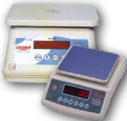
TABLE TOP WEIGHING SCALE

CAPACITY-kg ACCURACY-g PAN SIZE-mm 10, 20, 30 1, 2, 5 250 x 280