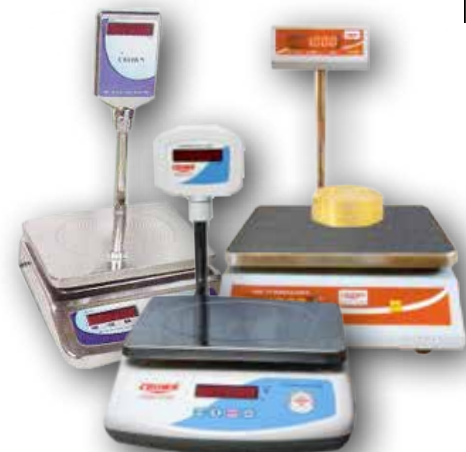
TABLE TOP WEIGHING SCALE

CAPACITY-kg ACCURACY-g PAN SIZE-mm 1, 2, 5 0.1, 0.2, 0.5 225 x 175 6 1 225 x 175