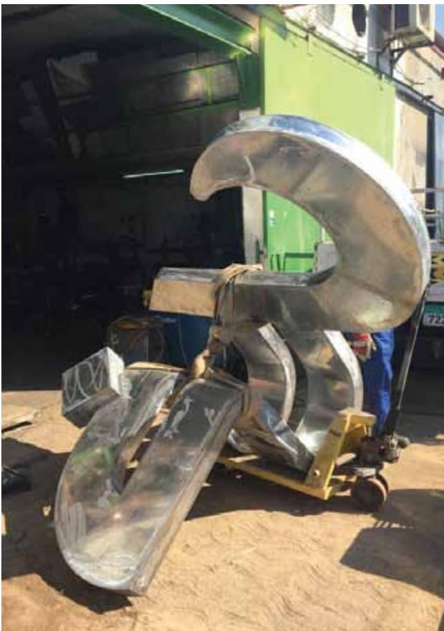
STEEL ARABIC LETTER GF - 027