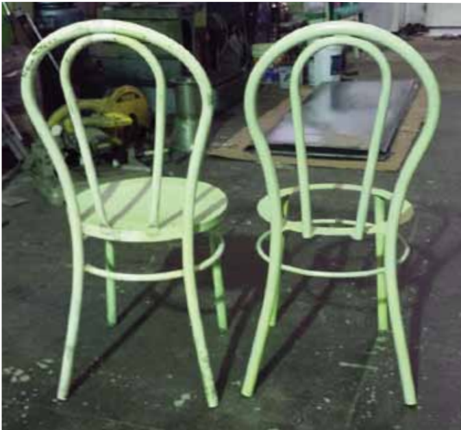
STEEL CHAIR FOR RESTAURENT GF - 017