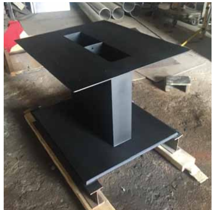
SS TEA TABLE GF - 032