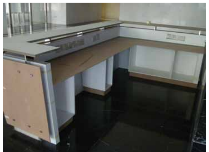
SS COUNTER INSIDE VIEW GF - 020