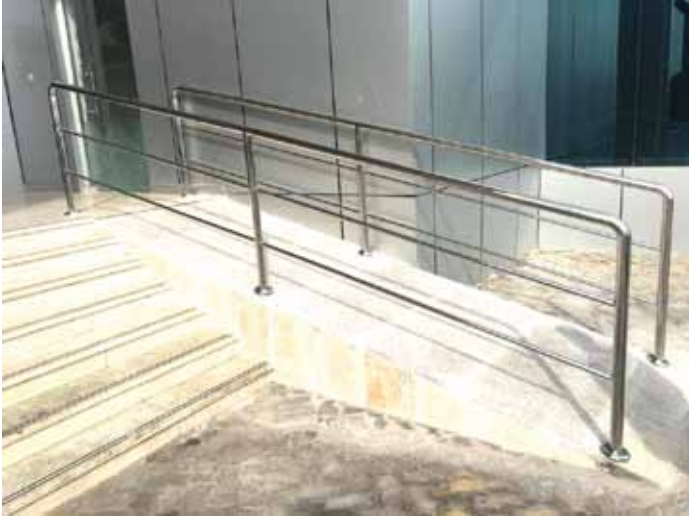
HANDRAIL GF - 007/1