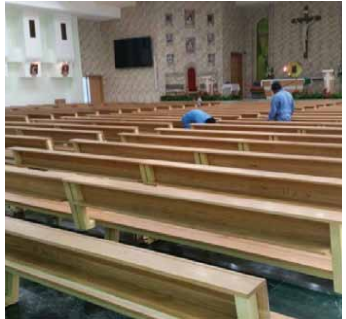
STEEL BENCHES FOR CHURCH GF - 042