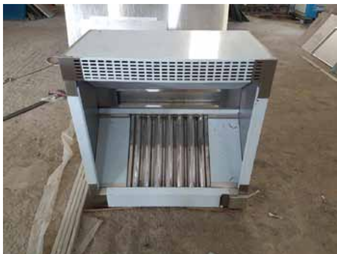
SS KITCHEN HOOD GF - 015