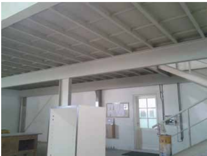
STEEL MEZANINE GF - 039