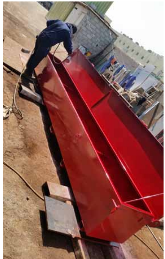
STEEL BOX FOR OFFSHORE PIPES GF - 005