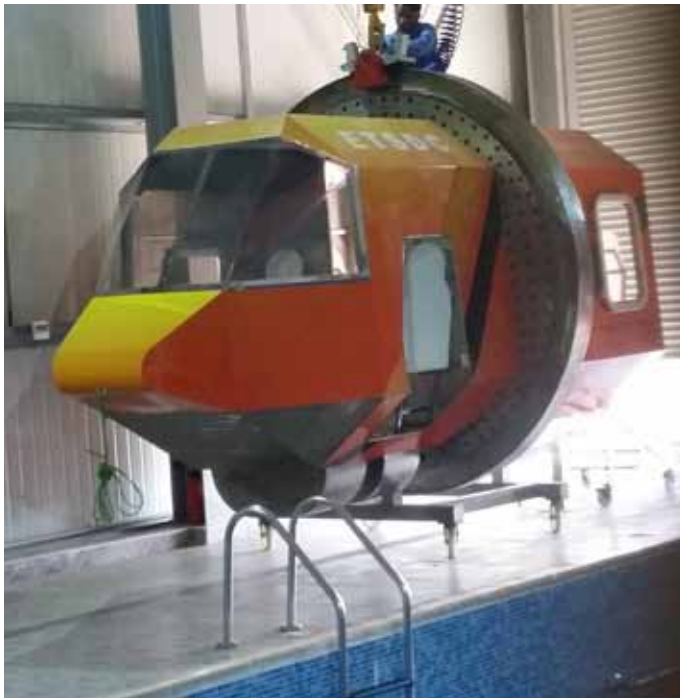
SIMULATOR GF - 002/2