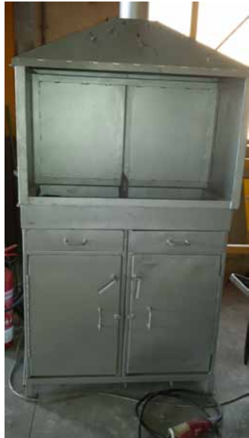
SS BARBIQUE GF - 011