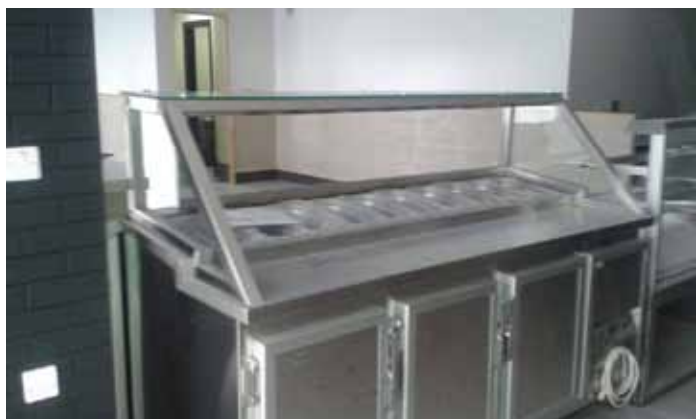
SS DISPLAY COUNTER GF - 013