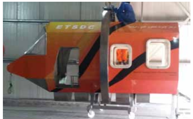
SIMULATOR SIDE VIEW GF - 002/3