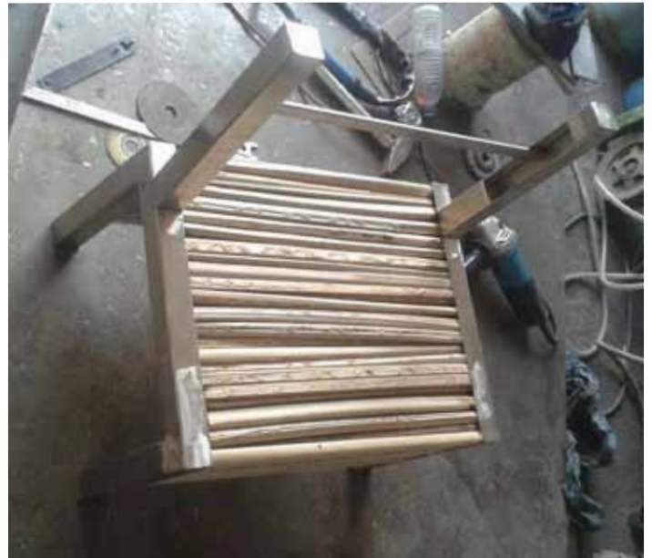
SS CHAIR GF - 018