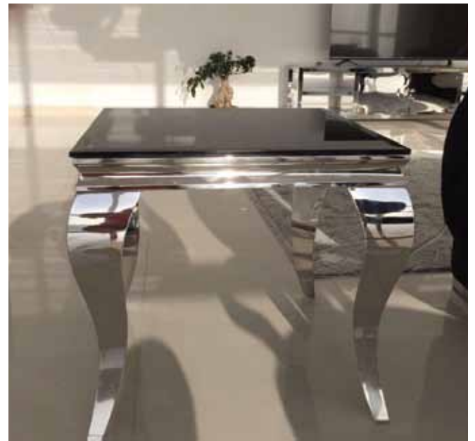
SS COFFEE TABLE GF - 030