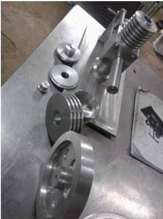
ALUMINIUM ENGINE PROJECT GF - 041