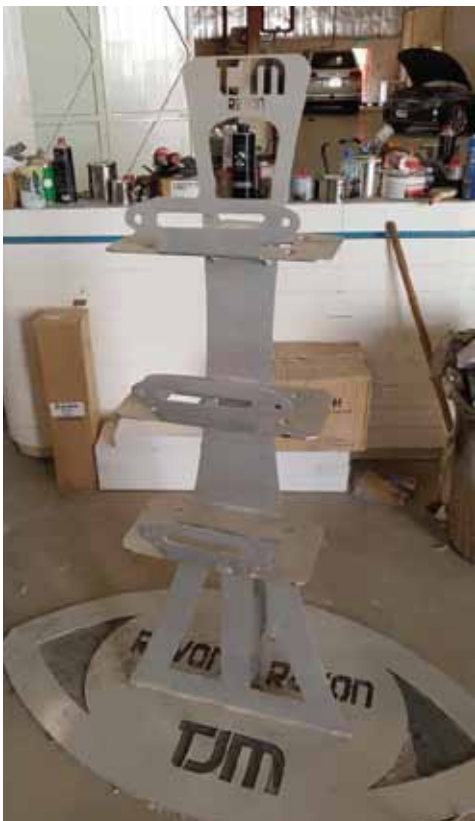
STEEL DISPLAY FOR SPARE PARTS GF - 043