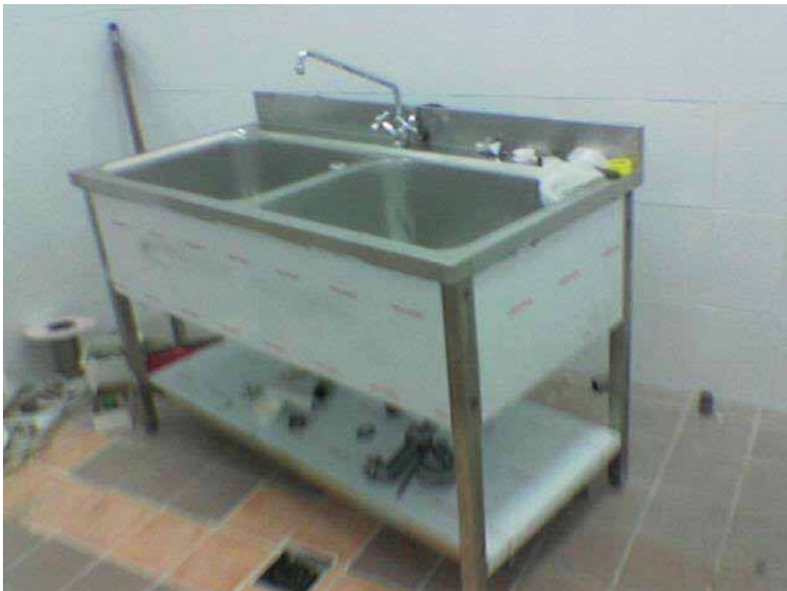
SS SINK GF - 012