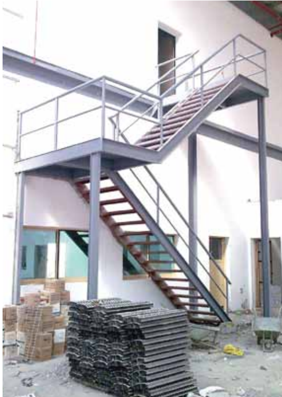
STEEL HANDREEL & STAIRCASE GF - 037