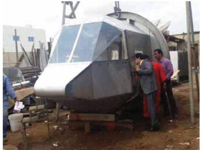
SIMULATOR STAINLESS STEEL BODY GF - 002/1