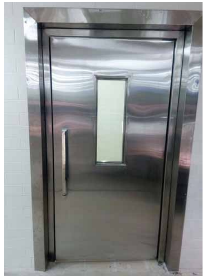
SSCOLD ROOM DOOR & HEAT RESISTANT GF - 024