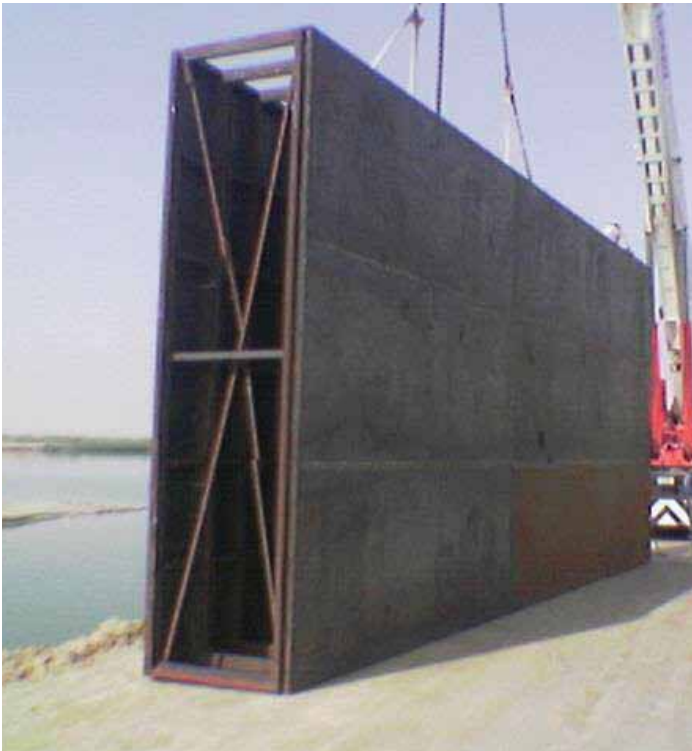
STEEL BODY GF - 004