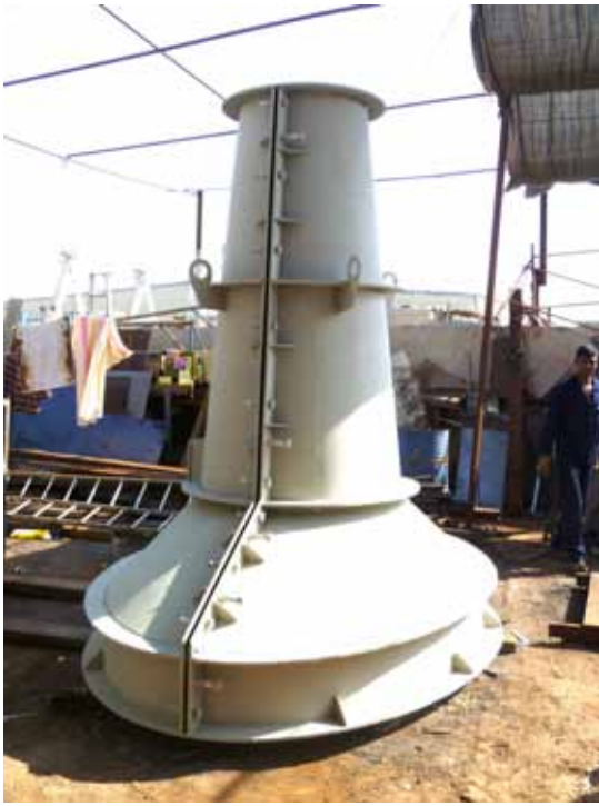
STEEL MOULD FOR CONCRETE PIPE GF - 003/1