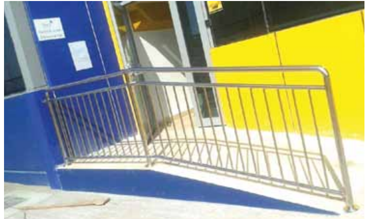
SS HANDRAIL GF - 007/2