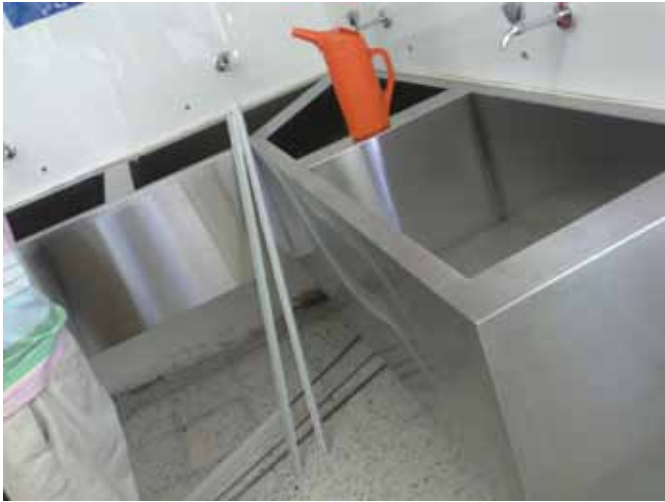
STAINLESS STEEL SINK GF - 010