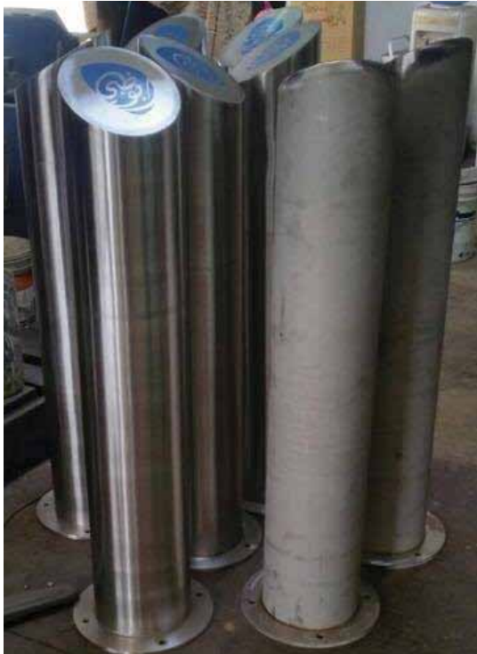
ABUDHABI SS BOLLARD 10 INCH GF - 006/1