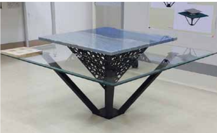
SS TEA TABLE GF - 031