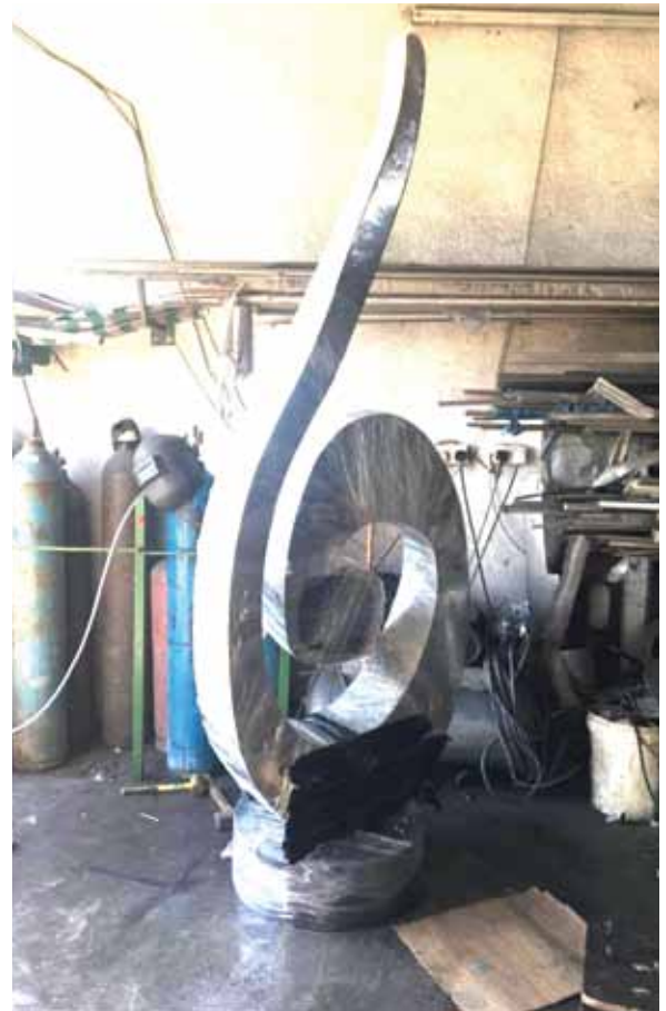
STEEL ARABIC LETTER GF - 028