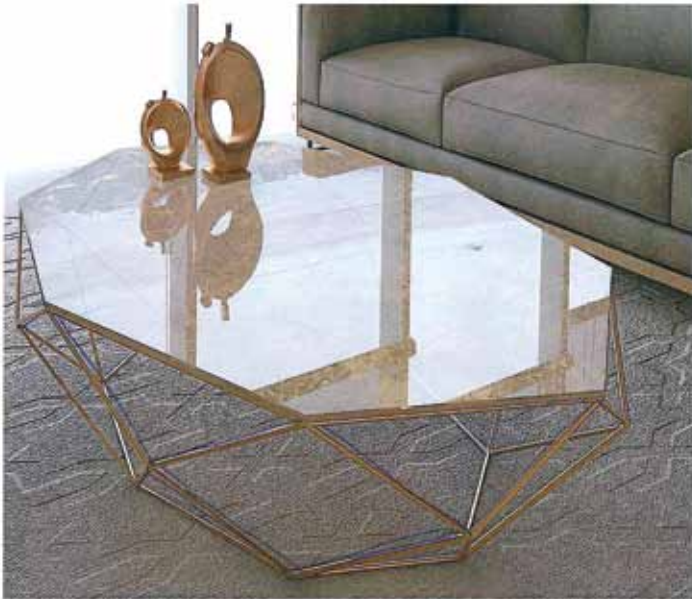
SS TEA TABLE GF - 029