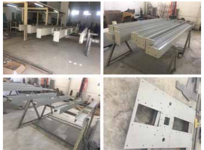
STEEL STRUCTURE FOR CATH LAB GF - 040