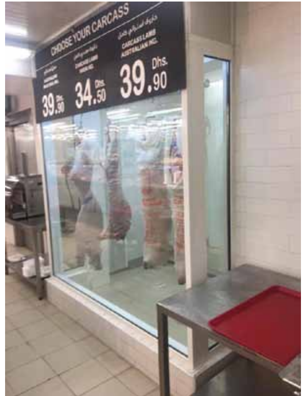
ALUMINUM BUTCHERY WITH SS HANGINGS GF - 038