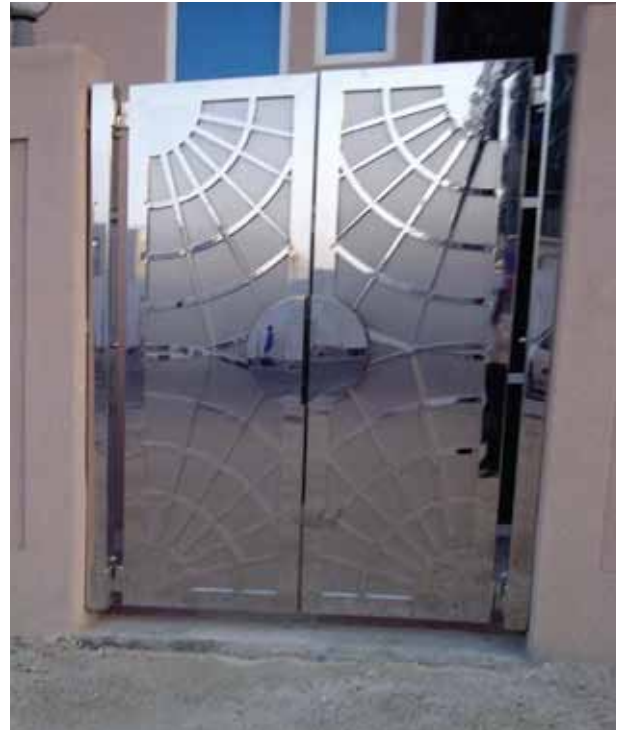
SS DOOR GF - 026