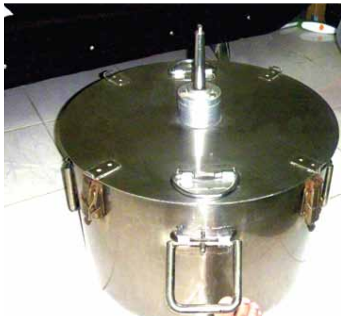
SS BOILER GF - 014