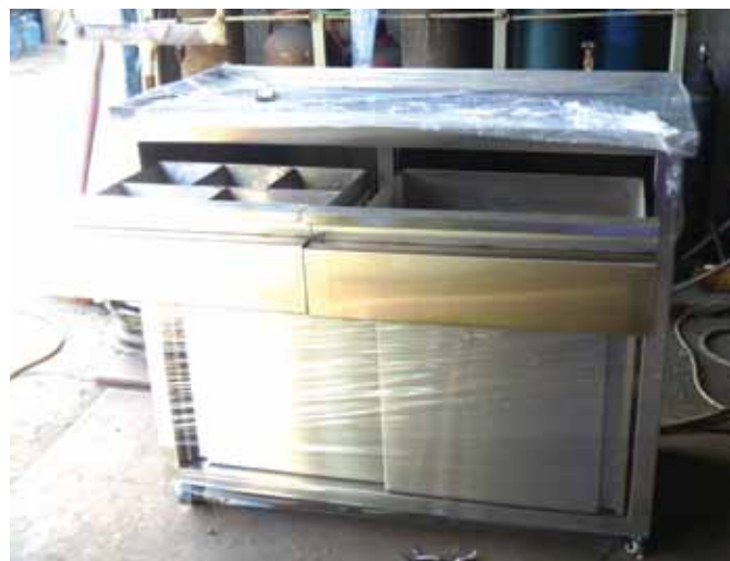
SS BASE CABINET GF - 016