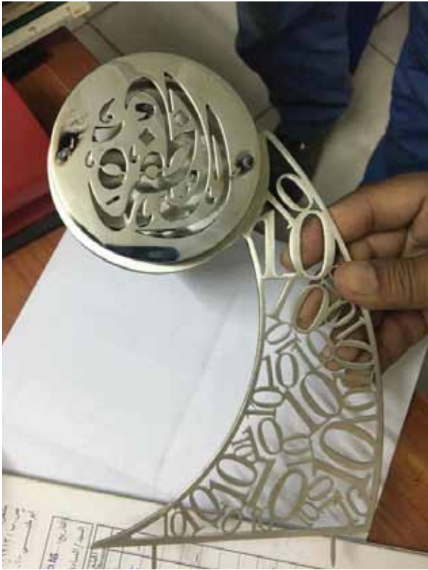
SS SOCCER AWARD