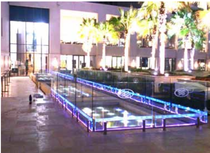
GLASS RAILING WITH SS BRACKETS (CROWN PLAZA HOTEL) GF - 008