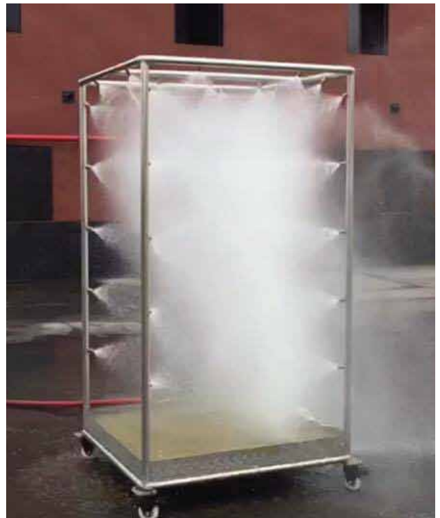
HAZMAT SS SHOWER GF - 044