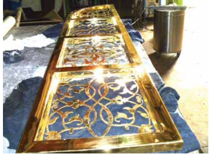
GOLD PLATED CALIGRAPHY DOOR GF - 022