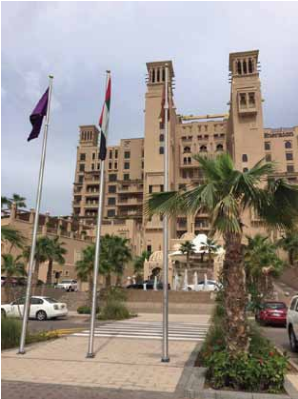
FLAG POLES GF - 001