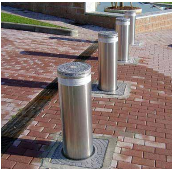
SS BOLLARD GF - 006/3