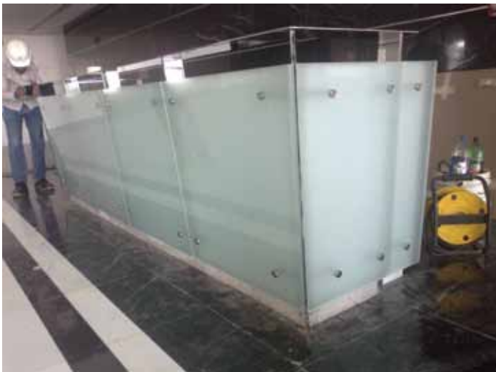
SS COUNTER FRONT SIDE GF - 019