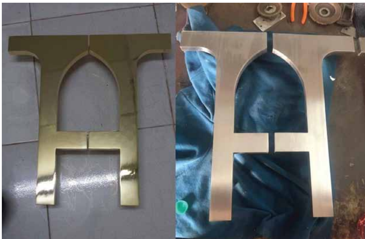
DOOR HANDLE GOLD GF - 045