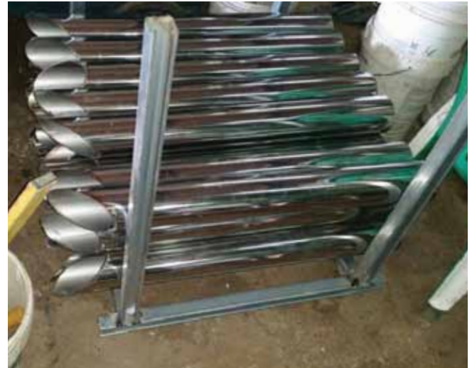
BOLLARD S 3 INCH GF - 006/2