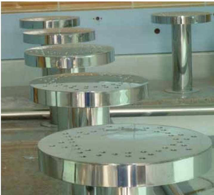
SS ABLUTION STOOLS