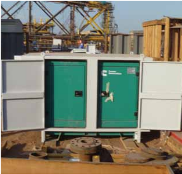
STEEL BODY FOR GENERATOR GF - 025