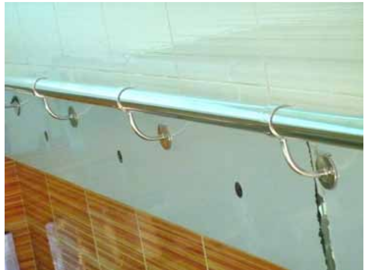
SS WALLMOUNT HANDRAIL GF - 009