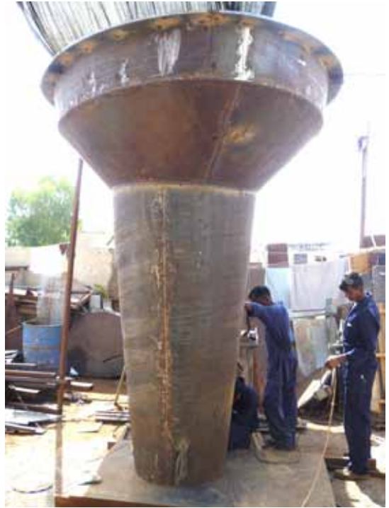
STEEL MOULD FOR PIPE GF - 003/2