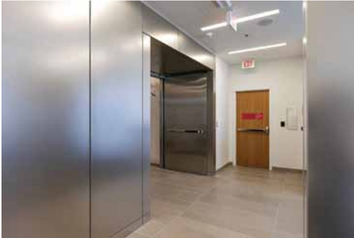
SS CLADDING GF - 021