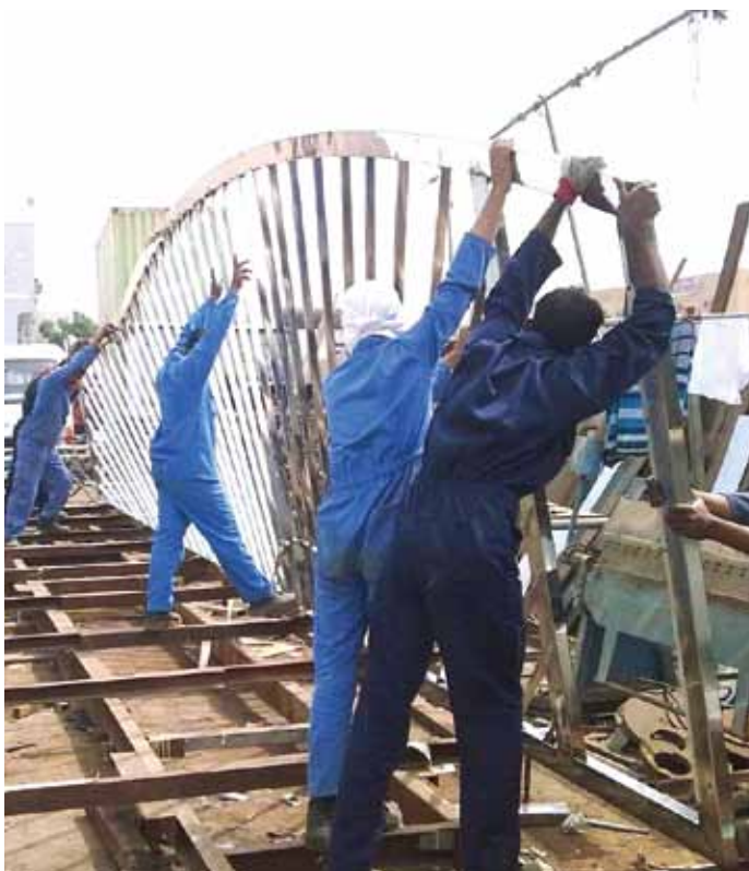
SS GATE GF - 023