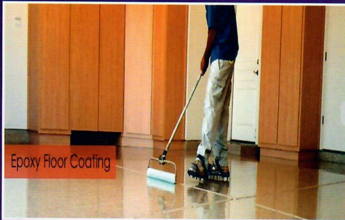
Epoxy Floor Coating