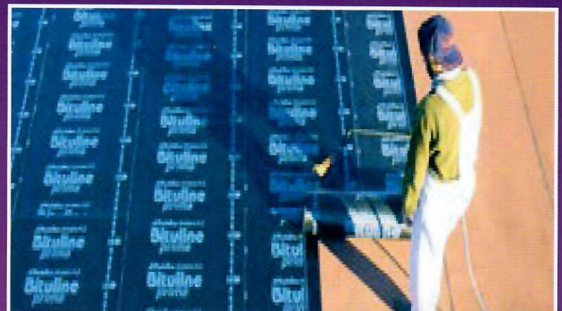
Water Proofing Work