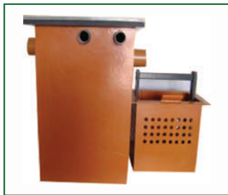
PVC Grease trap type A