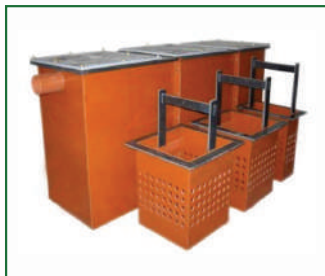
PVC Grease trap type C