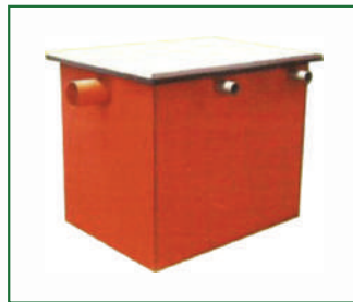
PVC Grease trap type B