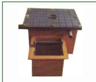
PVC Grease trap type D