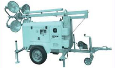
Mobile Light Tower And Other Products

ALFEY is dedicated to the design, assembly and distribution of high quality diesel generators starting at 10kW all the way to 1000 kW. During the manufacturing process our engineers select the best and highest quality components available from award winning brands like Caterpillar, Perkins, Cummins, Stamford, Leroy Somer and more. We are committed to supplying top quality diesel generators to our customers.