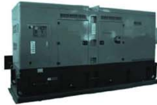
Cummins Powered Diesel Generator