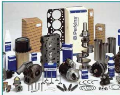
Perkins spare parts Original & Aftermarket