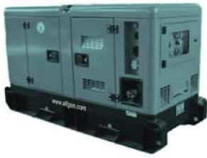
Perkins Powered Diesel Generator