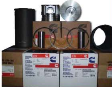
Cummins spare parts Original & Aftermarket