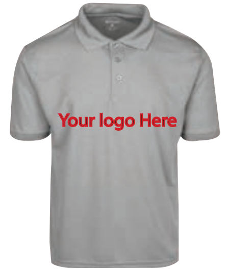
Mesh / Dri Fit T-shirts