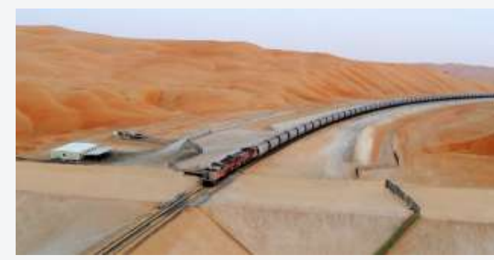
Etihad Rail, UAE