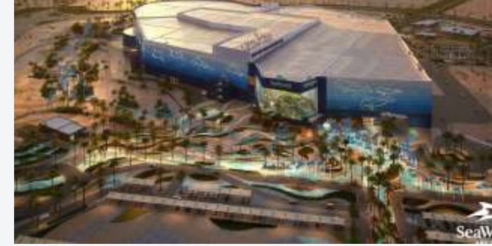
Sea World, Abu Dhabi