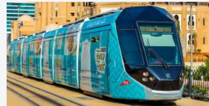
Dubai Tram, Dubai