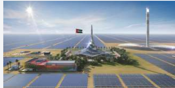
Noor Energy Solar Power Project, Dubai