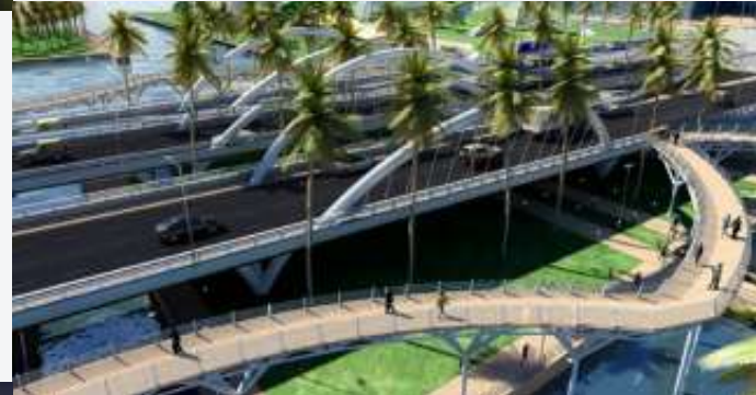
Shams Bridge, Abu Dhabi