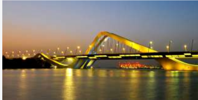
Sheikh Zayed Bridge, Dubai