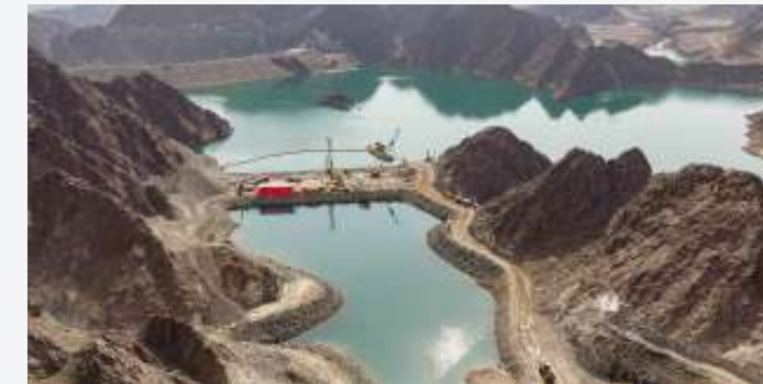
Hatta Hydroelectric Project, Dubai