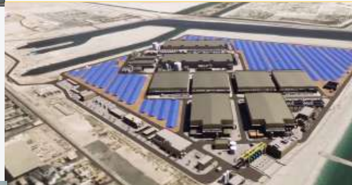
2 Taweelah Desalination Plant, Abu Dhabi