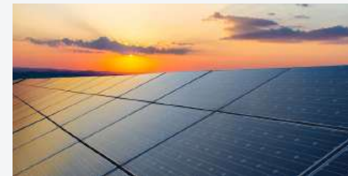
Al Dhafra Solar Project, Abu Dhabi