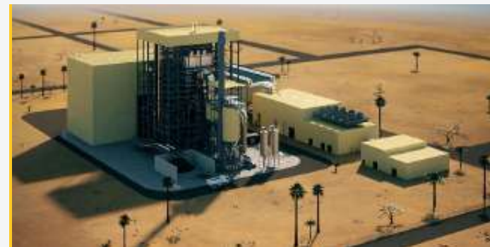
SWAP - BEE'AH Project, Sharjah