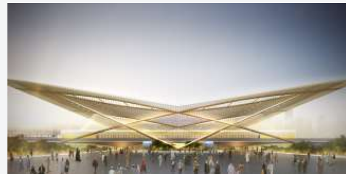
Expo 2020 Link - Dubai Metro, Dubai