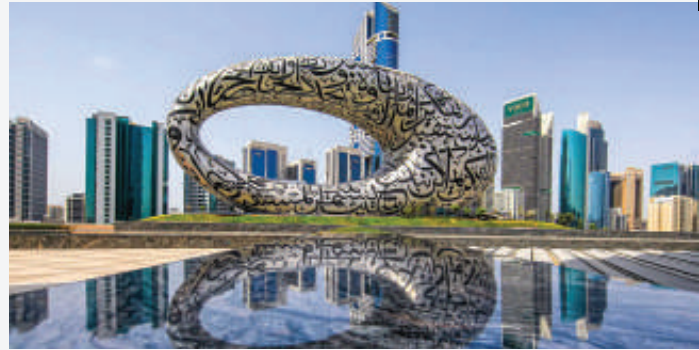
Future Museum, Dubai