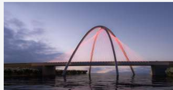
Umm Lafina Bridge, Reem Island