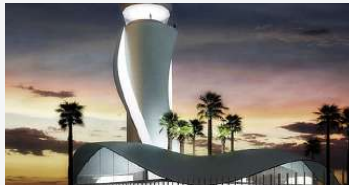
Fujairah International Airport, Fujairah