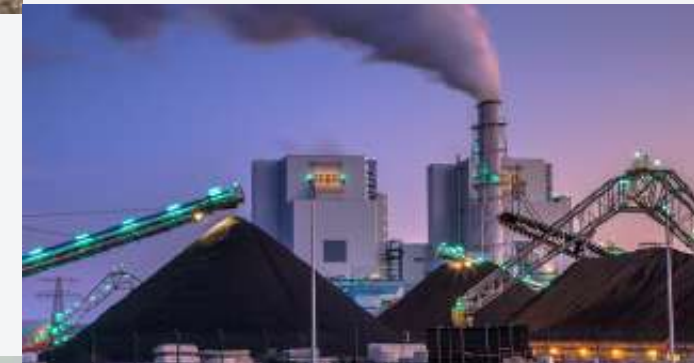
5 Hassyan Power Plant, Dubai