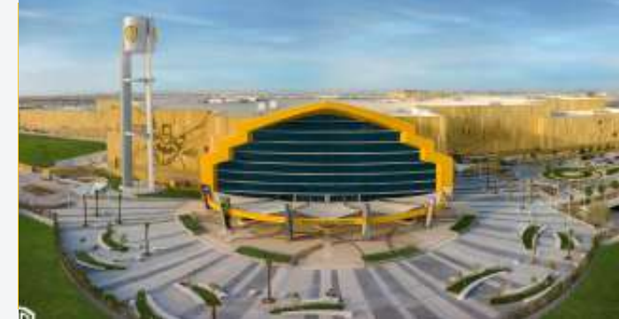
Warner Bros, Yas Island