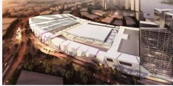
Reem Mall, Reem Island