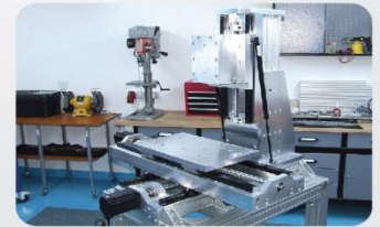
Hobbing Machine Surface Grinding Machine Cylindrical Grinding Machine Universal Vertical Milling Machine