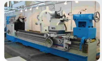
Lathe Machines Gear Shaper