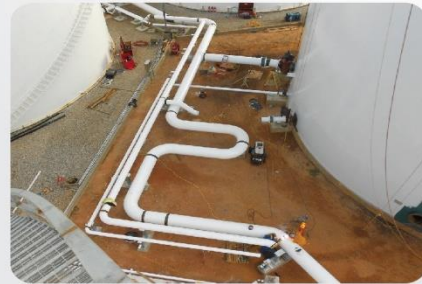
Piping and support work of chilled water plant, ETS Rooms and installation of chillers Heat Exchanger and valves.