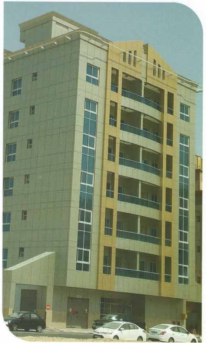
G+6 Res. BLDG ON PLOT No.R-8-6 (682-1386)