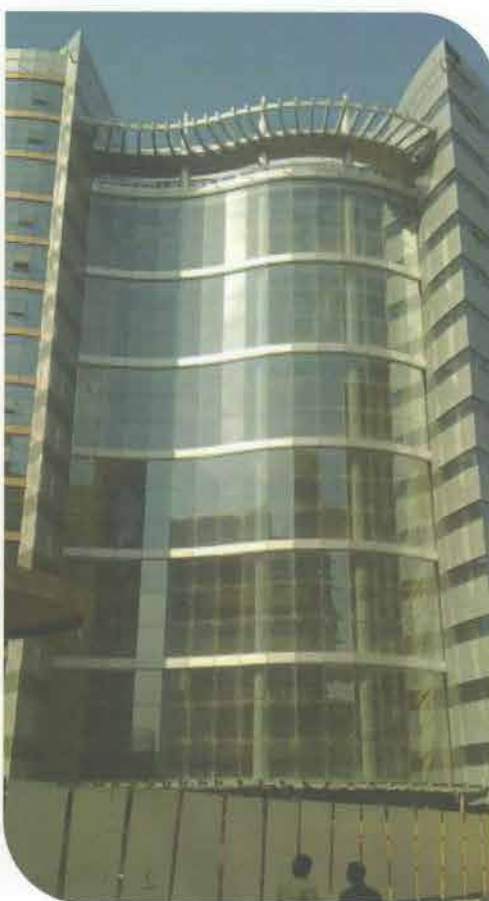
14 RESIDENTIAL & OFFICE BUILDING PLOT No. 373 -1307 at AL BARSHA