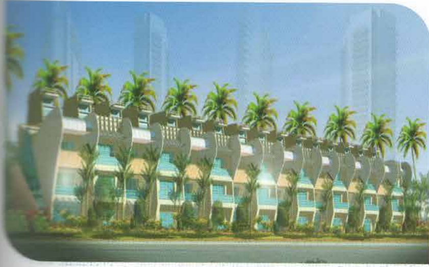
16 Nos Residential Villa at JUMEIRA VILLAGE (JVC)