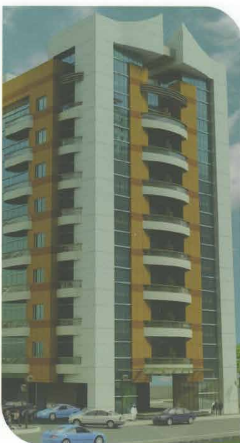
Dubai Silicon Oasis, Plot No. 13-003

All Internal Doors, Windows & External Concealed Windows