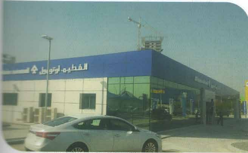
AL FUTTAIM AUTOMALL, DUBAI FESTIVAL CITY