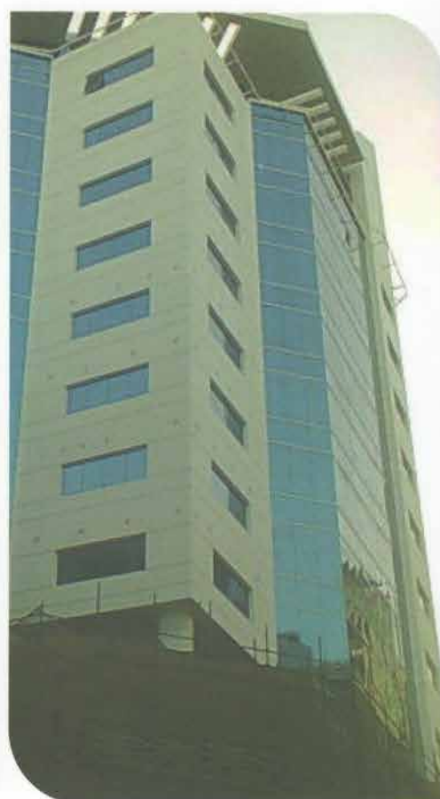
2B+G+13+ROOF BLDG ON PLOT No. 373-9344 at AL BARSHA 1ST DUBAI

All Curtain wall, Windows & External Aluminium Cladding