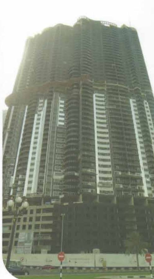
G+5P+HC+43TYP+PH+HP BUILDING PLOT No.1032 at AL KHAN, SHARJAH (ASAS TOWER)