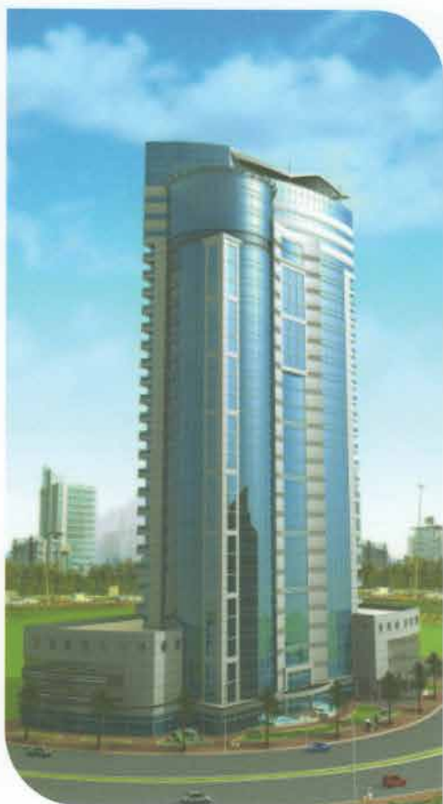
BASSAM TOWER IN TECOM DUBAI

All Internal Doors, Windows & External Concealed Windows