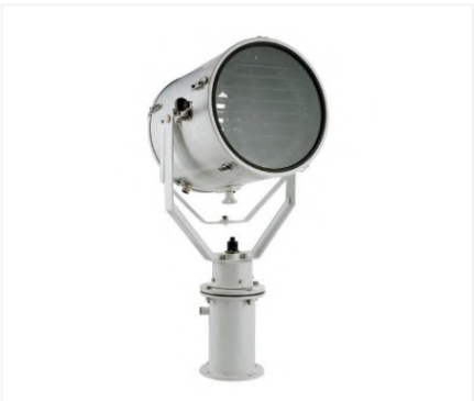
NAVIGATION LIGHT PORTSIDE SINGLE