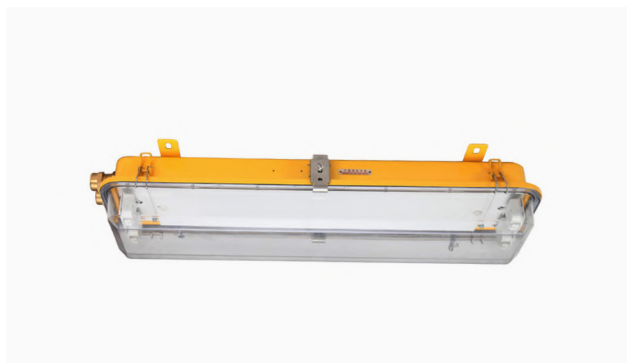
Increased Safety Fluorescent Ceiling Light Ip67 100-220v Ip66 Exproof Cfyd