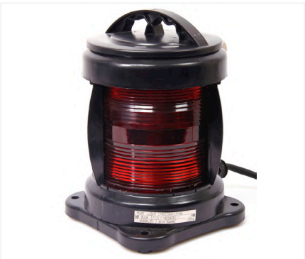
NAVIGATION LIGHT PORTSIDE DOUBLE