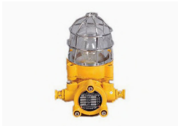
PENDANT LIGHT 250V 60W