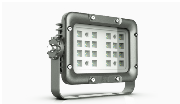
Exproof Led Floodlight 100-220V 100&200W IP67