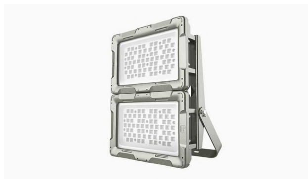
Exproof Led Floodlight 100-220V 400W IP67