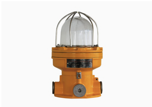
PENDANT LIGHT 250V 60W

Seal Structure, Corrosion resistance and water-proof Fitting for work site such as deck, dock, cargo, workshop etc.