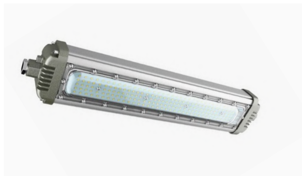
Led Exproof Light BF52 60W