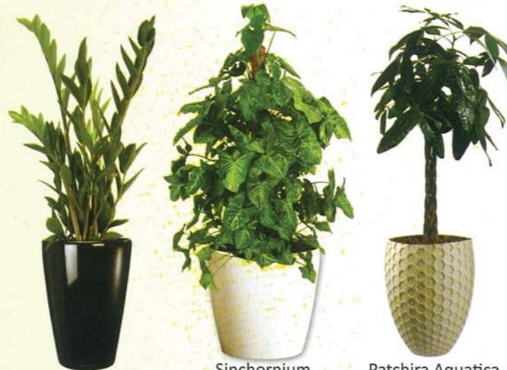
Zamia Culcus GCP 097