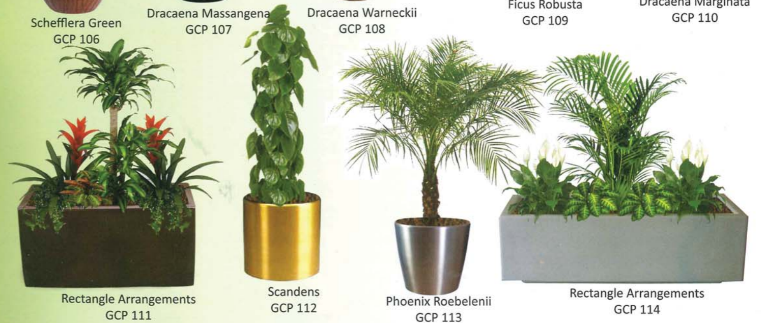
Rectangle Arrangements GCP 111