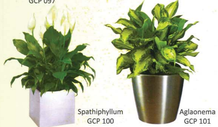
Spathiphyllum GCP 100