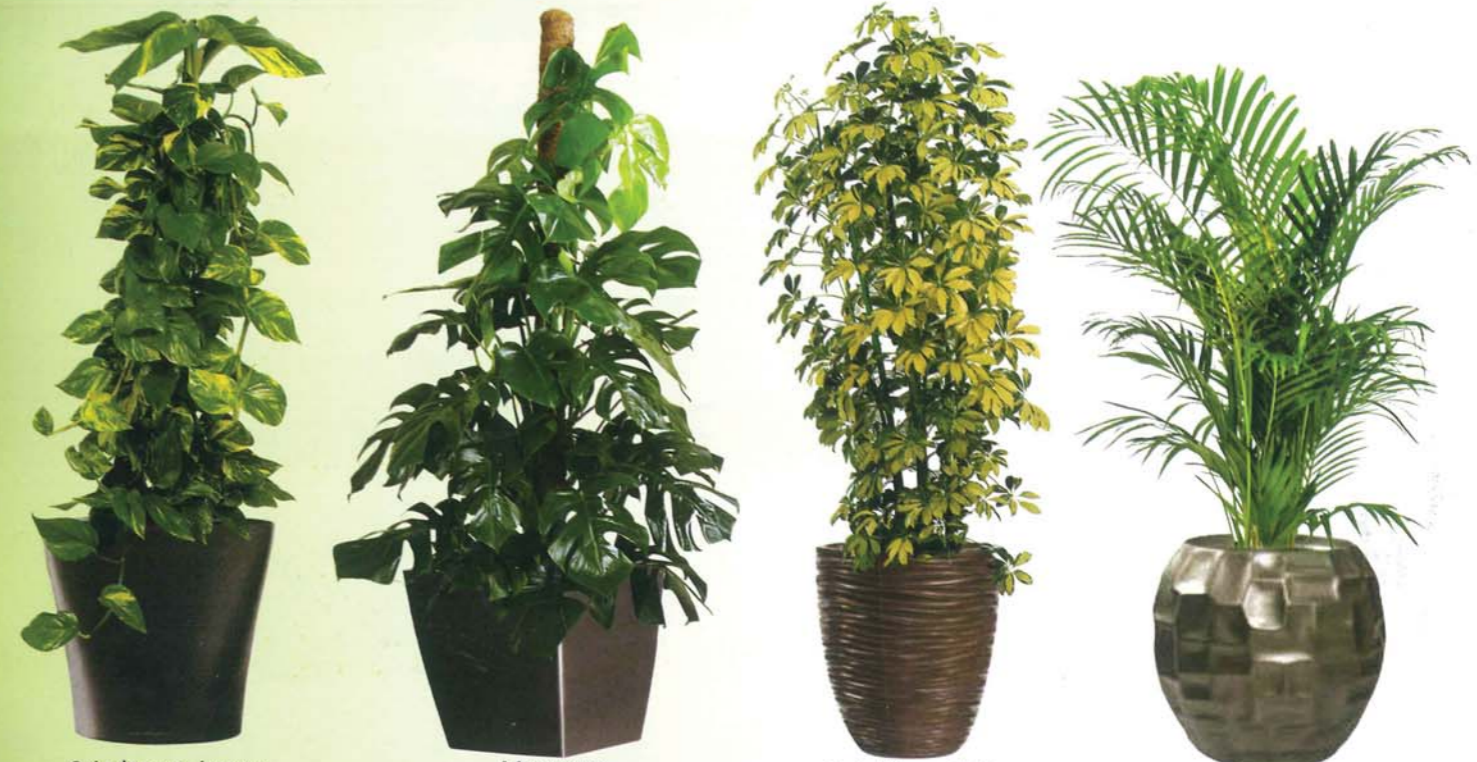
Scindapsus Aureus GCP 102