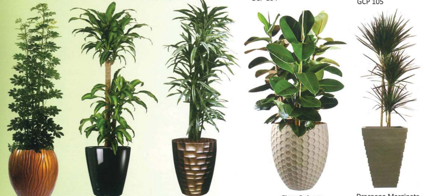
Schefflera Green GCP 106