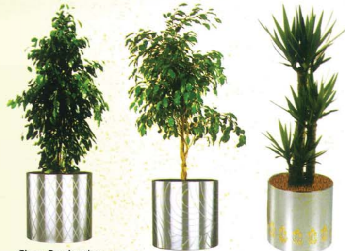
Ficus Benjamina GCP 092

Contact us online: info@gcplandscaping.com