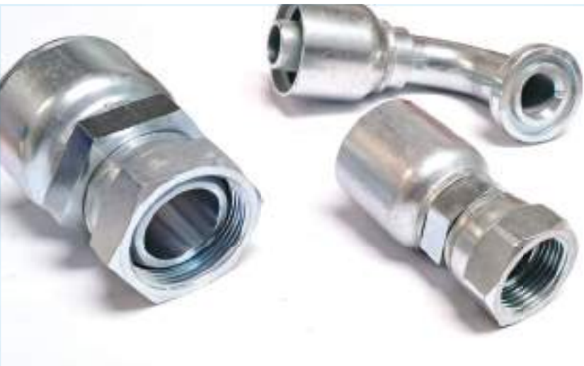
ONE PIECE FITTINGS