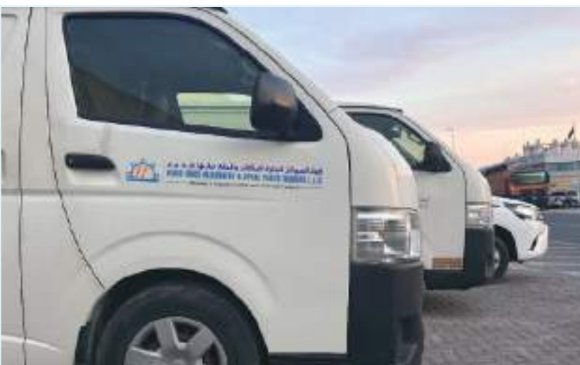
24x7 Hydraulic Mobile Van Service