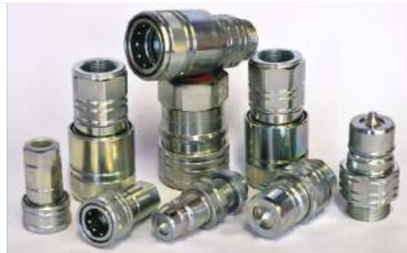
QUICK RELEASE COUPLING