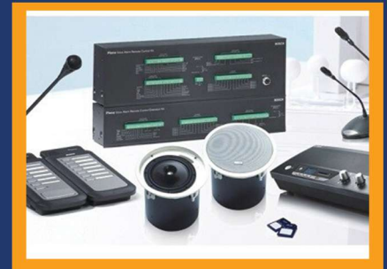
PUBLIC ADDRESS SYSTEM