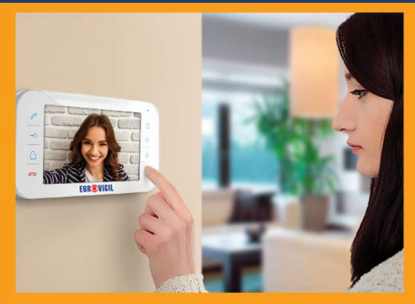
AUDIO VIDEO INTERCOM SOLUTION