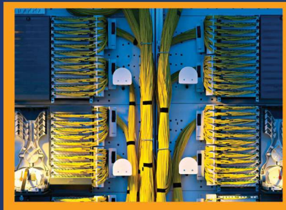
FIBER OPTIC AND STRUCTURED CABLING