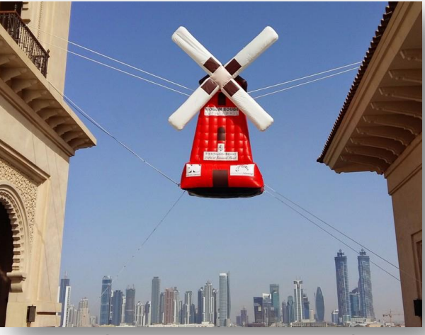
Moulin Rouge Event -April 2015