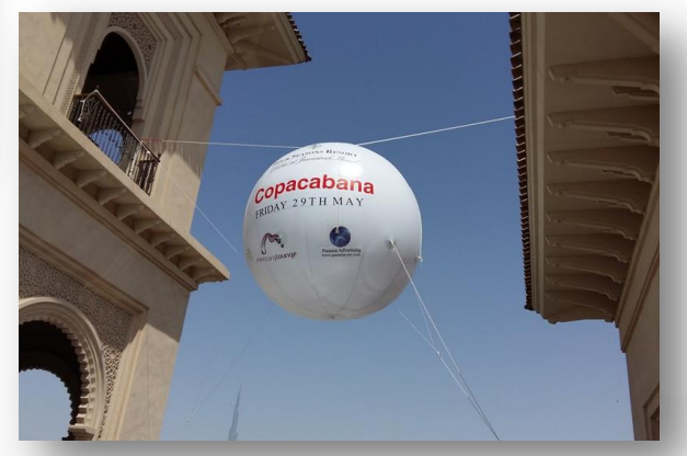
Copacabana Event -May2015