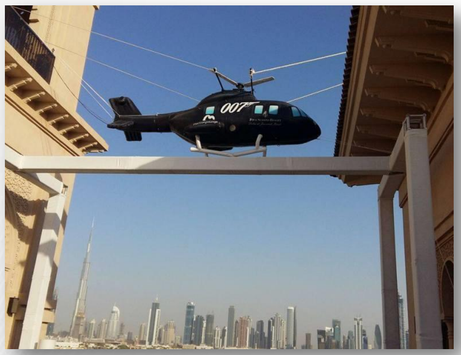
James Bond Event -September 2015