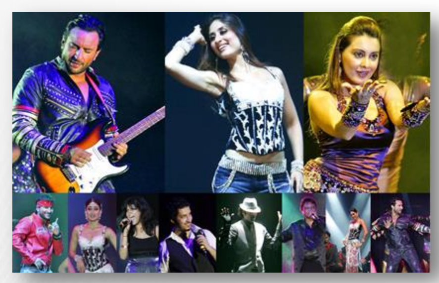
Jashn 2008 – Bollywood Musial Concert