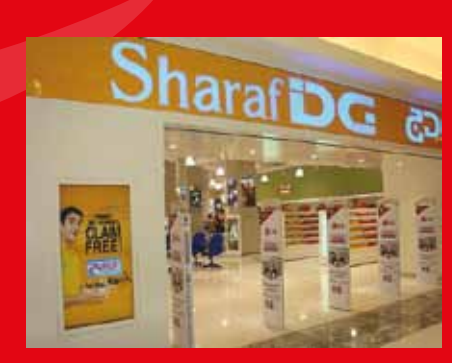
Sharaf DG, Dalma Mall