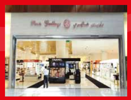
Paris Gallery, Al Ain Mall