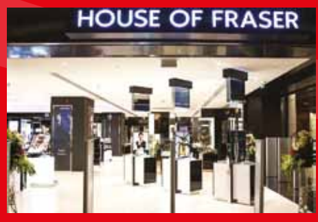
House of Fraser, Yas Mall