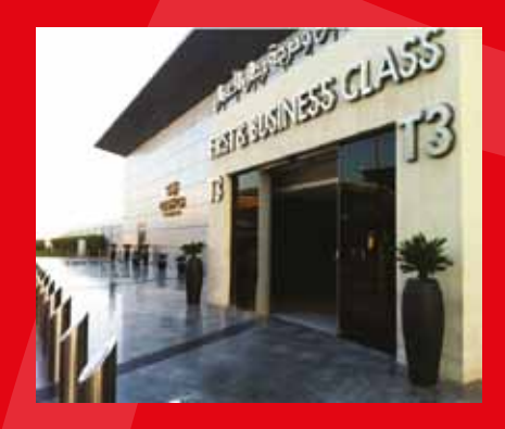
Abu Dhabi Airport (T3)Lounge