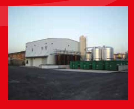
Life Drop Water Factory