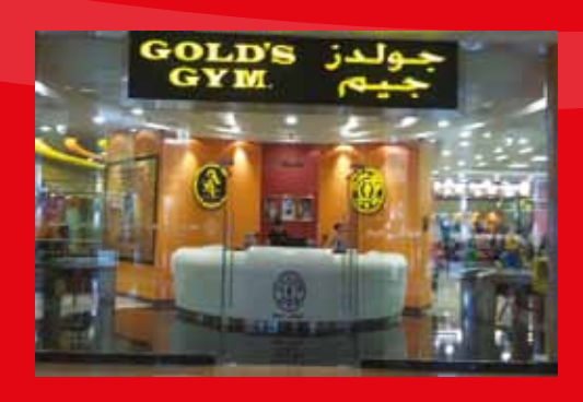
Gold's Gym, Al Ain