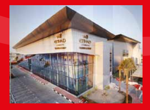
Etihad Training Center