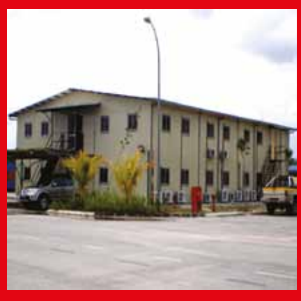
Site Office, Alpha Data, Ruwais