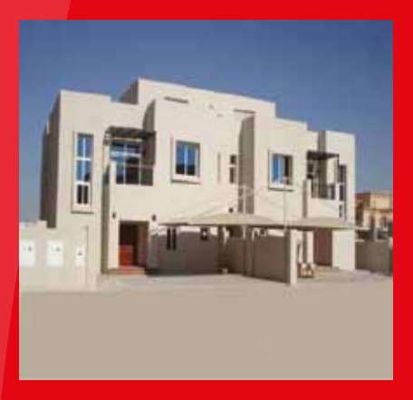
Commercial Villa, Al Ain