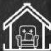
ONE STOP SOLUTION