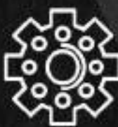
MEP & IT