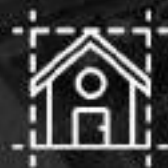
DESIGN & BUILD