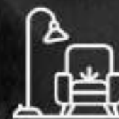
FURNITURE & JOINERY