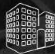
INTERIOR RENNOVATION & MODIFICATION