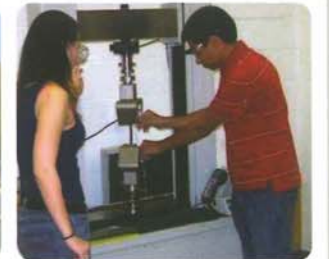
Tensile Strength Test (Steel)