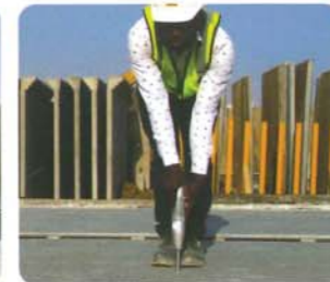
Schmidt hammer Test