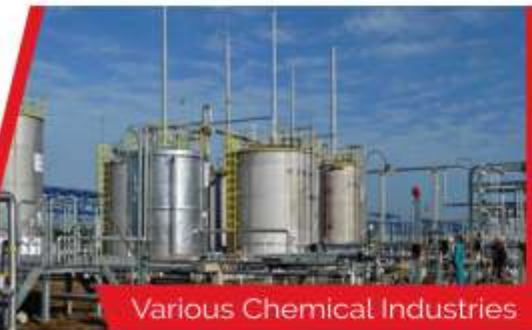
Various Chemical Industries