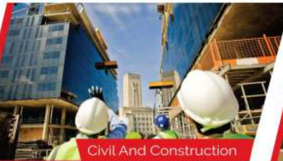
Civil And Construction