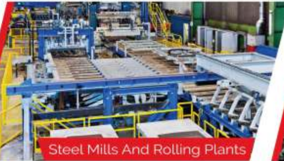
Steel Mills And Rolling Plants