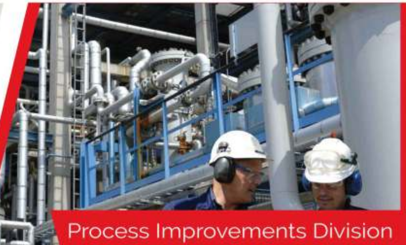
Process Improvements Division