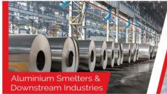
Aluminium Smelters & Downstream Industries