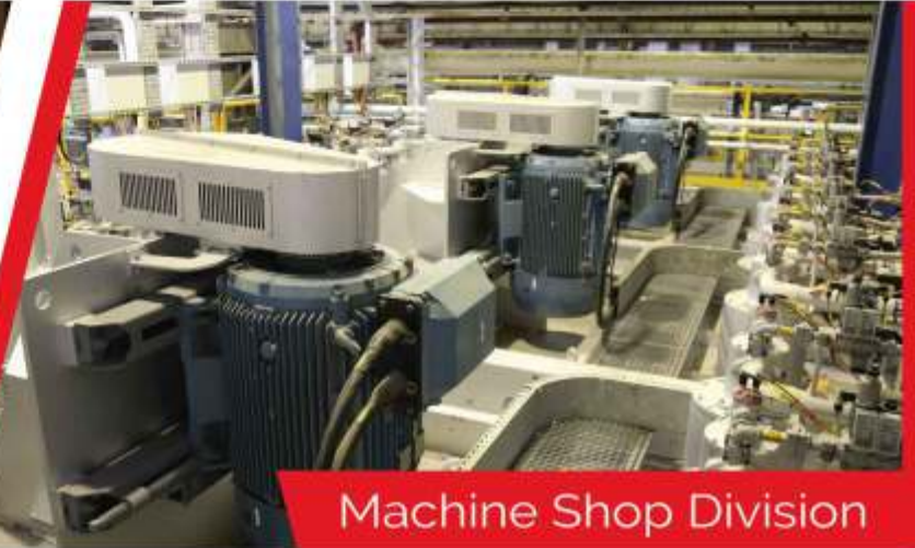
Machine Shop Division