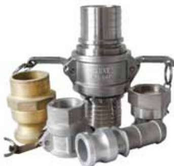
Cam & Groove Coupling