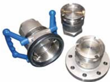
Dry Disconnect Coupling