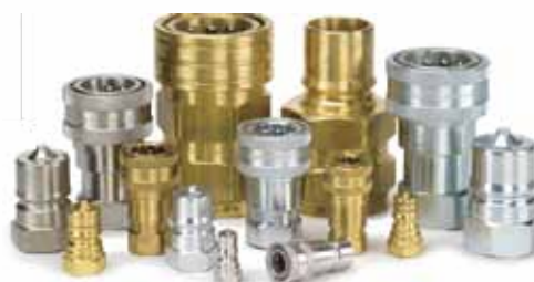
Hydraulic Quick Coupler