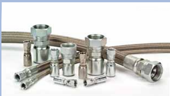
Hydraulic Hose Fittings