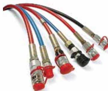
High Pressure Thermoplastic Hoses