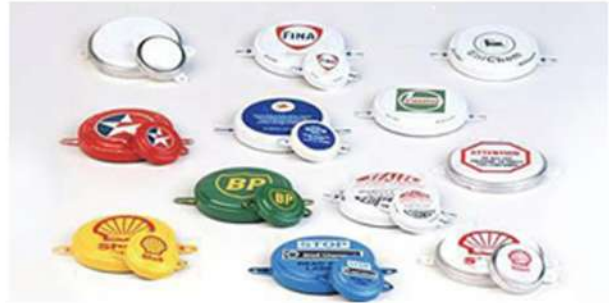
DRUM ACCESSORIES CAPS