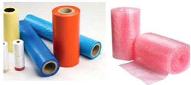
SHRINK FILM / BUBBLE WRAP