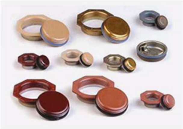
DRUM ACCESSORIES CAPS