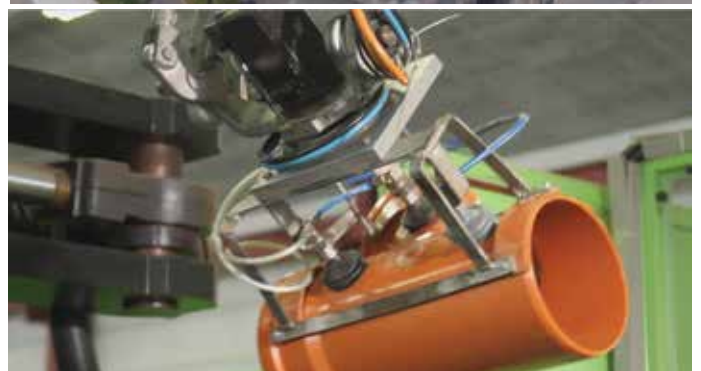
Site visit , Seminars & Factory Photos