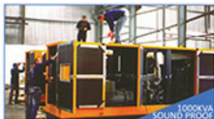
1000KVA SOUND PROOF