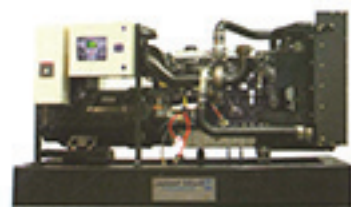
GENSETS OPEN TYPE 10-80 KVA