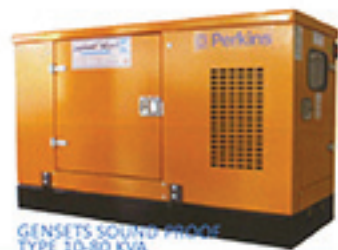
GENSETS SOUND PROOF TYPE 10-80 KVA