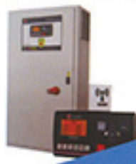
SUBMERSIBLE PUMPS PANELS