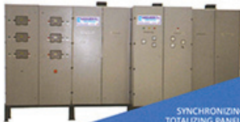
SYNCHRONIZING TOTALIZING PANELS