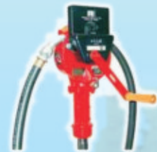
FILL-RITE ROTARY HAND PUMPS