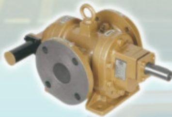
ROTARY GEAR PUMPS