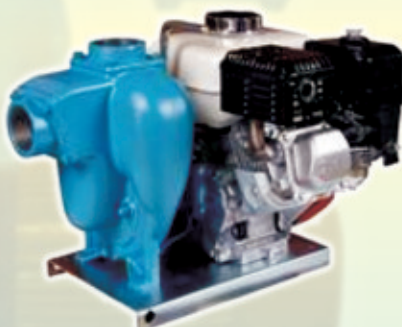
MP PUMPS SELF PRIMING CENTRIFUGAL PUMP WITH DIESEL ENGINE