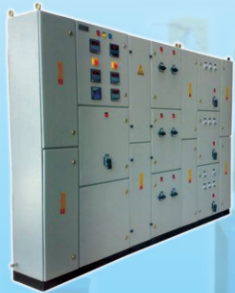
CONTROL PANEL BOARD