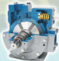
CORKEN ROTARY VANE FUEL TRANSFER PUMP - U.S.A.