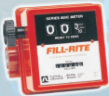
FILL-RITE FUEL FLOW METER SERIES 800