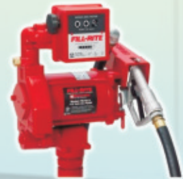
FILL-RITE DC FUEL TRANSFER PUMPS