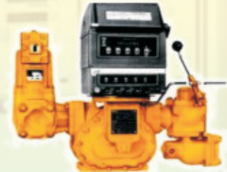
LIQUID CONTROLS (LC) FUEL FLOW METER - U.S.A