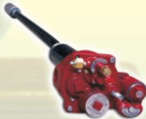
STANDARD SUBMESIBLE PETROLEUM PUMP - U.S.A.