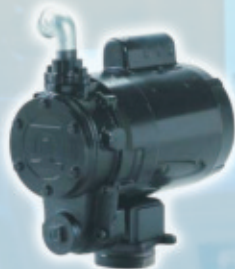
FILL-RITE LUBE OIL TRANSFER PUMP