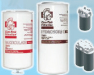
FUEL FILTERS - U.S.A.