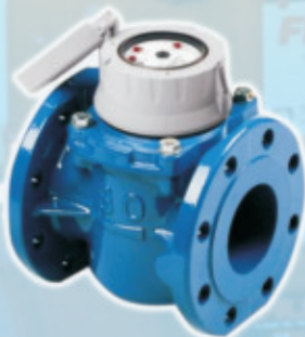
ELSTER RENT WATER METERS