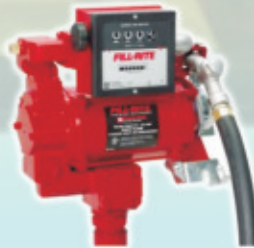
FILL-RITE AC FUEL TRANSFER PUMPS