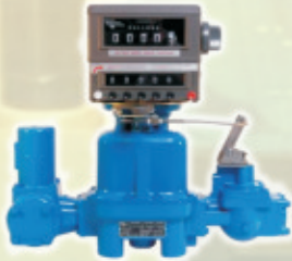
TOTAL CONTROL SYSTEMS (TCS) PISTON FUEL FLOW METER - U.S.A