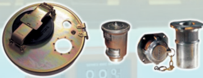
MANHOLE COVER WITH P.V. VENT & DIP TUBE MANDREL