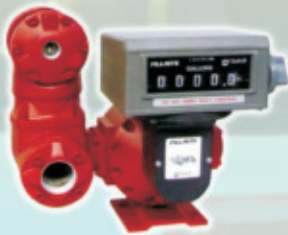
FILL-RITE TS SERIES