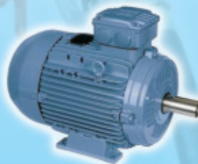
EXPLOSION PROOF ELECIC MOTOR BRAZIL