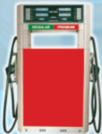
DRESSER WAYNE ELECTRONIC / DIGITAL DISPENSING PUMP - BRAZIL / U.S.A.