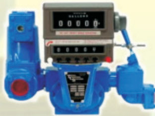
TOTAL CONTROL SYSTEMS (TCS) FUEL FLOW METER - U.S.A