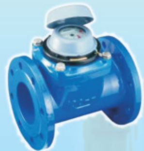
WATER METERS - B-METER - ITALY MODEL : WDEK30