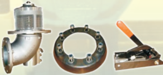
EMERGENCY VALVE, SUMP & LEVER