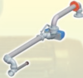
BOTTOM LOADING ARM