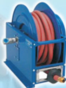
COX REELS HOSE REELS