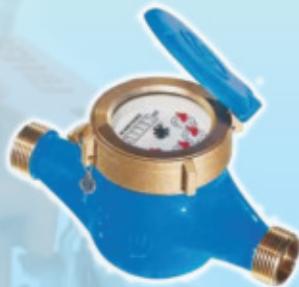
WATER METERS - B-METER - ITALY MODEL : GMD X