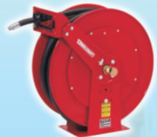
REEL CRAFT HOSE REELS