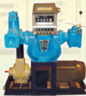
TOTAL CONTROL SYSTEMS (TCS) FLOW METER WITH PUMP & MOTOR