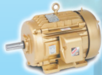
EXPLOSION PROOF ELECIC MOTOR U.S.A.