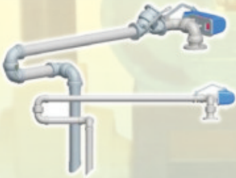
TOP LOADING ARM