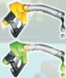
AUTOMATIC SHUT OFF NOZZLE - U.S.A