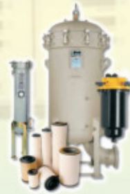
FILTER WATER SEPERATER