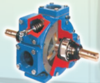
BLACKMER FUEL PUMP - U.S.A.