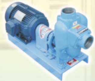
MP PUMPS SELF PRIMING CENTRIFUGAL PUMP - U.S.A.