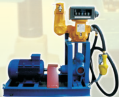
LIQUID CONTROLS (LC) FLOW METER WITH PUMP, MOTOR, HOSEPIPE & NOZZLE