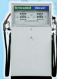
MECHANICAL DISPENSING PUMPS - INDIA