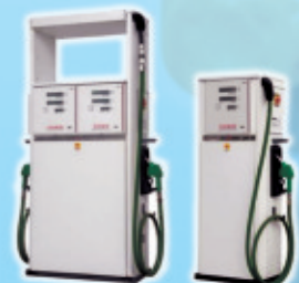
ELECTRONIC / DIGITAL DISPENSING PUMPS - INDIA