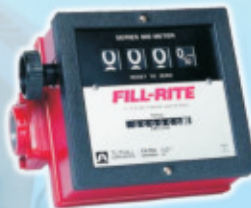
FILL-RITE FUEL FLOW METER SERIES 900