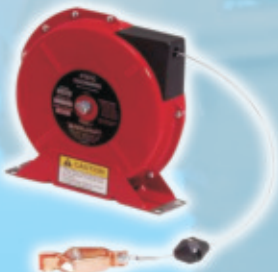
STATIC DISCHARGE REEL