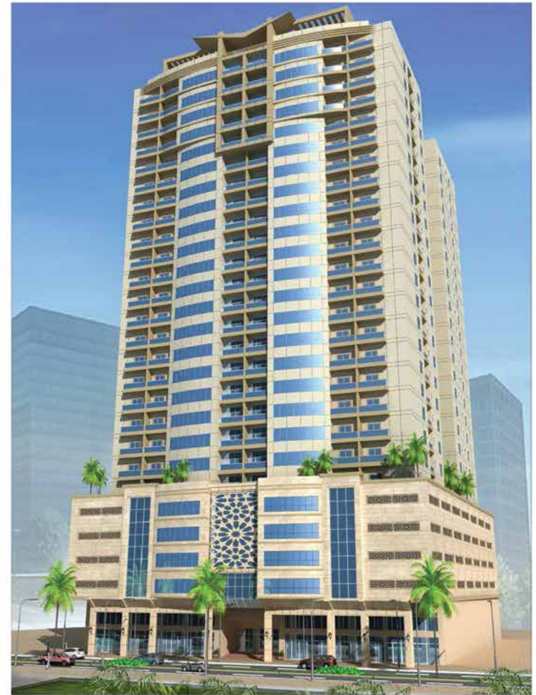
G+5p+ 23 Floors Residential Building Alkhan, Sharjah