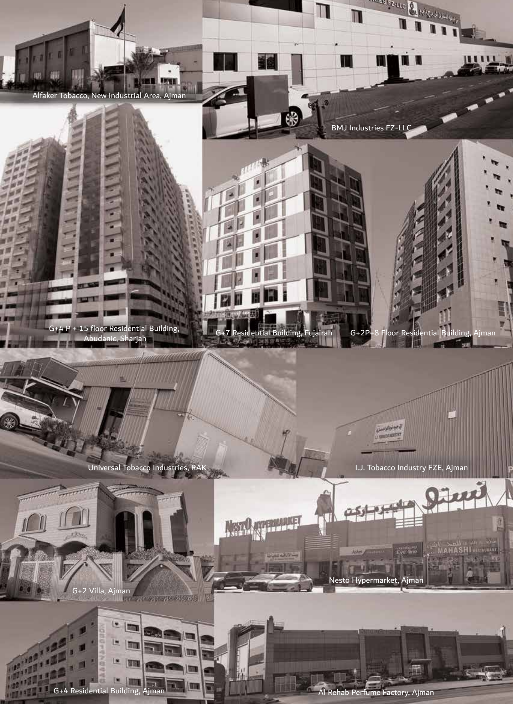
Alfaker Tobacco, New Industrial Area, Ajman