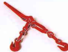
LOAD BINDER LEVER TYPE