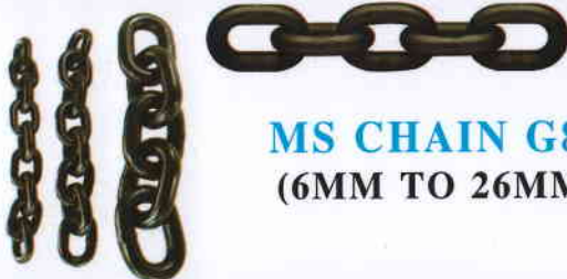
MS CHAIN G80 (6MM TO 26MM)