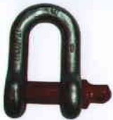
D'SHACKLE SCREW PIN TYPE