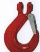
SLING BELT HOOK