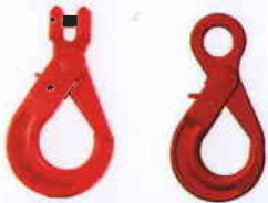
SELF LOCKING HOOK