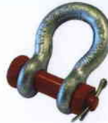
BOW SHACKLE NUT BOLT TYPE