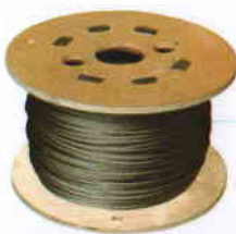
S.S WIRE ROPE GR.304