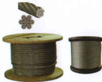
GI WIRE ROPE STEEL CORE (UPTO 22MM)