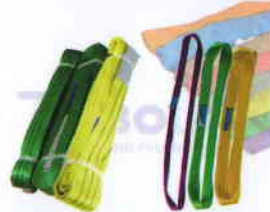
FLAT/ROUND SLING BELT (2PLY & 4PLY UPTO 24 TON)