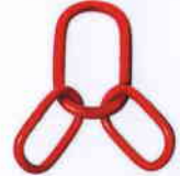
MASTERLINK WITH ASSEMBLY