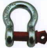
BOW SHACKLE SCREW PIN TYPE