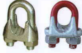
WIRE ROPE CLIP / HDG WIRE ROPE CLIP