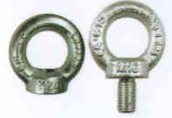
EYEBOLT & EYE NUT