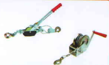
HAND PULLER & HAND WINCH