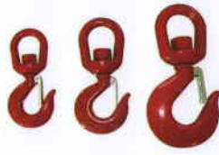
SWIVEL EYE HOOK