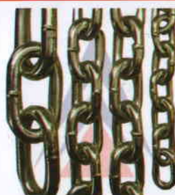
GI CHAIN (6MM TO 25MM)