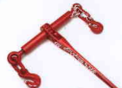
LOAD BINDER RATCHET TYPE