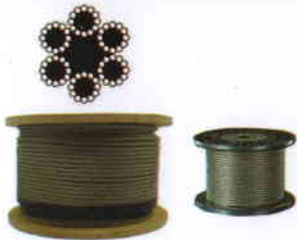
GI WIRE ROPE