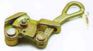
WIRE ROPE GRIP PULLER