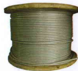
GI WIRE ROPE PVC COATED