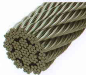
NON ROTATING WIRE ROPE (UPTO 22MM)