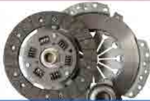
Clutch Plates / Pressure Plates