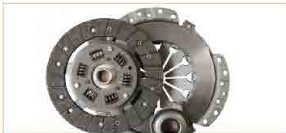
Clutch Plate / Pressure Plate

We specialize in replacement parts for VOLVO trucks and construction equipments. We deal in Engine Piston & liner kits, Oil Seals, Head Gaskets & overhaul gasket kits, Turbo chargers, Rubber mountings, clutches, air compressors & repair kits, gear parts, Z-cam brake parts, brake shoes, brake drums etc. We are distributors for Swedish Lorry Parts, Sweden.