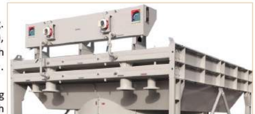
Air Cooled Exchanger (Fin Fan Coolers)

Also we have a facility to manufacture Finned Tubes on the latest state of the art McElroy Mark IV Finning Machine of U.S.A. Can be supplied with various types of Fins like 'L', 'G' & 'KL' can be manufactured with Aluminium & Copper material. Base Tube Size ranges from 5/8" OD to 1 1/4" OD & Tube material can be selected as per application. Also supply of S.S. Seamless/Welded Cold Drawn Tubes, C.S. Seamless Tubes, Al.Brass Tubes and Cu.Ni. Tubes.