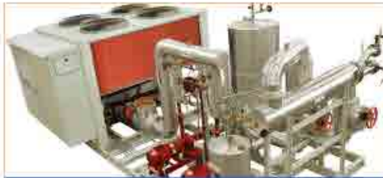
Air-conditioning Projects Works