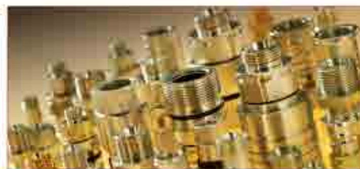
Hydraulic Hoses & fittings