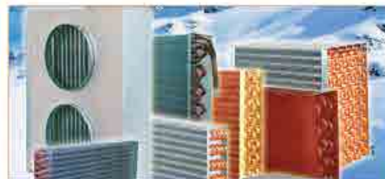
A/C Condenser Coils