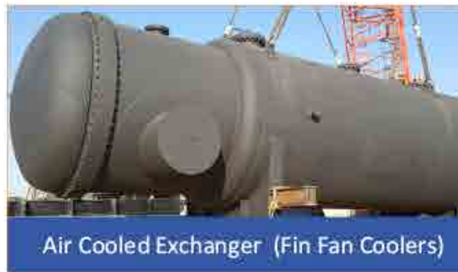
Air Cooled Exchanger (Fin Fan Coolers)

Dolphin has the capability to design / manufacture Pressure Vessels & Tanks as per ASME VIII Div.I in various materials listed above.