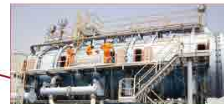
Maintenance / Shutdown

Ultra High Pressure Water-Jetting and Bundle pulling services