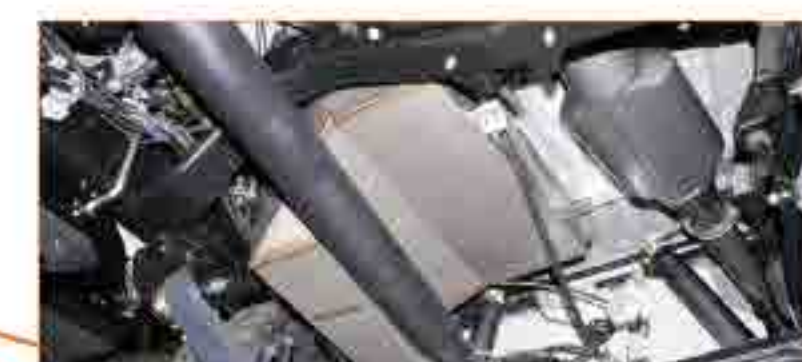
Exhaust / Fuel Tanks