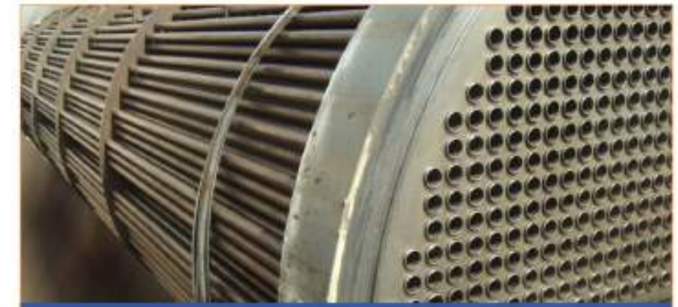
Shell & Tube Heat Exchanger

We undertake refurbishment / shutdown works like Dismantling / Box up, Bundle Pulling, Re tubing, Cleaning, Pressure testing. These services can be offered both at site as well as at our works.