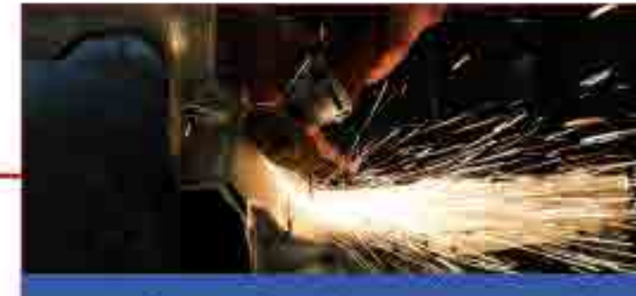
Mechanical Fabrication Works