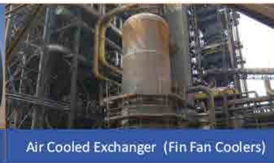
Air Cooled Exchanger (Fin Fan Coolers)