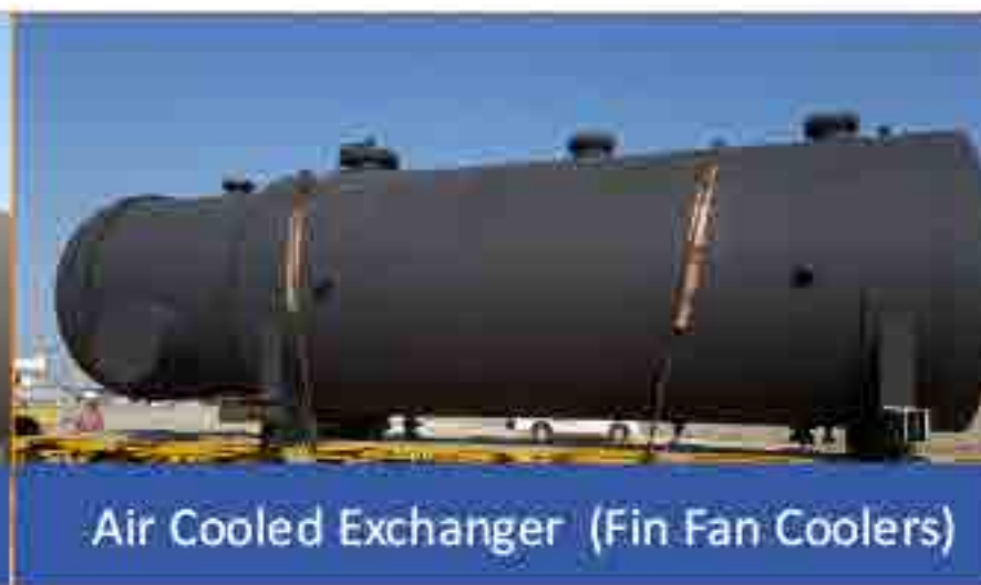
Air Cooled Exchanger (Fin Fan Coolers)