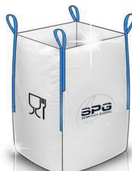
Food Grade Bag

Food grade big bags are intended to come in contact with food. These big bags are produced with special technology to comply with Regulation (EC) 1935/2004 with having BRC certificate.