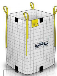
Conductive Bag/Type C

Conductive big bags are used to avoid electrostatic unloading during filling and discharging of the bag. This is necessary when either the product is flammable/explosive or the environment.