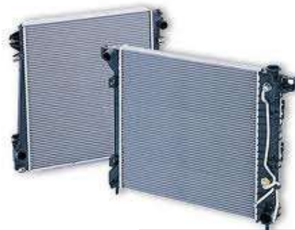
All Type Radiators