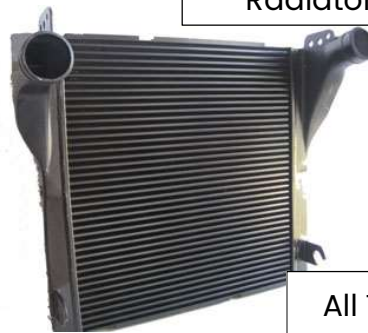
All Type Coolers