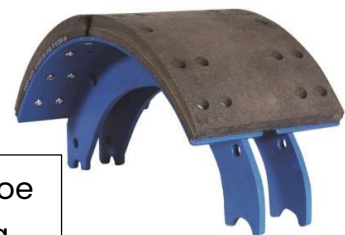
Brake Shoe Relining