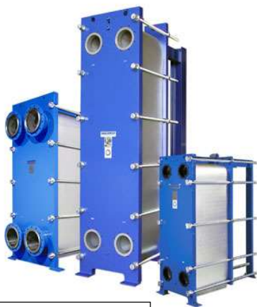
Plate Heat Exchanger