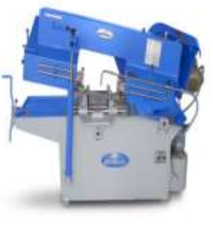
Band saw Machine

Total Engineering Turning having full set of in-house facilities including machines with latest technology. One of the most vital assets of Total Eng. is its efficient team of professionals who provide technical assistance to its potential customers.