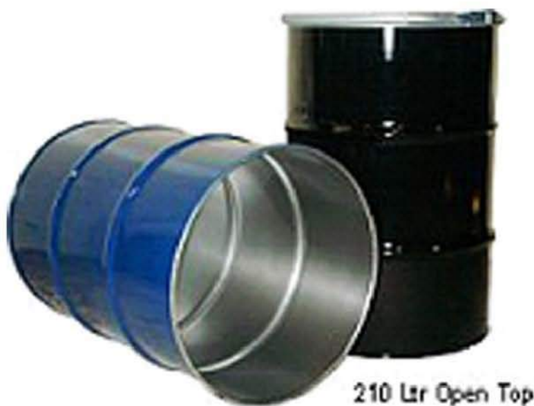
210 Ltr Open Top • Various Specs