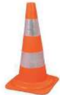
STYLE NO: QTC TRAFFIC CONE - 50CM X 0.80KG ORIGIN: CHINA