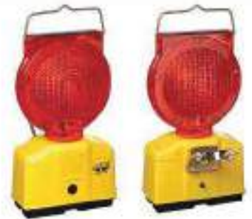
STYLE NO: 81317RED BRAND: SCI SOLAR FLASHING LIGHT WITH BRACKET ORIGIN: CHINA