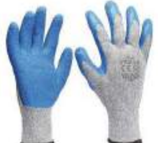
STYLE NO: ENH BRAND: VAULTEX LATEX COATED GLOVES SIZE: 10 ORIGIN: CHINA