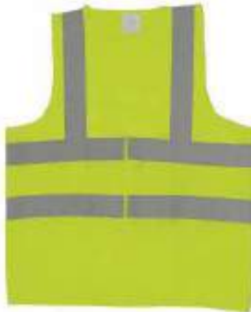
STYLE NO: RJD REFLECTIVE FABRIC VEST FREESIZE ORIGIN: CHINA