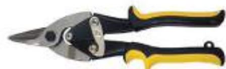
STYLE NO: DKC BRAND: ARMSTRONG STRAIGHT COMPOUND ACTION AVIATION SNIPS ORIGIN: CHINA