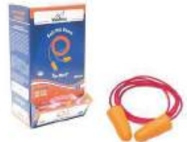
STYLE NO: VPC BRAND: VAULTX COILED EARPLUG ORIGIN: TAIWAN