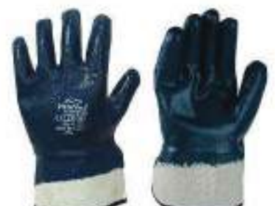
STYLE NO: JKL BRAND: VAULTEX NITRILE GLOVES WITH CUFF ORIGIN: CHINA