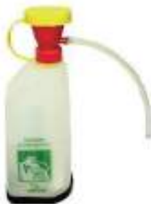
STYLE NO: EYE-B BRAND: VAULTEX EMPTY EYEWASH BOTTLE ORIGIN: INDIA