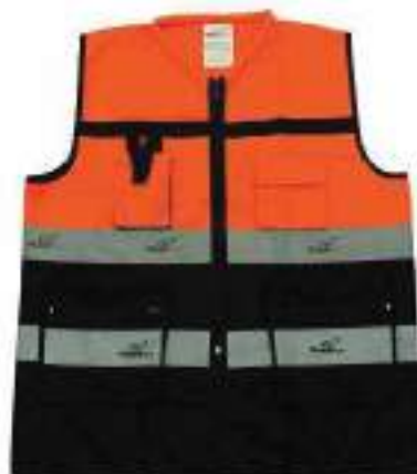
STYLE NO: DHT BRAND: VAULTX EXECUTIVE FABRIC VEST WITH VAULTX REFLECTIVE - 180 GSM SIZE: S-5XL ORIGIN: CHINA