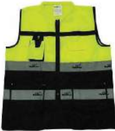
STYLE NO: DLM BRAND: VAULTX EXECUTIVE FABRIC VEST WITH VAULTX REFLECTIVE - 180 GSM SIZE: S-5XL ORIGIN: CHINA