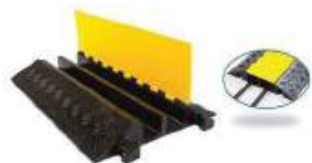
STYLE NO: ABC BRAND: SCI 2 CHANNEL HEAVY DUTY CABLE PROTECTOR L: 100CM X W: 25CM X H: 5CM X WT: 6.5KG ORIGIN: CHINA