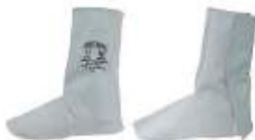
STYLE NO: SLG BRAND: ARMSTRONG LEATHER WELDING LEG GUARD ORIGIN: PAKISTAN