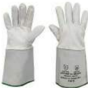
STYLE NO: TWG BRAND: VAULTEX TIG WELDING GLOVES ORIGIN: PAKISTAN