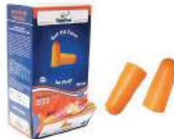
STYLE NO: VPU BRAND: VAULTX UNCOILED EARPLUG ORIGIN: TAIWAN