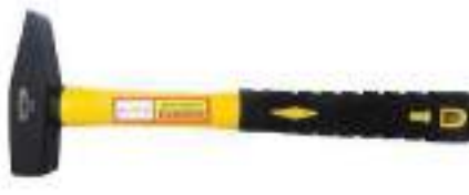
STYLE NO: AIM BRAND: ARMSTRONG MACHINIST HAMMER W/ TPR HANDLE (500 GMS) ORIGIN: CHINA