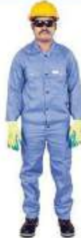
STYLE NO: CPV BRAND: VAULTX 100% TWILL PANT & SHIRT - 190 GSM SIZE: S-5XL ORIGIN: CHINA