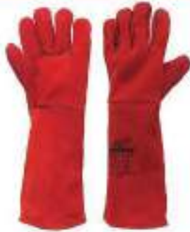
STYLE NO: TTD BRAND: VAULTEX WELDING GLOVES WITH PIPING 18 INCH ORIGIN: PAKISTAN