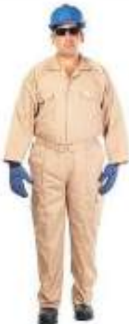
STYLE NO: 1BV BRAND: VAULTX 100% TWILL COVERALL - 190 GSM SIZE: S-5XL ORIGIN: CHINA