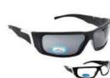
STYLE NO: V99 (ANTI-SCRATCH) BRAND: VAULTEX STANDARD: ANSI Z87.1, 2003/ EN 166 COLOR: CLEAR/DARK ORIGIN: TAIWAN