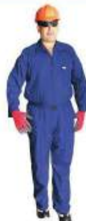
STYLE NO: NAT BRAND: AMERICAN TAG 35/65 POLY COTTON COVERALL - 135 GSM SIZE: S-5XL ORIGIN: CHINA