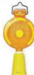
STYLE NO: IMR BRAND: SCI SOLAR FLASHING LIGHT WITH 6 LEDs ORIGIN: CHINA