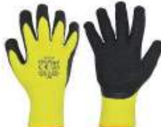
STYLE NO: LRE BRAND: VAULTEX LATEX COATED GLOVES SIZE: 10 ORIGIN: CHINA