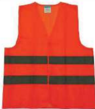
STYLE NO: PHL BRAND: WORKLAND REFLECTIVE FABRIC VEST - 63 GSM SIZE: S-5XL ORIGIN: CHINA