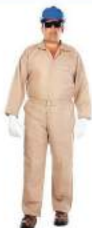
STYLE NO: BAT BRAND: AMERICAN TAG 35/65 POLY COTTON COVERALL - 135 GSM SIZE: S-5XL ORIGIN: CHINA