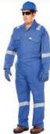
STYLE NO: VRB BRAND: VAULTEX 100% COTTON REFLECTIVE COVERALL - 260 GSM SIZE: S-5XL ORIGIN: CHINA