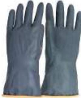
STYLE NO: VB101 BRAND: VAULTX LATEX GLOVES - 70 GRAMS ORIGIN: CHINA