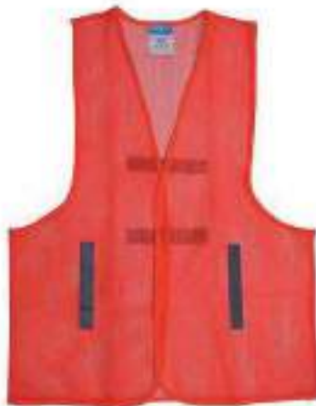
STYLE NO: FPB BRAND: WORKLAND REFLECTIVE FABRIC VEST - 35 GSM FREE SIZE ORIGIN: CHINA