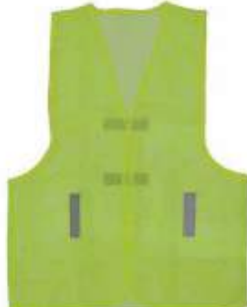
STYLE NO: UMD REFLECTIVE NET VEST FREE SIZE ORIGIN: CHINA