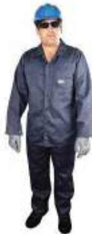
STYLE NO: ADG BRAND: WORKLAND 100% TWILL PANT & SHIRT - 190 GSM SIZE: S-5XL ORIGIN: CHINA