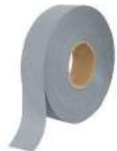
STYLE NO: HED 2 INCH REFLECTIVE TAPE 300 METERS ORIGIN: CHINA