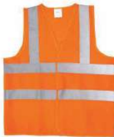
STYLE NO: RJD REFLECTIVE FABRIC VEST FREESIZE ORIGIN: CHINA