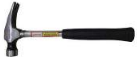
STYLE NO: KCM BRAND: ARMSTRONG CLAW HAMMER W/ TPR HANDLE (500 GRAMS) ORIGIN: CHINA