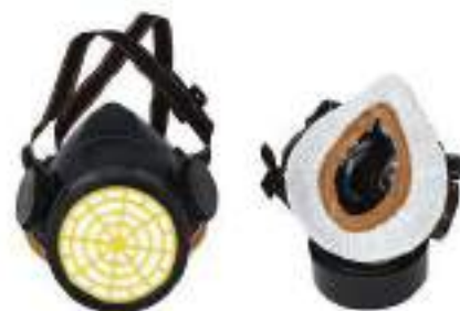
STYLE NO: JSK BRAND: ARMSTRONG INDUSTRIAL HALF FACE MASK SINGLE CARTRIDGE + TWIN EXHALATION VALVE ORIGIN: CHINA