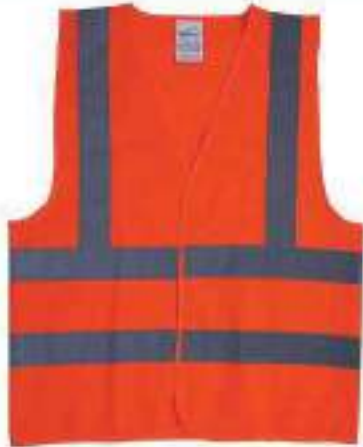
STYLE NO: HTM BRAND: VAULTEX REFLECTIVE FABRIC VEST - 116 GSM SIZE: S-5XL ORIGIN: CHINA