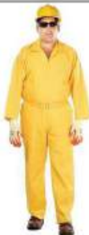
STYLE NO: YAT BRAND: AMERICAN TAG 35/65 POLY COTTON COVERALL - 135 GSM SIZE: S-5XL ORIGIN: CHINA