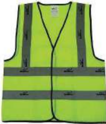
STYLE NO: IDN BRAND: VAULTX NET VEST WITH VAULTX REFLECTIVE - 134 GSM SIZE: S-5XL ORIGIN: CHINA