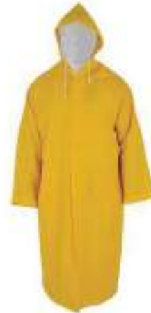
STYLE NO: KWA BRAND: WORKLAND PVC RAINCOAT SIZE: L-4XL ORIGIN: CHINA