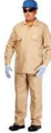
STYLE NO: 2RWL BRAND: WORKLAND 35/65 POLYCOTTON PANT & SHIRT - 135 GSM SIZE: S-5XL ORIGIN: CHINA