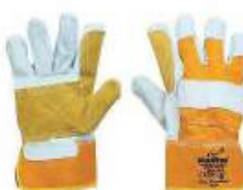
STYLE NO: DPY BRAND: VAULTX DOUBLE PALM LEATHER GLOVES ORIGIN: PAKISTAN