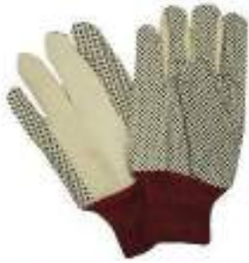
STYLE NO: VDD BRAND: VAULTEX DOTTED GLOVES APROX: 730 GMS / DZ ORIGIN: PAKISTAN