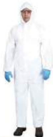
STYLE NO: PDC BRAND: VAULTEX NON-MEDICAL DISPOSABLE COVERALL 60 GSM SIZE: S-5XL ORIGIN: CHINA