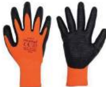
STYLE NO: CPU BRAND: VAULTX NITRILE COATED GLOVES SIZE: 10 ORIGIN: CHINA