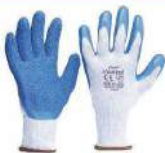
STYLE NO: MWC BRAND: VAULTEX LATEX COATED GLOVES SIZE: 10 ORIGIN: CHINA