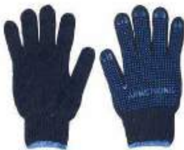
STYLE NO: DKR BRAND: ARMSTRONG SINGLE SIDE DOTTED GLOVES ORIGIN: CHINA