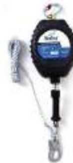
STYLE NO: KBU BRAND: VAULTEX RETRACTABLE FALL ARRESTER LENGTH: 12 METERS ORIGIN: INDIA