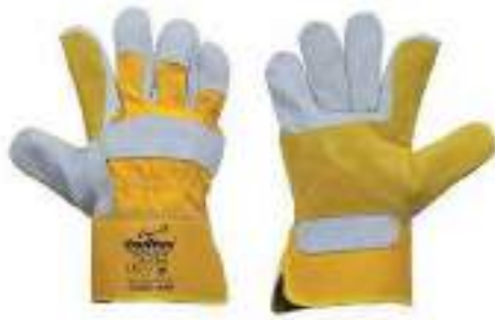
STYLE NO: ARB BRAND: VAULTEX DOUBLE PALM LEATHER GLOVES ORIGIN: PAKISTAN