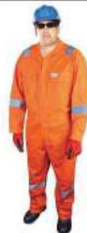
STYLE NO: VDR BRAND: VAULTX 100% COTTON REFLECTIVE COVERALL - 260 GSM SIZE: S-5XL ORIGIN: CHINA