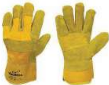
STYLE NO: KAD BRAND: VAULTX PATCHED PALM LEATHER GLOVES ORIGIN: PAKISTAN