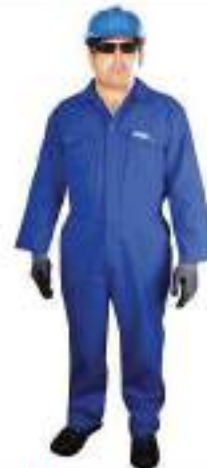
STYLE NO: W100 BRAND: WORKLAND 100% COTTON COVERALL - 190 GSM SIZE: S-5XL ORIGIN: CHINA