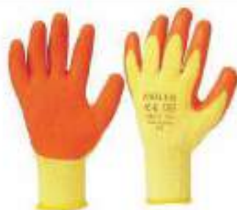
STYLE NO: HLL BRAND: MILLER LATEX COATED GLOVES SIZE: 10 ORIGIN: CHINA