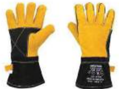
STYLE NO: NHA14 BRAND: ARMSTRONG WELDING GLOVES WITH KEVLAR THREAD STITCHING - PATCHED PALM ORIGIN: PAKISTAN