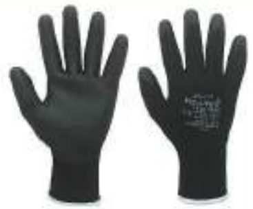
STYLE NO: NJD BRAND: VAULTEX PU COATED GLOVES SIZE: 8, 9, 10 ORIGIN: CHINA