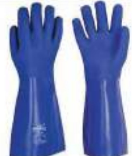
STYLE NO: MRE BRAND: VAULTEX PVC CHEMICAL GLOVES - 16 INCH ORIGIN: CHINA