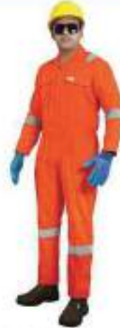
STYLE NO: RGF BRAND: VAULTEX 100% COTTON REFLECTIVE COVERALL - 240 GSM SIZE: S-5XL ORIGIN: INDIA