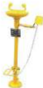
STYLE NO: 4710 GI BRAND: VAULTEX EMERGENCY EYEWASH STATION STANDARD: IS : 10592:1982 ORIGIN: INDIA