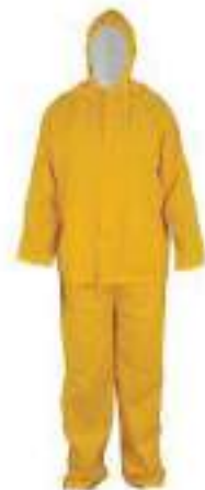
STYLE NO: LRK BRAND: WORKLAND PVC RAINSUIT SIZE: L-4XL ORIGIN: CHINA