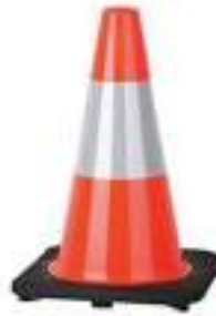
STYLE NO: NKD BRAND: SCI TRAFFIC CONE - 45CM X 1.2KG ORIGIN: CHINA