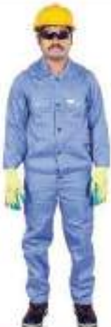
STYLE NO: BHO BRAND: VAULTX 100% TWILL PANT & SHIRT - 190 GSM SIZE: S-5XL ORIGIN: CHINA