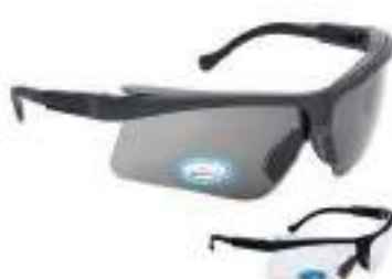
STYLE NO: V61 (ANTI-SCRATCH) BRAND: VAULTEX STANDARD: ANSI Z87.1, 2003/ EN 166 COLOR: CLEAR/DARK ORIGIN: TAIWAN