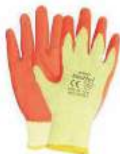
STYLE NO: OGL BRAND: VAULTEX LATEX COATED GLOVES SIZE: 10 ORIGIN: CHINA