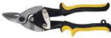
STYLE NO: DJS BRAND: ARMSTRONG RIGHT CURVE COMPOUND ACTION AVIATION SNIPS ORIGIN: CHINA