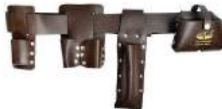
STYLE NO: MDV25 BRAND: SCI SCAFFOLD LEATHER BELT WITH POCKETS ORIGIN: INDIA