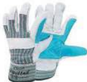
STYLE NO: DPB BRAND: VAULTX DOUBLE PALM LEATHER GLOVES ORIGIN: PAKISTAN