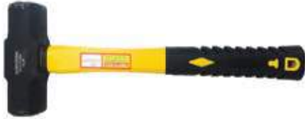
STYLE NO: HSR BRAND: ARMSTRONG SLEDGE HAMMER W/ TPR HANDLE (4 Lb) ORIGIN: CHINA