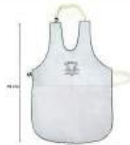
STYLE NO: LWA BRAND: ARMSTRONG LEATHER WELDING APRON SIZE: 90CM X 60CM ORIGIN: PAKISTAN