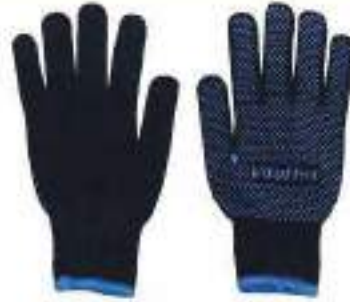
STYLE NO: JTR BRAND: VAULTEX SINGLE SIDE DOTTED GLOVES ORIGIN: CHINA