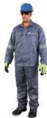
STYLE NO: SKO BRAND: VAULTEX 100% TWILL REFLECTIVE PANT & SHIRT 190 GSM SIZE: S-5XL ORIGIN: CHINA