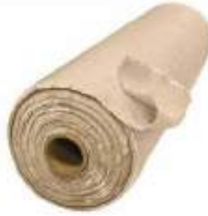
STYLE NO: EID FIRE BLANKET ROLL SIZE: 0.8MM X 1M X 50M ORIGIN: CHINA