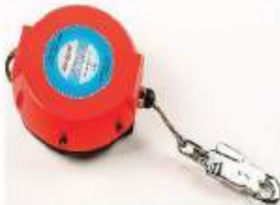
STYLE NO: FA7.5, FA25 BRAND: EDGE RETRACTABLE FALL ARRESTER LENGTH: 7.5M, 25M ORIGIN: INDIA