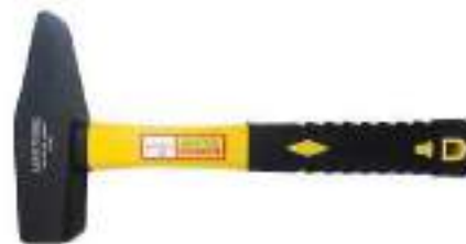
STYLE NO: BOF BRAND: ARMSTRONG MACHINIST HAMMER W/ TPR HANDLE (2000 GMS) ORIGIN: CHINA