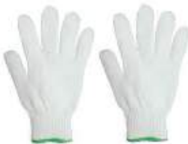
STYLE NO: GOW KNITTED GLOVES APROX: 400 GMS / DZ ORIGIN: CHINA