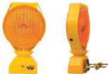
STYLE NO: NBL BRAND: SCI SOLAR FLASHING LIGHT WITH BRACKET ORIGIN: CHINA