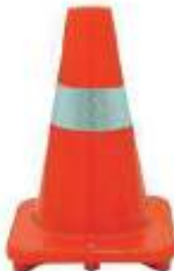
STYLE NO: LGT TRAFFIC CONE - 30CM X 0.5KG ORIGIN: CHINA