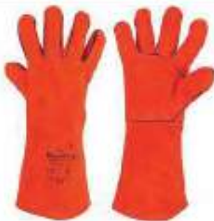
STYLE NO: WBR BRAND: VAULTEX WELDING GLOVES WITH PIPING 16 INCH ORIGIN: PAKISTAN