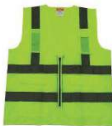
STYLE NO: QOL BRAND: MILLER EXECUTIVE FABRIC VEST - 115 GSM SIZE: S-5XL ORIGIN: CHINA