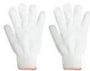
STYLE NO: OGT KNITTED GLOVES APROX: 500 GMS / DZ ORIGIN: CHINA