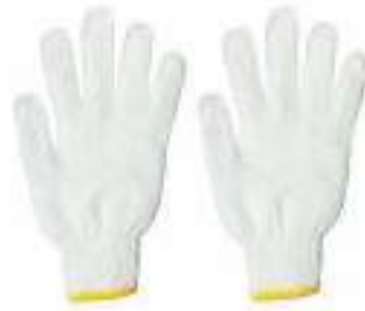
STYLE NO: YCG KNITTED GLOVES APPROX: 600 GMS / DZ ORIGIN: CHINA