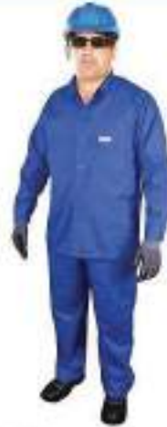
STYLE NO: C2P BRAND: WORKLAND 100% COTTON PANT & SHIRT - 190 GSM SIZE: S-5XL ORIGIN: CHINA