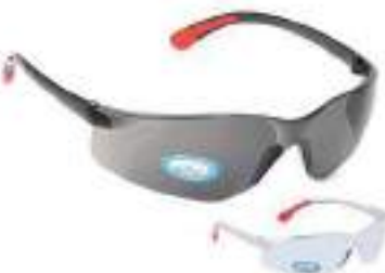
STYLE NO: V91 (ANTI-SCRATCH) BRAND: VAULTEX STANDARD: ANSI Z87.1, 2003/ EN 166 COLOR: CLEAR/DARK ORIGIN: TAIWAN