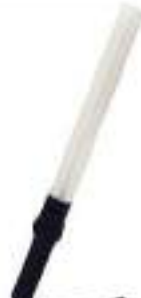
STYLE NO: RDJ TRAFFIC BATON LIGHT RED FLASHING/GREEN STEADY LIGHT ORIGIN: CHINA