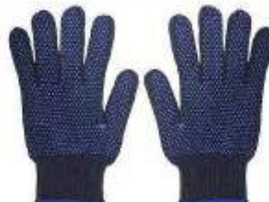
STYLE NO: DQH DOUBLE SIDE DOTTED GLOVES ORIGIN: PAKISTAN