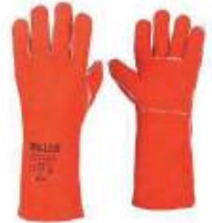
STYLE NO: BIK BRAND: MILLER WELDING GLOVES WITH PIPING 15.5 INCH ORIGIN: PAKISTAN