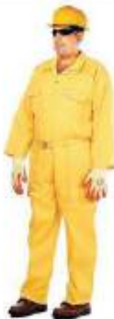
STYLE NO: 1YV BRAND: VAULTX 100% TWILL COVERALL - 190 GSM SIZE: S-5XL ORIGIN: CHINA