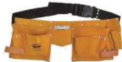
STYLE NO: PEW BRAND: SCI SPLIT LEATHER TOOL BAG (ECO) ORIGIN: INDIA