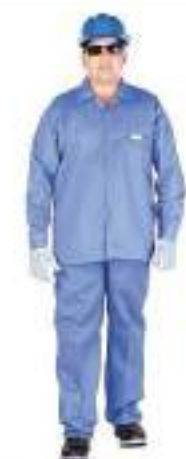
STYLE NO: WPV BRAND: WORKLAND 100% TWILL PANT & SHIRT - 190 GSM SIZE: S-5XL ORIGIN: CHINA