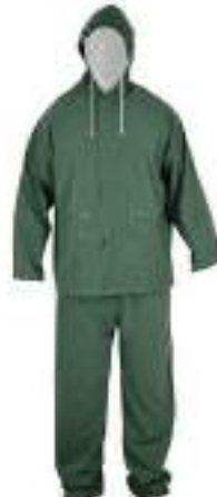
STYLE NO: EJM BRAND: WORKLAND PVC RAINSUIT SIZE: L-4XL ORIGIN: CHINA