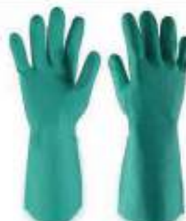
STYLE NO: LAN BRAND: SCL NITRILE GLOVES - 33 CM SIZE: 9, 10, 11 ORIGIN: SRI LANKA