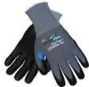
STYLE NO: KTP BRAND: VAULTX NITRILE FLAT COATED WITH CROTCH THUMB SIZE: L & XL ORIGIN: SRI LANKA