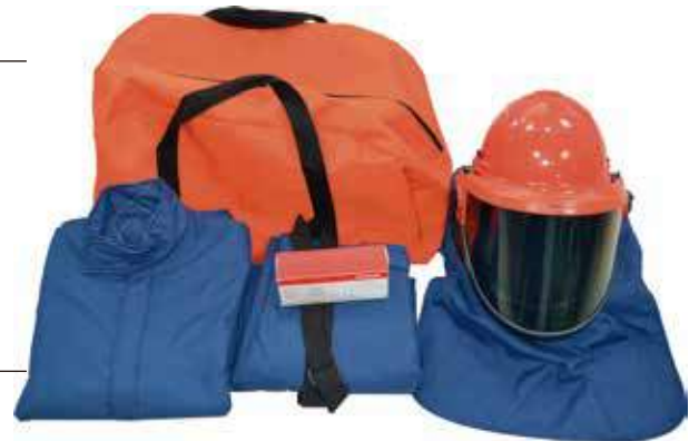
Arc Flash 40 Cal Kit with Front Hood