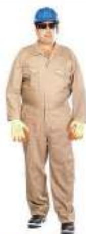
STYLE NO: 8100 BRAND: WORKLAND 100% COTTON COVERALL - 190 GSM SIZE: S-5XL ORIGIN: CHINA