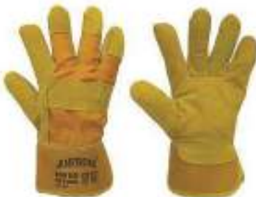
STYLE NO: QAD BRAND: ARMSTRONG SINGLE PALM LEATHER GLOVES ORIGIN: PAKISTAN