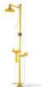
STYLE NO: 6250 GI BRAND: VAULTEX EMERGENCY EYEWASH SHOWER STANDARD: IS : 10592:1982 ORIGIN: INDIA