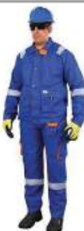
STYLE NO: VFU BRAND: VAULTEX 100% COTTON REFLECTIVE PANT & SHIRT 260 GSM (EUROPEAN STYLE) SIZE: S-5XL ORIGIN: CHINA