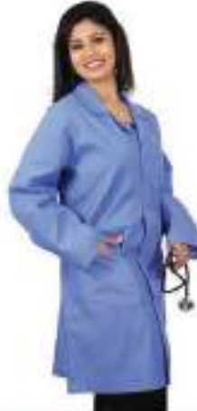
STYLE NO: FMT BRAND: AMERICAN TAG 35/65 LABCOAT SIZE: S-5XL ORIGIN: CHINA