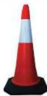
STYLE NO: FEB TRAFFIC CONE - 1M X 5KG ORIGIN: CHINA