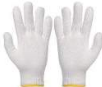
STYLE NO: BCK60 KNITTED GLOVES APROX: 450 GMS / DZ ORIGIN: CHINA