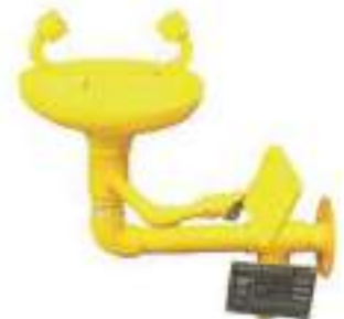
STYLE NO: 4810 GI BRAND: VAULTEX WALL MOUNTED EYEWASH STATION STANDARD: IS : 10592:1982 ORIGIN: INDIA