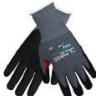
STYLE NO: CAB BRAND: VAULTX NITRILE FOAM COATED WITH CROTCH THUMB SIZE: L & XL ORIGIN: SRI LANKA