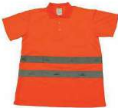
STYLE NO: OJM BRAND: VAULTX POLO T-SHIRT WITH VAULTX REFLECTIVE - 245 GSM SIZE: S-4XL ORIGIN: CHINA