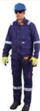
STYLE NO: FPT BRAND: VAULTEX 100% COTTON REFLECTIVE PANT & SHIRT 260 GSM (EUROPEAN STYLE) SIZE: S-5XL ORIGIN: CHINA