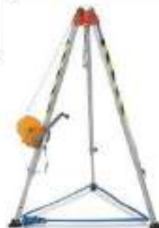
STYLE NO: GSM TRIPOD WITH 10 METERS WINCH ORIGIN: INDIA