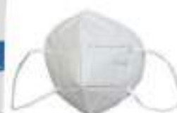
STYLE NO: GMD KN95 FLAT FOLD RESPIRATOR MASK STANDARD: GB2626-2006 KN95 / EN 355 ORIGIN: CHINA