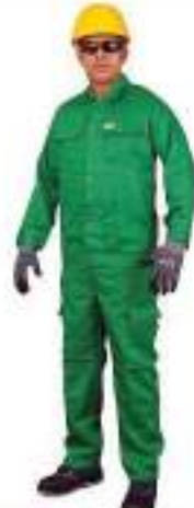
STYLE NO: CBV BRAND: VAULTX 100% TWILL PANT & SHIRT - 190 GSM SIZE: S-5XL ORIGIN: CHINA