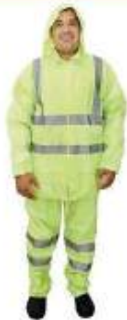
STYLE NO: PDT BRAND: VAULTEX HI-VISIBILITY PVC/POLYESTER RAIN SUIT SIZE: L-4XL ORIGIN: CHINA