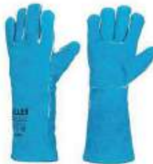
STYLE NO: ECO BRAND: MILLER WELDING GLOVES WITH PIPING 16 INCH ORIGIN: PAKISTAN