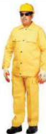
STYLE NO: CYV BRAND: VAULTX 100% TWILL PANT & SHIRT - 190 GSM SIZE: S-5XL ORIGIN: CHINA