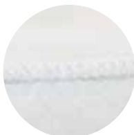
Dual slider zip