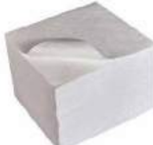
STYLE NO: WWK OIL SORBENT PADS - EP100 ORIGIN: USA