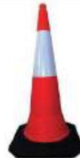
STYLE NO: TC BRAND: SCI TRAFFIC CONE - 1M X 5KG ORIGIN: CHINA