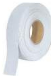
STYLE NO: COD 2 INCH HI-VISIBILITY REFLECTIVE TAPE 200 METERS ORIGIN: CHINA