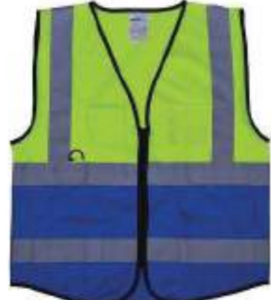
STYLE NO: BDH BRAND: VAULTX EXECUTIVE FABRIC VEST SIZE: S-5XL ORIGIN: CHINA