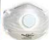
STYLE NO: VMK BRAND: VAULTX KN95 PARTICULATE RESPIRATOR ORIGIN: CHINA