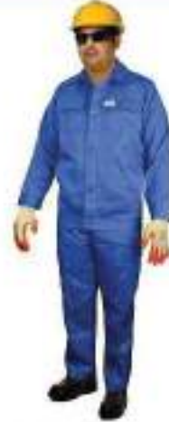
STYLE NO: JCN BRAND: VAULTX 100% TWILL PANT & SHIRT - 190 GSM SIZE: S-5XL ORIGIN: CHINA