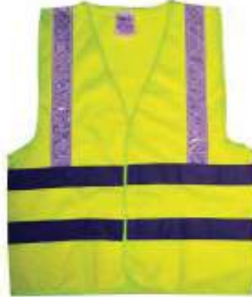
STYLE NO: CNM BRAND: VAULTX FABRIC VEST WITH 2 HI-VIZ PVC REFLECTIVE - 130 GSM SIZE: S-5XL ORIGIN: CHINA