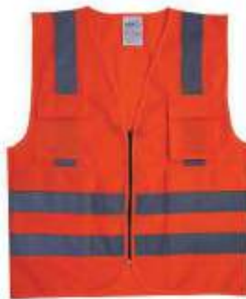
STYLE NO: SHT BRAND: VAULTEX EXECUTIVE FABRIC VEST - 120 GSM SIZE: S-5XL ORIGIN: CHINA