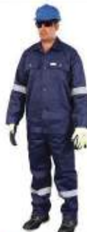
STYLE NO: LDO BRAND: VAULTEX 100% TWILL REFLECTIVE PANT & SHIRT 190 GSM S-5XL ORIGIN: CHINA