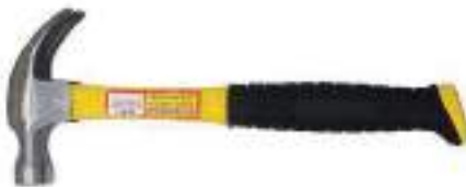
STYLE NO: DIG BRAND: ARMSTRONG CLAW HAMMER W/ TPR HANDLE (16 oz) ORIGIN: CHINA