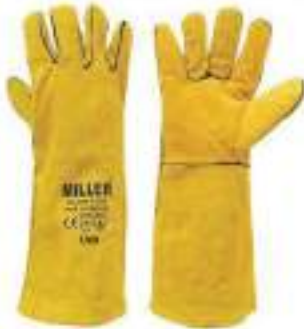
STYLE NO: LMQ BRAND: MILLER WELDING GLOVES WITH PIPING 16 INCH ORIGIN: PAKISTAN