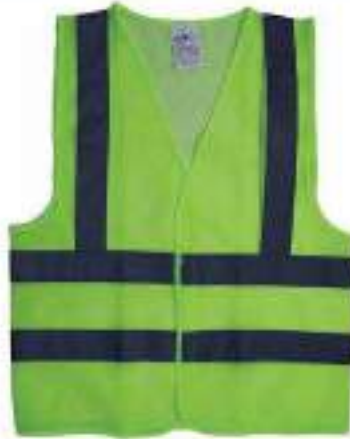
STYLE NO: APD BRAND: VAULTX REFLECTIVE NET VEST - 60 GSM SIZE: S-5XL ORIGIN: CHINA