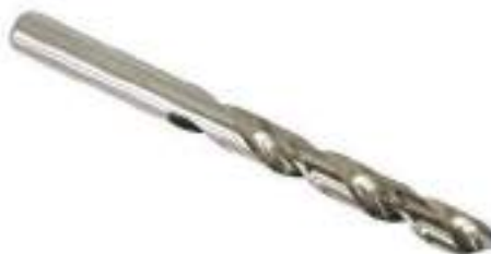
HBB 4341 DRILL BITS ORIGIN: CHINA