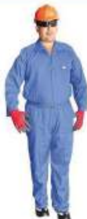
STYLE NO: PAT BRAND: AMERICAN TAG 35/65 POLY COTTON COVERALL - 135 GSM SIZE: S-5XL ORIGIN: CHINA