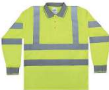
STYLE NO: EHM BRAND: VAULTEX REFLECTIVE FULL SLEEVE POLO T-SHIRT SIZE: S-4XL ORIGIN: CHINA