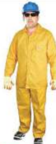
STYLE NO: HQT BRAND: WORKLAND 100% TWILL PANT & SHIRT - 190 GSM SIZE: S-5XL ORIGIN: CHINA