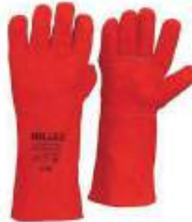
STYLE NO: LYK BRAND: MILLER WELDING GLOVES 15.5 INCH ORIGIN: PAKISTAN