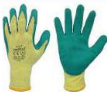
STYLE NO: YGL BRAND: VAULTEX LATEX COATED GLOVES SIZE: 10 ORIGIN: CHINA