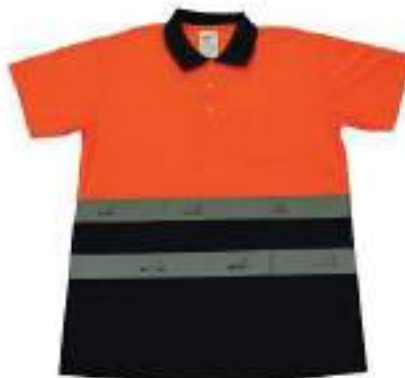
STYLE NO: FPQ BRAND: VAULTEX POLO T-SHIRT WITH VAULTEX REFLECTIVE - 245 GSM SIZE: S-4XL ORIGIN: CHINA