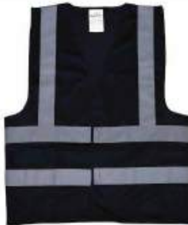
STYLE NO: CKD BRAND: VAULTX REFLECTIVE FABRIC VEST - 116 GSM SIZE: S-5XL ORIGIN: CHINA