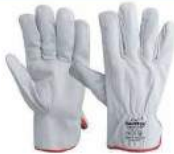
STYLE NO: GKR BRAND: VAULTEX SHORT DRIVING GLOVES ORIGIN: PAKISTAN