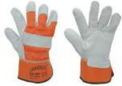
STYLE NO: WT10 BRAND: ARMSTRONG SINGLE PALM LEATHER GLOVES ORIGIN: PAKISTAN