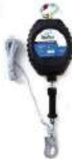
STYLE NO: ORV BRAND: VAULTEX RETRACTABLE FALL ARRESTER LENGTH: 10 METERS ORIGIN: INDIA