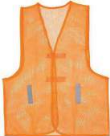
STYLE NO: UMD REFLECTIVE NET VEST FREE SIZE ORIGIN: CHINA