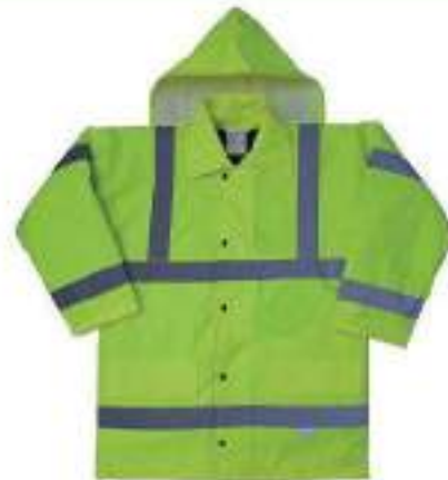
STYLE NO: JGY BRAND: VAULTEX WINTER JACKET WITH REFLECTIVE SIZE: S-5XL ORIGIN: CHINA