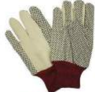
STYLE NO: VDB BRAND: VAULTEX DOTTED GLOVES APROX: 950 GMS / DZ ORIGIN: PAKISTAN