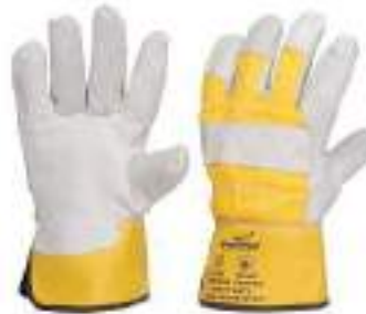
STYLE NO: FPK BRAND: VAULTX SINGLE PALM LEATHER GLOVES ORIGIN: PAKISTAN