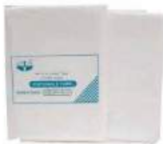
STYLE NO: JJW BRAND: BCI DISPOSABLE TOWEL ORIGIN: CHINA