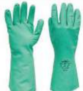
STYLE NO: LLR BRAND: VAULTEX NITRILE GLOVES - 33 CM SIZE: 8, 9, 10, 11 ORIGIN: SRI LANKA