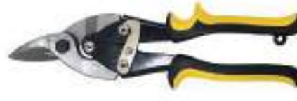
STYLE NO: SBM BRAND: ARMSTRONG LEFT CURVE COMPOUND ACTION AVIATION SNIPS ORIGIN: CHINA