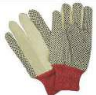
STYLE NO: VDE BRAND: VAULTEX DOTTED GLOVES APPROX: 700 GMS / DZ ORIGIN: PAKISTAN