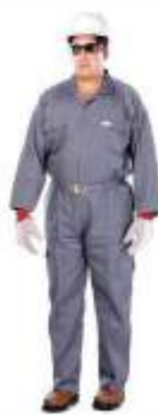
STYLE NO: 1BRV BRAND: VAULTX 100% TWILL COVERALL - 190 GSM SIZE: S-5XL ORIGIN: CHINA