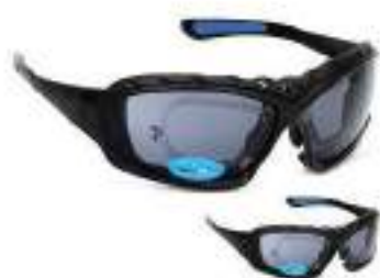
STYLE NO: V59 (ANTI-SCRATCH) BRAND: VAULTEX STANDARD: ANSI Z87.1, 2003/ EN 166 COLOR: CLEAR/DARK ORIGIN: TAIWAN