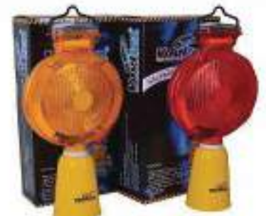
STYLE NO: V8L BRAND: VAULTEX SOLAR FLASHING LIGHT WITH 6 LEDs ORIGIN: CHINA