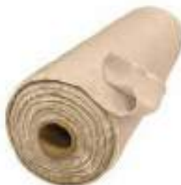
STYLE NO: LTU FIRE BLANKET ROLL SIZE: 0.8MM X 1M X 100M ORIGIN: CHINA