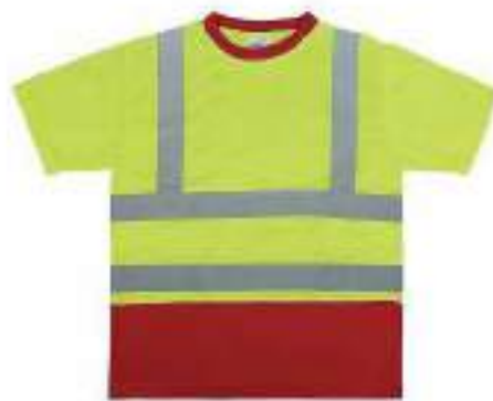
STYLE NO: MDR BRAND: VAULTX REFLECTIVE ROUND NECK T-SHIRT SIZE: S-5XL ORIGIN: CHINA