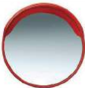
STYLE NO: S-1581-60 BRAND: SCI CONVEX MIRROR - DIAMETER 160 CM ORIGIN: CHINA