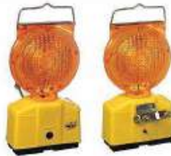
STYLE NO: 81317 BRAND: SCI SOLAR FLASHING LIGHT WITH BRACKET ORIGIN: CHINA