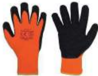
STYLE NO: MFR BRAND: VAULTEX LATEX COATED GLOVES SIZE: 10 ORIGIN: CHINA