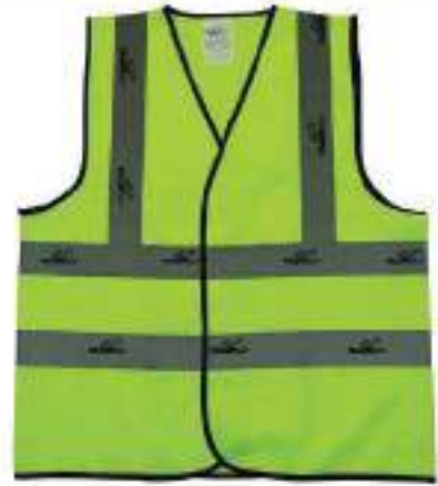
STYLE NO: RKB BRAND: VAULTX FABRIC VEST WITH VAULTX REFLECTIVE - 151 GSM SIZE: S-5XL ORIGIN: CHINA