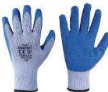
STYLE NO: CJR BRAND: VAULTEX LATEX COATED GLOVES SIZE: 10 ORIGIN: CHINA