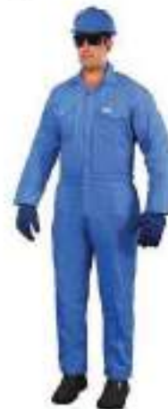
STYLE NO: NDJ BRAND: VAULTEX 100% COTTON COVERALL 200 GSM SIZE: S-5XL ORIGIN: INDIA