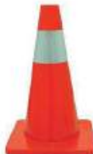
STYLE NO: EIP TRAFFIC CONE - 45CM X 1.1KG ORIGIN: CHINA