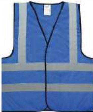
STYLE NO: HJD BRAND: VAULTX REFLECTIVE FABRIC VEST - 116 GSM SIZE: S-5XL ORIGIN: CHINA