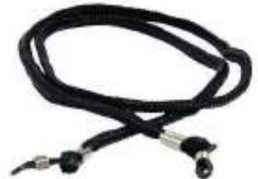
STYLE NO: CORD2 BRAND: VAULTEX RETAINER CORD FOR SPECTACLES COLOR: BLACK ORIGIN: TAIWAN