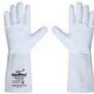
STYLE NO: HJO BRAND: VAULTEX TIG WELDING GLOVES ORIGIN: PAKISTAN