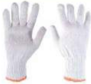
STYLE NO: MTI KNITTED GLOVES APPROX: 500 GMS / DZ ORIGIN: CHINA