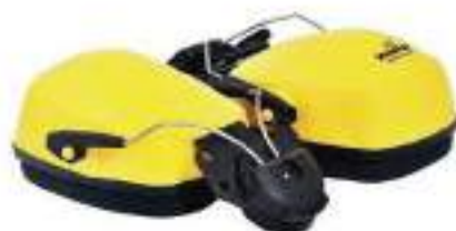
STYLE NO: HME BRAND: VAULTX UNIVERSAL HELMET MOUNTED EAR MUFF ORIGIN: TAIWAN