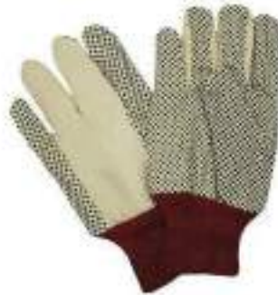
STYLE NO: DB62 DOTTED GLOVES APROX: 900 GMS / DZ ORIGIN: PAKISTAN