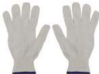
STYLE NO: ASH COTTON KNITTED GLOVES APROX: 370 GMS / MONO ORIGIN: CHINA