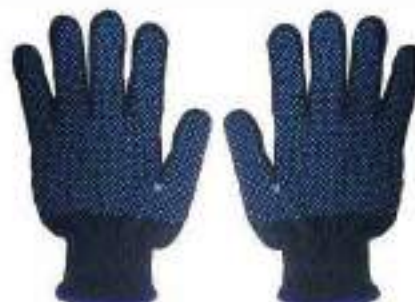
STYLE NO: PKI BRAND: WORKLAND DOUBLE SIDE DOTTED GLOVES ORIGIN: PAKISTAN