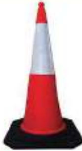
STYLE NO: TC5 BRAND: SCI TRAFFIC CONE - 1M X 5.5KG ORIGIN: CHINA