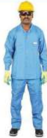
STYLE NO: 2PWL BRAND: WORKLAND 35/65 POLYCOTTON PANT & SHIRT - 135 GSM SIZE: S-5XL ORIGIN: CHINA