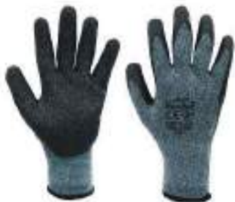
STYLE NO: QGP BRAND: VAULTEX LATEX COATED GLOVES SIZE: 10 ORIGIN: CHINA