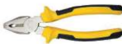
STYLE NO: NDC BRAND: ARMSTRONG COMBINATION PLIER (8") ORIGIN: CHINA