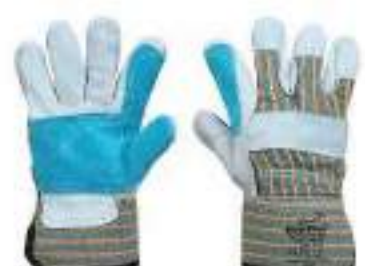
STYLE NO: BAK BRAND: VAULTX DOUBLE PALM LEATHER GLOVES ORIGIN: PAKISTAN