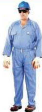
STYLE NO: 1PV BRAND: VAULTX 100% TWILL COVERALL - 190 GSM SIZE: S-5XL ORIGIN: CHINA