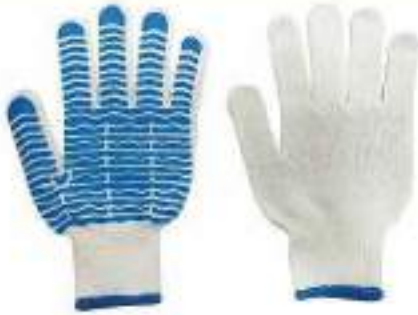
STYLE NO: IFB SINGLE SIDE DOTTED GLOVES ORIGIN: CHINA