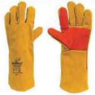
STYLE NO: DDL BRAND: VAULTEX DOUBLE PALM WELDING GLOVES WITH PIPING 16 INCH ORIGIN: PAKISTAN