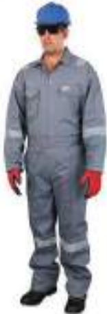
STYLE NO: TOP BRAND: VAULTEX 100% COTTON REFLECTIVE COVERALL - 260 GSM SIZE: S-5XL ORIGIN: CHINA