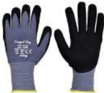
STYLE NO: ORD BRAND: VAULTX NITRILE FOAM COATED GLOVES SIZE: L & XL ORIGIN: SRI LANKA