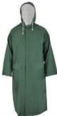
STYLE NO: OUC BRAND: WORKLAND PVC RAINCOAT SIZE: L-4XL ORIGIN: CHINA