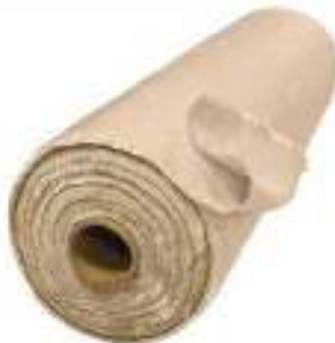
STYLE NO: GBB FIRE BLANKET ROLL SIZE: 1MM X 1.8M X 25M ORIGIN: CHINA