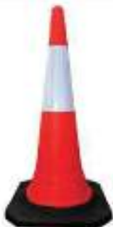
STYLE NO: TC4 TRAFFIC CONE - 1M X 4.5KG ORIGIN: CHINA