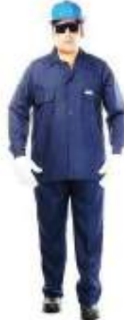
STYLE NO: 2NWL BRAND: WORKLAND 35/65 POLYCOTTON PANT & SHIRT - 135 GSM SIZE: S-5XL ORIGIN: CHINA