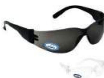
STYLE NO: V70 (ANTI-SCRATCH) BRAND: VAULTEX STANDARD: ANSI Z87.1, 2003/ EN 166 COLOR: CLEAR/DARK ORIGIN: TAIWAN