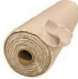
STYLE NO: BTU FIRE BLANKET ROLL SIZE: 1.6MM X 1M X 100M ORIGIN: CHINA