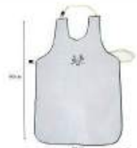
STYLE NO: HAT LEATHER WELDING APRON SIZE: 90CM X 60CM ORIGIN: PAKISTAN