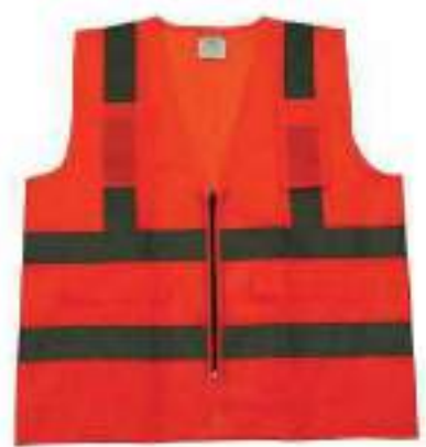
STYLE NO: HTL BRAND: MILLER EXECUTIVE FABRIC VEST - 115 GSM SIZE: S-5XL ORIGIN: CHINA