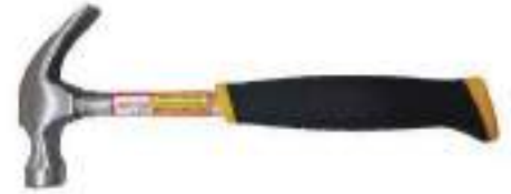
STYLE NO: DAL BRAND: ARMSTRONG CLAW HAMMER W/ STEEL TUBULAR HANDLE (16 oz) ORIGIN: CHINA