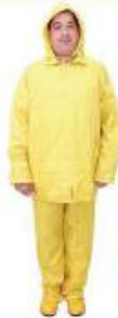
STYLE NO: HQC BRAND: VAULTEX PVC/POLYESTER RAIN SUIT SIZE: L-4XL ORIGIN: CHINA