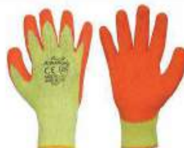
STYLE NO: KGP BRAND: ARMSTRONG ECONOMY LATEX COATED GLOVES SIZE: 10 ORIGIN: CHINA