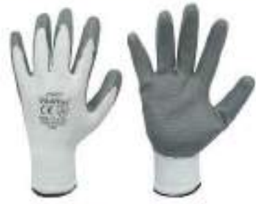
STYLE NO: TSD BRAND: VAULTX NITRILE COATED GLOVES SIZE: 10 ORIGIN: CHINA