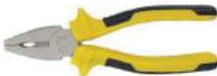
STYLE NO: IJP BRAND: ARMSTRONG COMBINATION PLIER (6") ORIGIN: CHINA