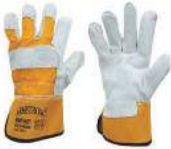
STYLE NO: GPBRP BRAND: ARMSTRONG SINGLE PALM LEATHER GLOVES ORIGIN: PAKISTAN