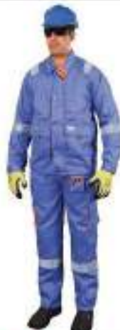
STYLE NO: TDB BRAND: VAULTEX 100% TWILL REFLECTIVE PANT & SHIRT 190 GSM (EUROPEAN STYLE) SIZE: S-5XL ORIGIN: CHINA