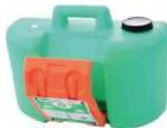
STYLE NO: EWT BRAND: VAULTEX GRAVITY FED EYE WASH TANK ORIGIN: INDIA