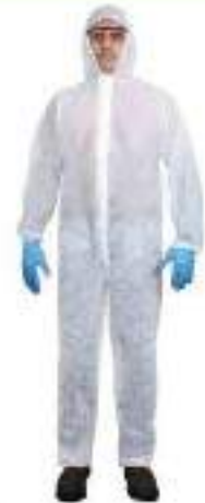
STYLE NO: ITE BRAND: VAULTEX NON-MEDICAL DISPOSABLE COVERALL 25 GSM SIZE: S-5XL ORIGIN: CHINA