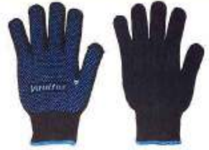
STYLE NO: CRD BRAND: VAULTEX SINGLE SIDE DOTTED GLOVES ORIGIN: CHINA