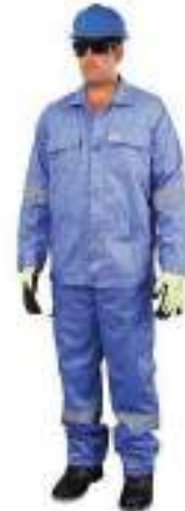
STYLE NO: DBA BRAND: VAULTEX 100% TWILL REFLECTIVE PANT & SHIRT 190 GSM SIZE: S-5XL ORIGIN: CHINA