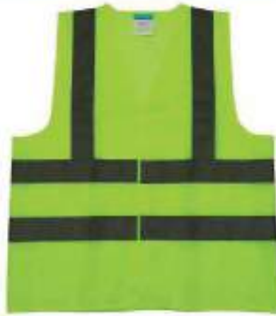
STYLE NO: TJP BRAND: WORKLAND REFLECTIVE FABRIC VEST - 68 GSM SIZE: S-5XL ORIGIN: CHINA