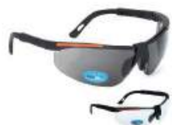
STYLE NO: V89 (ANTI-SCRATCH) BRAND: VAULTEX STANDARD: ANSI Z87.1, 2003/ EN 166 COLOR: CLEAR/DARK ORIGIN: TAIWAN