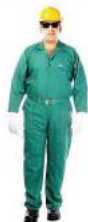
STYLE NO: GAT BRAND: AMERICAN TAG 35/65 POLY COTTON COVERALL - 135 GSM SIZE: S-5XL ORIGIN: CHINA