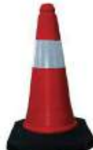
STYLE NO: TC2 BRAND: SCI TRAFFIC CONE - 50CM X 1.5KG ORIGIN: CHINA