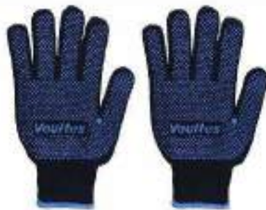
STYLE NO: VB91 BRAND: VAULTEX DOUBLE SIDE DOTTED GLOVES ORIGIN: CHINA