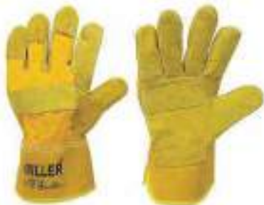
STYLE NO: SAR BRAND: MILLER PATCHED PALM LEATHER GLOVES ORIGIN: PAKISTAN