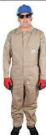
STYLE NO: FBM BRAND: VAULTX 100% COTTON FIRE RETARDANT COVERALL - 320 GSM SIZE: S-5XL ORIGIN: CHINA