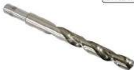
REDUCED SHANK ORIGIN: CHINA