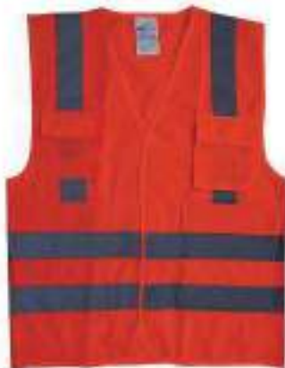
STYLE NO: NLM BRAND: VAULTEX EXECUTIVE FABRIC VEST - 110 GSM SIZE: S-5XL ORIGIN: CHINA