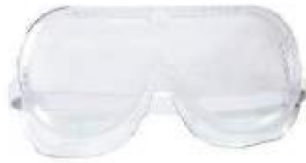
STYLE NO: BTK COLOR: CLEAR ORIGIN: CHINA