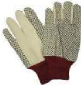
STYLE NO: VDC BRAND: VAULTEX DOTTED GLOVES APROX: 840 GMS / DZ ORIGIN: PAKISTAN