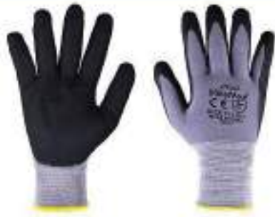
STYLE NO: HCN BRAND: VAULTEX NITRILE FOAM COATED GLOVES SIZE: 10 ORIGIN: CHINA