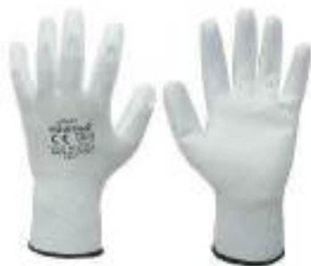
STYLE NO: CKP BRAND: VAULTEX PU COATED GLOVES SIZE: 10 ORIGIN: CHINA