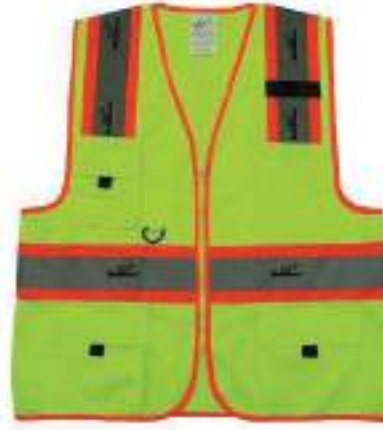
STYLE NO: JMA BRAND: VAULTEX EXECUTIVE FABRIC VEST - 186 GSM SIZE: S-5XL ORIGIN: CHINA