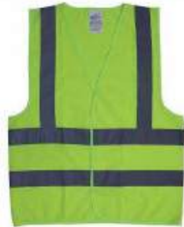
STYLE NO: ORB BRAND: VAULTX REFLECTIVE FABRIC VEST - 116 GSM SIZE: S-5XL ORIGIN: CHINA