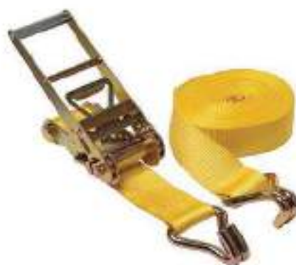
STYLE NO: SLR BRAND: SGI CARGO LASHING RATCHET 3 INCH X 8 TON X 10 MTR ORIGIN: CHINA