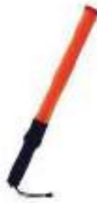
STYLE NO: 180 TRAFFIC BATON LIGHT RED FLASHING/RED STEADY LIGHT ORIGIN: CHINA