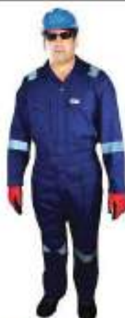
STYLE NO: VDN BRAND: VAULTX 100% COTTON REFLECTIVE COVERALL - 260 GSM SIZE: S-5XL ORIGIN: CHINA