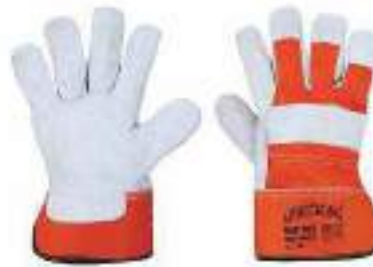
STYLE NO: BBM SINGLE PALM LEATHER GLOVES ORIGIN: PAKISTAN