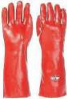
STYLE NO: ITS BRAND: SCI PVC CHEMICAL GLOVES - 40 CM ORIGIN: CHINA