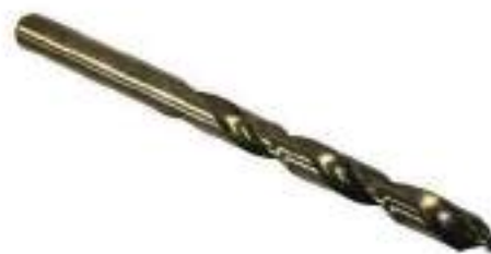
HBB M35 DRILL BITS ORIGIN: CHINA