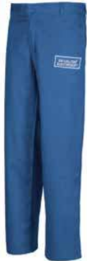
Product Number: 1412206-Pant