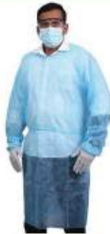
STYLE NO: ISG BRAND: VAULTEX NON-MEDICAL ISOLATION GOWN FREESIZE ORIGIN: CHINA