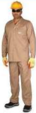
STYLE NO: CLM BRAND: WORKLAND 100% TWILL PANT & SHIRT - 190 GSM SIZE: S-5XL ORIGIN: CHINA