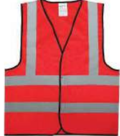
STYLE NO: BGP BRAND: VAULTX REFLECTIVE FABRIC VEST - 116 GSM SIZE: S-5XL ORIGIN: CHINA