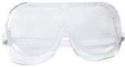
STYLE NO: ORQ COLOR: CLEAR ORIGIN: CHINA