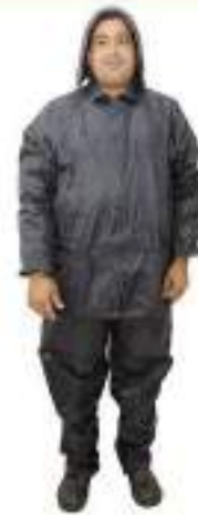
STYLE NO: ODP BRAND: VAULTEX PVC/POLYESTER RAIN SUIT SIZE: L-4XL ORIGIN: CHINA