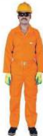
STYLE NO: 1OV BRAND: VAULTX 100% TWILL COVERALL - 190 GSM SIZE: S-5XL ORIGIN: CHINA