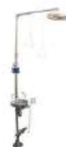
STYLE NO: 6250 SS BRAND: VAULTEX EMERGENCY EYEWASH SHOWER STANDARD: IS : 10592:1982 ORIGIN: INDIA