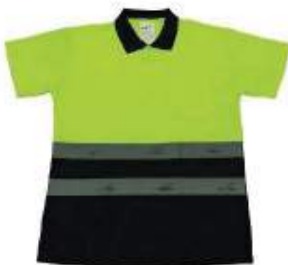
STYLE NO: KMJ BRAND: VAULTEX POLO T-SHIRT WITH VAULTEX REFLECTIVE - 245 GSM SIZE: S-4XL ORIGIN: CHINA