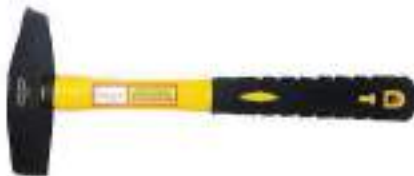
STYLE NO: SNP BRAND: ARMSTRONG CHIPPING HAMMER W/ TPR HANDLE (500 GMS) ORIGIN: CHINA