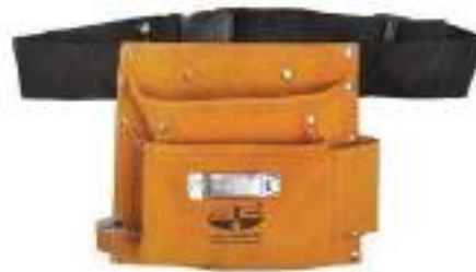
STYLE NO: CNE BRAND: SCI SPLIT LEATHER TOOL BAG (HD) ORIGIN: INDIA