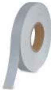
STYLE NO: BFA 1 INCH FLAME RETARDANT REFLECTIVE TAPE 50 METERS ORIGIN: CHINA