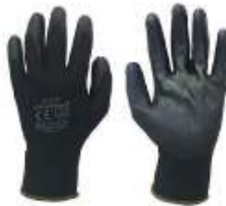
STYLE NO: MJA BRAND: VAULTEX PU COATED GLOVES SIZE: 10 ORIGIN: CHINA