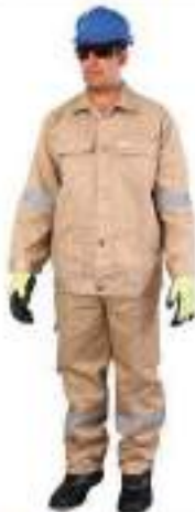
STYLE NO: UDO BRAND: VAULTEX 100% TWILL REFLECTIVE PANT & SHIRT 190 GSM SIZE: S-5XL ORIGIN: CHINA