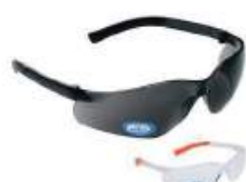
STYLE NO: V81 (ANTI-SCRATCH) BRAND: VAULTEX STANDARD: ANSI Z87.1, 2003/ EN 166 COLOR: CLEAR/DARK ORIGIN: TAIWAN