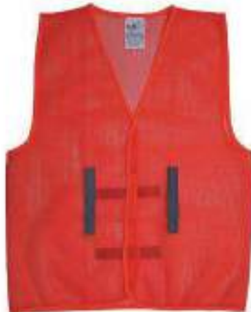
STYLE NO: TTL BRAND: VAULTX REFLECTIVE NET VEST - 45 GSM SIZE: S-5XL ORIGIN: CHINA