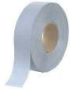
STYLE NO: BGD 2 INCH FLAME RETARDANT REFLECTIVE TAPE 50 METERS ORIGIN: CHINA