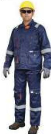
STYLE NO: NDO BRAND: VAULTEX 100% TWILL REFLECTIVE PANT & SHIRT 190 GSM (EUROPEAN STYLE) SIZE: S-5XL ORIGIN: CHINA