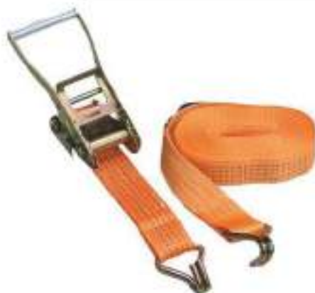
STYLE NO: HHR BRAND: SGI CARGO LASHING RATCHET 2 INCH X 3 TON X 10 MTR ORIGIN: CHINA