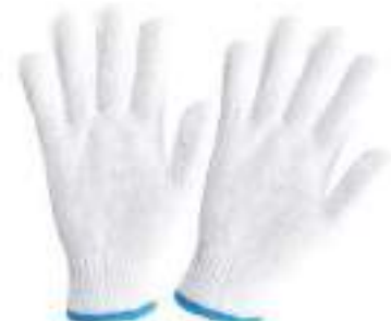
STYLE NO: LJP BLEACHED COTTON GLOVES APROX: 400 GMS / DZ ORIGIN: CHINA