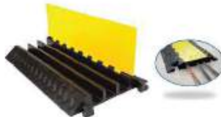
STYLE NO: ROG BRAND: SCI 3 CHANNEL HEAVY DUTY CABLE PROTECTOR L: 90CM X W: 60CM X H: 5CM X WT: 22KG ORIGIN: CHINA