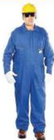
STYLE NO: LBFR BRAND: VAULTX 100% COTTON FIRE RETARDANT COVERALL - 320 GSM SIZE: S-5XL ORIGIN: CHINA