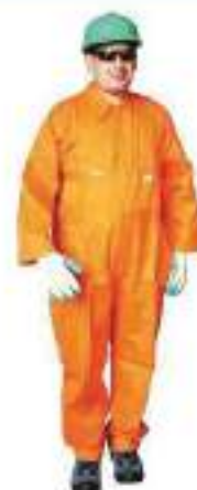
STYLE NO: LBFRD BRAND: VAULTX 100% COTTON FIRE RETARDANT COVERALL - 320 GSM SIZE: S-5XL ORIGIN: CHINA