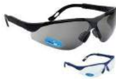
STYLE NO: V69 (ANTI-SCRATCH) BRAND: VAULTEX STANDARD: ANSI Z87.1, 2003/ EN 166 COLOR: CLEAR/DARK ORIGIN: TAIWAN