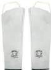
STYLE NO: LHS BRAND: ARMSTRONG LEATHER WELDING SLEEVE SIZE: 15" X 17" ORIGIN: PAKISTAN