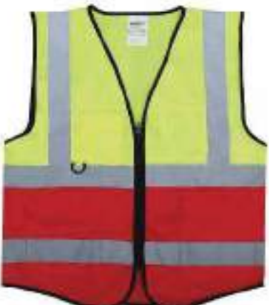
STYLE NO: KTI BRAND: VAULTX EXECUTIVE FABRIC VEST SIZE: S-5XL ORIGIN: CHINA