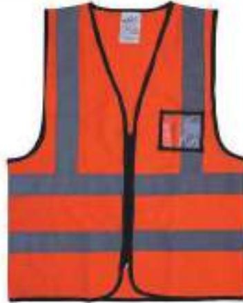
STYLE NO: ZKR BRAND: VAULTX EXECUTIVE FABRIC VEST - 116 GSM SIZE: S-5XL ORIGIN: CHINA