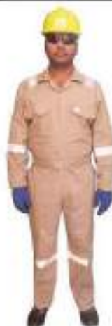
STYLE NO: CUR BRAND: VAULTX 100% COTTON REFLECTIVE COVERALL - 260 GSM SIZE: S-5XL ORIGIN: CHINA