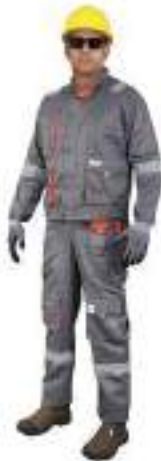
STYLE NO: YKT BRAND: VAULTEX 100% TWILL REFLECTIVE PANT & SHIRT 190 GSM (EUROPEAN STYLE) SIZE: S-5XL ORIGIN: CHINA