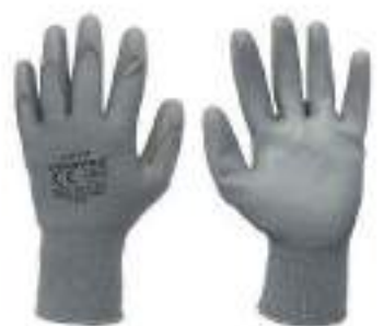
STYLE NO: CFN BRAND: VAULTEX PU COATED GLOVES SIZE: 10 ORIGIN: CHINA