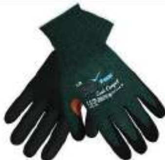
STYLE NO: ITA BRAND: VAULTX NITRILE FOAM COATED WITH CROTCH THUMB - CUT 3 SIZE: L & XL ORIGIN: SRI LANKA