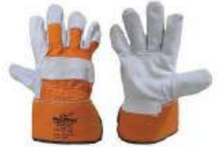
STYLE NO: JKC BRAND: VAULTX SINGLE PALM LEATHER GLOVES ORIGIN: PAKISTAN