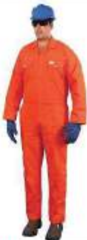
STYLE NO: KLG BRAND: VAULTEX 100% COTTON COVERALL 200 GSM SIZE: S-5XL ORIGIN: INDIA