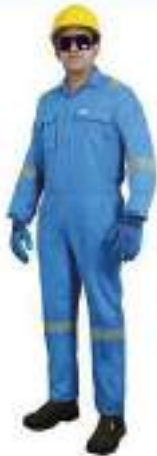
STYLE NO: ADI BRAND: VAULTEX 100% COTTON REFLECTIVE COVERALL - 240 GSM SIZE: S-5XL ORIGIN: INDIA