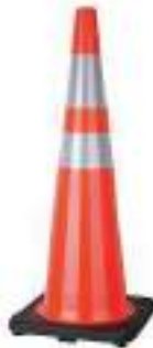
STYLE NO: EGN BRAND: SCI TRAFFIC CONE (SLIM BODY) - 90CM X 4.4KG ORIGIN: CHINA