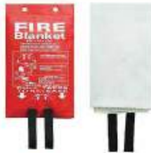
STYLE NO: FB1B FIRE BLANKET SIZE: 1.8M X 1.8M (6 Ft X 6 Ft) ORIGIN: CHINA