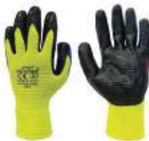
STYLE NO: MED BRAND: VAULTX NITRILE COATED GLOVES SIZE: 10 ORIGIN: CHINA