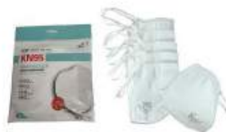
STYLE NO: BEN KN95 FLAT FOLD RESPIRATOR (VIC822) STANDARD: GB2626-2006 KN95 / EN 355 ORIGIN: CHINA