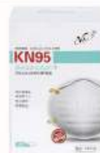
STYLE NO: AMM KN95 FLAT FOLD RESPIRATOR (VIC 951) STANDARD: GB2626-2006 KN95 / EN 355 ORIGIN: CHINA