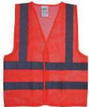
STYLE NO: GSR BRAND: VAULTX REFLECTIVE NET VEST - 60 GSM SIZE: S-5XL ORIGIN: CHINA