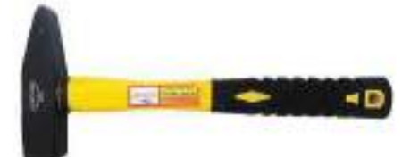
STYLE NO: EAO BRAND: ARMSTRONG MACHINIST HAMMER W/ TPR HANDLE (800 GMS) ORIGIN: CHINA