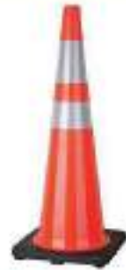
STYLE NO: BHK BRAND: SCI TRAFFIC CONE - 70CM X 3.2KG ORIGIN: CHINA