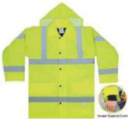
STYLE NO: HMF BRAND: VAULTEX WINTER JACKET WITH INNER CUFF SIZE: S-5XL ORIGIN: CHINA