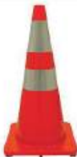
STYLE NO: PUC TRAFFIC CONE (WIDE BODY) - 70CM X 1.9KG ORIGIN: CHINA