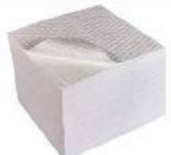
STYLE NO: BBU OIL SORBENT PADS - SEP100 ORIGIN: USA