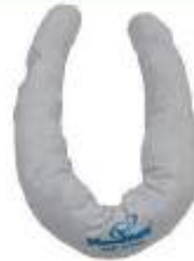
STYLE NO: DDC BRAND: VAULTEX ORGANIC SORBENT SOCKS ( OIL ONLY ) SIZE: 3 X 4 INCH CAPACITY: 7.8 LITERS PER PC ORIGIN: INDIA