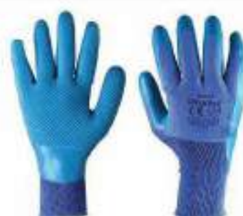
STYLE NO: BAJ BRAND: VAULTEX LATEX COATED GLOVES SIZE: 10 ORIGIN: CHINA