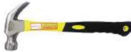
STYLE NO: TOB BRAND: ARMSTRONG CLAW HAMMER W/ TPR HANDLE (16 oz) ORIGIN: CHINA