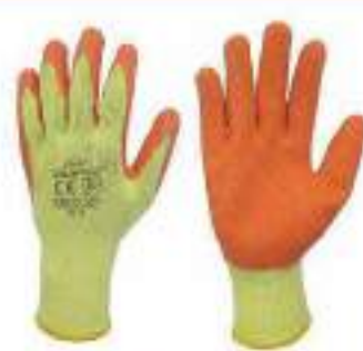
STYLE NO: OLM BRAND: VAULTEX LATEX COATED GLOVES SIZE: 10 ORIGIN: CHINA