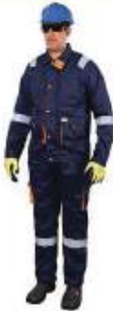
STYLE NO: DUE BRAND: VAULTEX 100% TWILL REFLECTIVE PANT & SHIRT 190 GSM (EUROPEAN STYLE) SIZE: S-5XL ORIGIN: CHINA