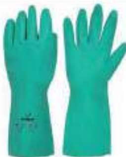
STYLE NO: PLR BRAND: VAULTEX NITRILE GLOVES - 33 CM SIZE: M(8), L(9), XL(10), 2XL(11) ORIGIN: SRI LANKA