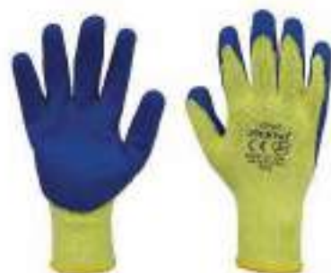
STYLE NO: SPR BRAND: VAULTEX LATEX COATED GLOVES SIZE: 10 ORIGIN: CHINA