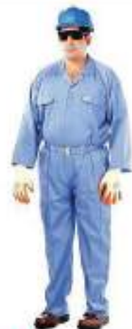
STYLE NO: EMB BRAND: VAULTX 100% TWILL COVERALL - 190 GSM SIZE: S-5XL ORIGIN: CHINA