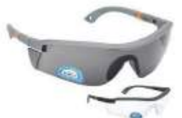
STYLE NO: V121 (ANTI-SCRATCH) BRAND: VAULTEX STANDARD: ANSI Z87.1, 2003/ EN 166 COLOR: CLEAR/DARK ORIGIN: TAIWAN