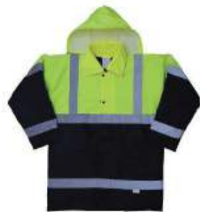
STYLE NO: KIP BRAND: VAULTEX WINTER JACKET WITH VAULTEX REFLECTIVE SIZE: S-5XL ORIGIN: CHINA