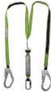
STYLE NO: KYM BRAND: VAULTEX FULL BODY HARNESS STANDARD: EN355, EN354 ORIGIN: INDIA