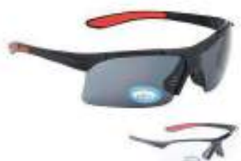
STYLE NO: V109 (ANTI-SCRATCH) BRAND: VAULTEX STANDARD: ANSI Z87.1, 2003/ EN 166 COLOR: CLEAR/DARK ORIGIN: TAIWAN