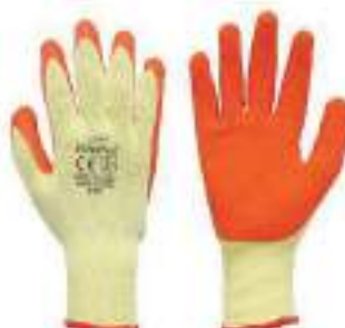
STYLE NO: SWH BRAND: VAULTEX LATEX COATED GLOVES SIZE: 10 ORIGIN: CHINA