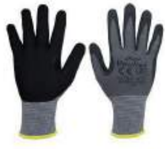
STYLE NO: LWE BRAND: VAULTX NITRILE FOAM COATED GLOVES SIZE: 8, 9, 10, 11 ORIGIN: CHINA