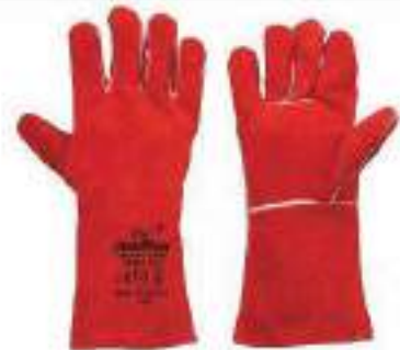
STYLE NO: CQT BRAND: VAULTEX WELDING GLOVES WITH PIPING 14 INCH ORIGIN: PAKISTAN