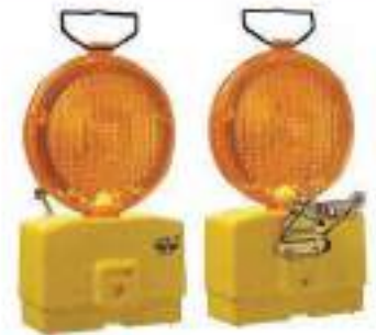
STYLE NO: 881302 BRAND: SCI DOUBLE BATTERY FLASHING LIGHT WITH BRACKET ORIGIN: CHINA