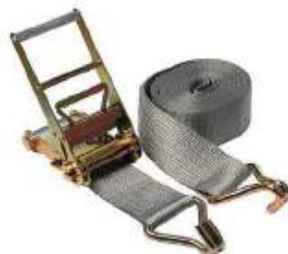
STYLE NO: SPL2 BRAND: SGI CARGO LASHING RATCHET 4 INCH X 10 TON X 10 MTR ORIGIN: CHINA