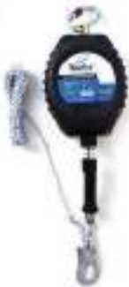
STYLE NO: 7UMR BRAND: VAULTEX RETRACTABLE FALL ARRESTER LENGTH: 7 METERS ORIGIN: INDIA