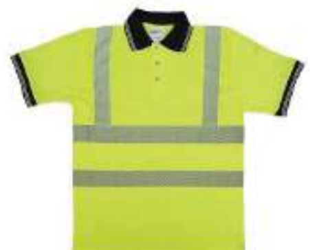
STYLE NO: AHD BRAND: VAULTEX REFLECTIVE POLO T-SHIRT SIZE: S-4XL ORIGIN: CHINA