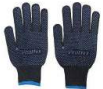
STYLE NO: UBY BRAND: VAULTEX DOUBLE SIDE DOTTED GLOVES ORIGIN: CHINA