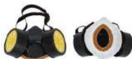
STYLE NO: NOG BRAND: ARMSTRONG INDUSTRIAL HALF FACE MASK TWIN CARTRIDGE + SINGLE EXHALATION VALVE ORIGIN: CHINA