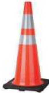
STYLE NO: KPH BRAND: SCI TRAFFIC CONE (WIDE BODY) - 90CM X 4.4KG ORIGIN: CHINA