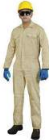
STYLE NO: TVU BRAND: VAULTEX 100% COTTON COVERALL - 200 GSM SIZE: S-5XL ORIGIN: INDIA