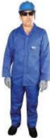
STYLE NO: PFB BRAND: WORKLAND 100% TWILL PANT & SHIRT - 190 GSM SIZE: S-5XL ORIGIN: CHINA