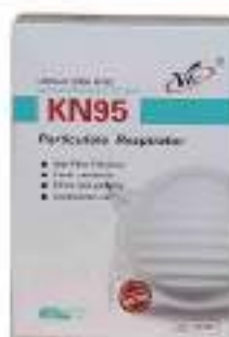
STYLE NO: RAN KN95 FLAT FOLD RESPIRATOR (VIC 821) STANDARD: GB2626-2006 KN95 / EN 355 ORIGIN: CHINA