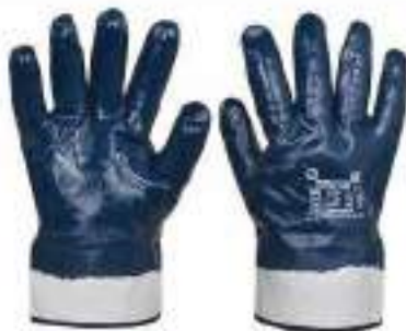
STYLE NO: N8C NITRILE GLOVES WITH CUFF ORIGIN: CHINA