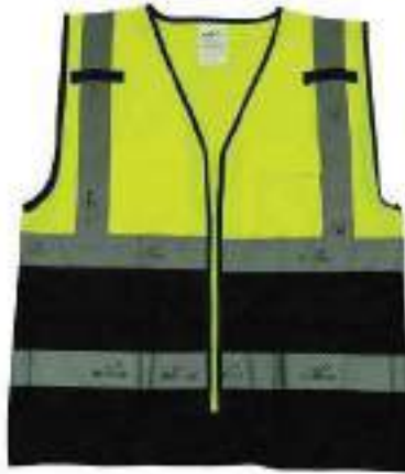
STYLE NO: IKT BRAND: VAULTEX EXECUTIVE FABRIC VEST - 186 GSM SIZE: S-5XL ORIGIN: CHINA