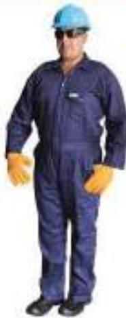
STYLE NO: N100 BRAND: WORKLAND 100% COTTON COVERALL - 190 GSM SIZE: S-5XL ORIGIN: CHINA