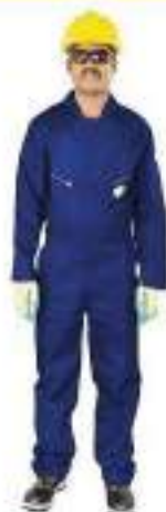
STYLE NO: LBFRN BRAND: VAULTX 100% COTTON FIRE RETARDANT COVERALL - 320 GSM SIZE: S-5XL ORIGIN: CHINA