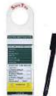
STYLE NO: SCT SCAFFOLDING TAGS ORIGIN: INDIA