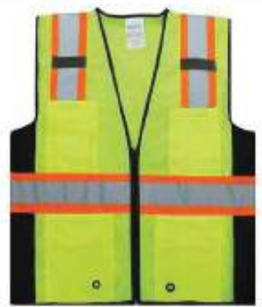
STYLE NO: OMB BRAND: VAULTEX STRETCHABLE MESH & FABRIC VEST SIZE: S-5XL ORIGIN: CHINA