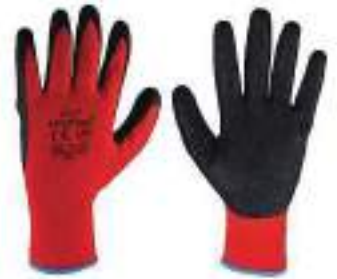
STYLE NO: GPL BRAND: VAULTEX LATEX COATED GLOVES SIZE: 10 ORIGIN: CHINA