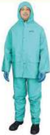
STYLE NO: SGC BRAND: ARMSTRONG PVC CHEMICAL SUIT SIZE: S-4XL ORIGIN: CHINA