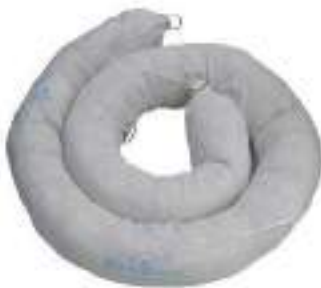
STYLE NO: BOM BRAND: VAULTEX ORGANIC SORBENT BOOM ORIGIN: INDIA