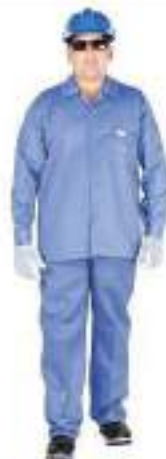
STYLE NO: MLD BRAND: WORKLAND 100% TWILL PANT & SHIRT - 190 GSM SIZE: S-5XL ORIGIN: CHINA