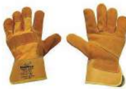
STYLE NO: NHO BRAND: VAULTX PATCHED PALM LEATHER GLOVES ORIGIN: PAKISTAN