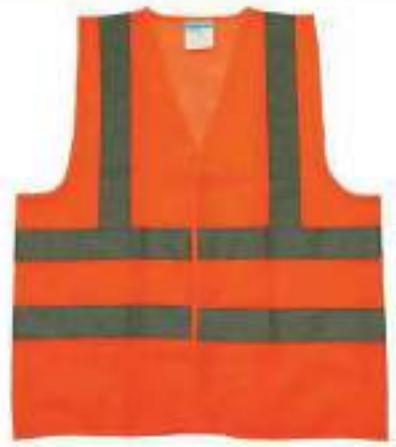
STYLE NO: JET BRAND: WORKLAND REFLECTIVE FABRIC VEST - 68 GSM SIZE: S-5XL ORIGIN: CHINA