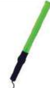
STYLE NO: PKA TRAFFIC BATON LIGHT GREEN FLASHING/GREEN STEADY LIGHT ORIGIN: CHINA