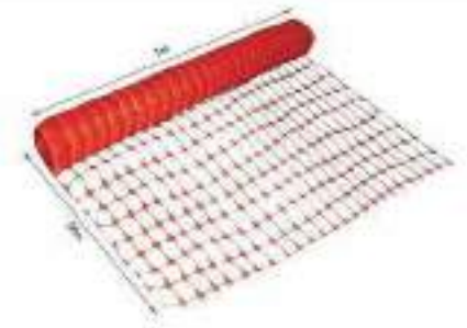
STYLE NO: M80 BRAND: SCI HI-VISIBILITY FENCING MESH - 1M X 50M ORIGIN: CHINA