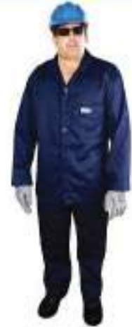
STYLE NO: SPC BRAND: WORKLAND 100% TWILL PANT & SHIRT - 190 GSM SIZE: S-5XL ORIGIN: CHINA