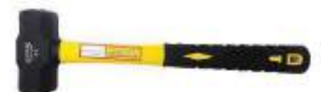
STYLE NO: DBM BRAND: ARMSTRONG SLEDGE HAMMER W/ TPR HANDLE (2 Lb) ORIGIN: CHINA