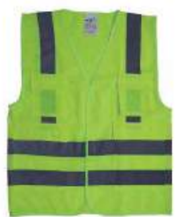
STYLE NO: CKT BRAND: VAULTEX EXECUTIVE FABRIC VEST - 110 GSM SIZE: S-5XL ORIGIN: CHINA