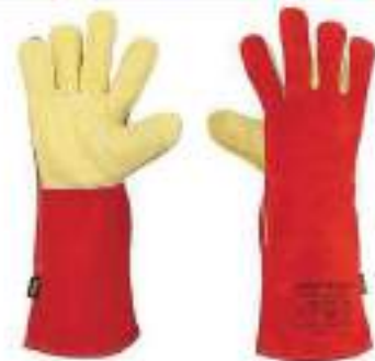
STYLE NO: MAJ BRAND: ARMSTRONG WELDING GLOVES WITH KEVLAR THREAD STITCHING - SINGLE PALM ORIGIN: PAKISTAN