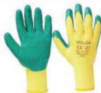
STYLE NO: CNG BRAND: MILLER LATEX COATED GLOVES SIZE: 10 ORIGIN: CHINA