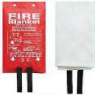
STYLE NO: FB12.1B30 FIRE BLANKET SIZE: 1.2M X 1.8M (4 Ft X 6 Ft) ORIGIN: CHINA