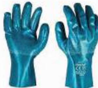
STYLE NO: K6M BRAND: VAULTEX NITRILE GRANULAR INTERLOCK GLOVES ORIGIN: CHINA