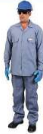
STYLE NO: 2BRWL BRAND: WORKLAND 35/65 POLYCOTTON PANT & SHIRT - 135 GSM SIZE: S-5XL ORIGIN: CHINA