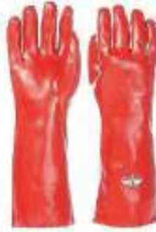
STYLE NO: R40 BRAND: SCI PVC CHEMICAL GLOVES - 16 INCH ORIGIN: CHINA