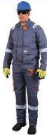
STYLE NO: MPB BRAND: VAULTEX 100% TWILL REFLECTIVE PANT & SHIRT 190 GSM (EUROPEAN STYLE) SIZE: S-5XL ORIGIN: CHINA