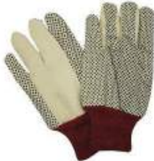
STYLE NO: VDA BRAND: VAULTEX DOTTED GLOVES APROX: 1130 GMS / DZ ORIGIN: PAKISTAN