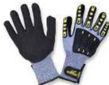
STYLE NO: RUB72 BRAND: VAULTEX MECHANICAL GLOVES (ANTI-VIBRATION) SIZE: L, XL ORIGIN: CHINA