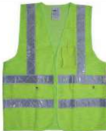
STYLE NO: PSM BRAND: VAULTEX NET VEST WITH PVC REFLECTIVE - 140 GSM SIZE: S-5XL ORIGIN: CHINA