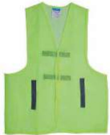
STYLE NO: PQM BRAND: WORKLAND REFLECTIVE FABRIC VEST - 35 GSM FREE SIZE ORIGIN: CHINA