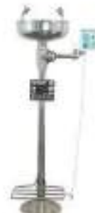
STYLE NO: 4710 SS BRAND: VAULTEX EMERGENCY EYEWASH STATION STANDARD: IS : 10592:1982 ORIGIN: INDIA