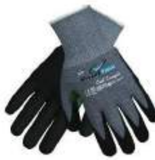
STYLE NO: JNU BRAND: VAULTX NITRILE FOAM COATED WITH CROTCH THUMB - CUT 5 SIZE: L & XL ORIGIN: SRI LANKA