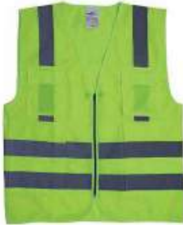
STYLE NO: NKO BRAND: VAULTEX EXECUTIVE FABRIC VEST - 120 GSM SIZE: S-5XL ORIGIN: CHINA