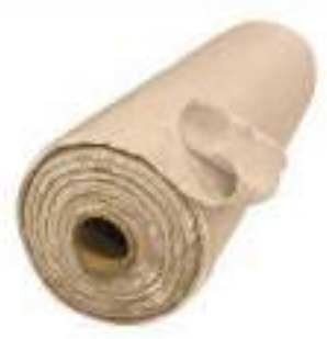
STYLE NO: FGB FIRE BLANKET ROLL SIZE: 1.6MM X 1M X 50M ORIGIN: CHINA