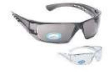
STYLE NO: V151 (ANTI-SCRATCH) BRAND: VAULTEX STANDARD: ANSI Z87.1, 2003/ EN 166 COLOR: CLEAR/DARK ORIGIN: TAIWAN