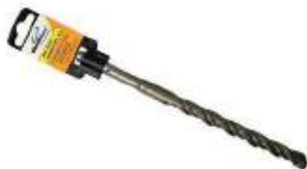
SDB PLUS HAMMER DRILL BITS ORIGIN: CHINA