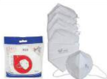
STYLE NO: RUN KN95 FLAT FOLD RESPIRATOR MASK STANDARD: GB2626-2006 KN95 / EN 355 ORIGIN: CHINA