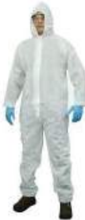
STYLE NO: TGS BRAND: VAULTEX NON-MEDICAL DISPOSABLE COVERALL 30 GSM SIZE: S-5XL ORIGIN: CHINA