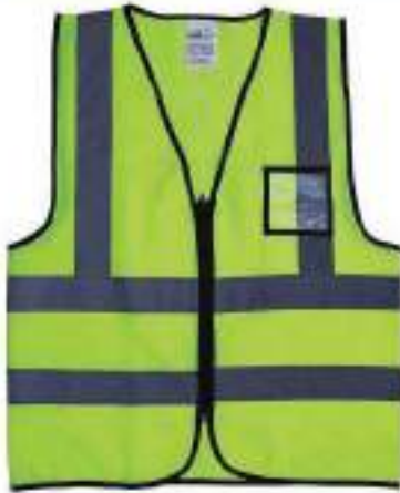
STYLE NO: BUP BRAND: VAULTX EXECUTIVE FABRIC VEST - 116 GSM SIZE: S-5XL ORIGIN: CHINA