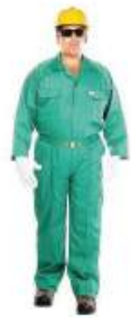
STYLE NO: 1BV BRAND: VAULTX 100% TWILL COVERALL - 190 GSM SIZE: S-5XL ORIGIN: CHINA