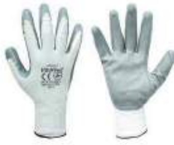
STYLE NO: GNG BRAND: VAULTX NITRILE COATED GLOVES SIZE: 10 ORIGIN: CHINA