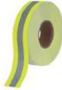
STYLE NO: MOC 2 INCH FLAME RETARDANT REFLECTIVE TAPE 50 METERS ORIGIN: CHINA