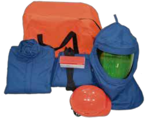
Arc Flash 40 Cal Kit with Standard Hood

INSKLFH40S INSKLFH40M INSKLFH40L INSKLFH40XL INSKLFH40XXL