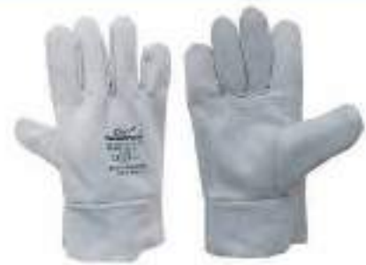
STYLE NO: NFG BRAND: VAULTEX CHROME WELDING GLOVES-26CM ORIGIN: PAKISTAN