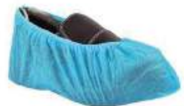
STYLE NO: CDU SHOE COVER (NON-WOVEN PP) ORIGIN: CHINA