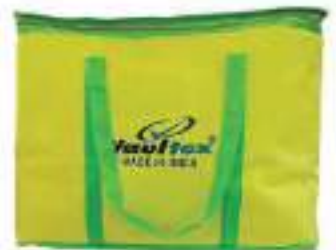
STYLE NO: SIB BRAND: VAULTEX OIL & CHEMICAL SPILL KIT BAG ORIGIN: INDIA