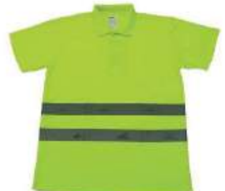
STYLE NO: LAU BRAND: VAULTEX POLO T-SHIRT WITH VAULTEX REFLECTIVE - 245 GSM SIZE: S-4XL ORIGIN: CHINA