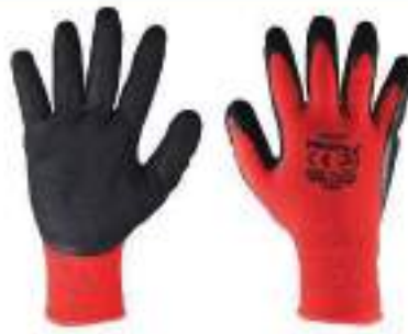
STYLE NO: DMP BRAND: VAULTEX NITRILE COATED GLOVES SANDY FINISH SIZE: 10 ORIGIN: CHINA