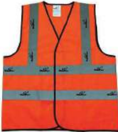
STYLE NO: CMP BRAND: VAULTX FABRIC VEST WITH VAULTX REFLECTIVE - 151 GSM SIZE: S-5XL ORIGIN: CHINA