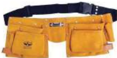
STYLE NO: IRE BRAND: SCI SPLIT LEATHER TOOL BAG (HD) ORIGIN: INDIA