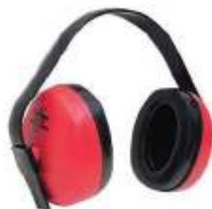
STYLE NO: EML BRAND: VAULTX MULTI POSITION EAR MUFF ORIGIN: TAIWAN