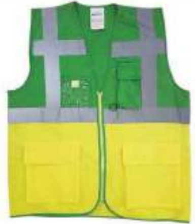
STYLE NO: IKM BRAND: VAULTEX EXECUTIVE FABRIC VEST - 180 GSM SIZE: S-5XL ORIGIN: CHINA