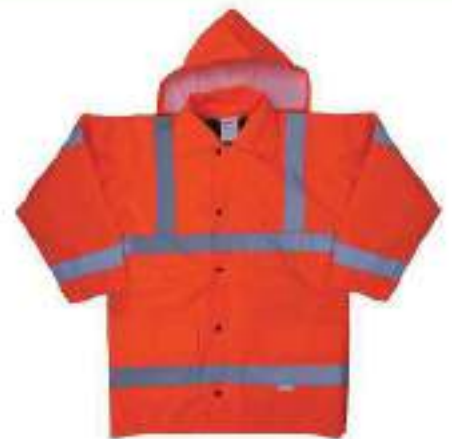
STYLE NO: JGG BRAND: VAULTEX WINTER JACKET WITH REFLECTIVE SIZE: S-5XL ORIGIN: CHINA