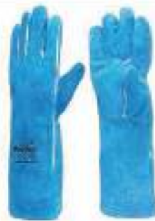
STYLE NO: MKD BRAND: VAULTEX WELDING GLOVES WITH PIPING 16 INCH ORIGIN: PAKISTAN