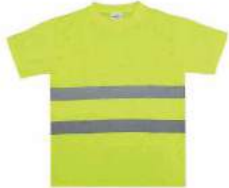
STYLE NO: NFP BRAND: VAULTX REFLECTIVE ROUND NECK T-SHIRT SIZE: S-5XL ORIGIN: CHINA