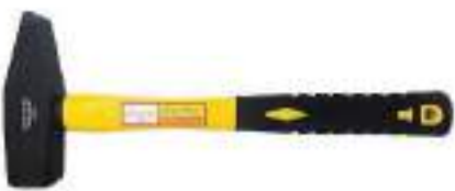
STYLE NO: TJM BRAND: ARMSTRONG MACHINIST HAMMER W/ TPR HANDLE (1000 GMS) ORIGIN: CHINA