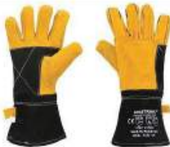
STYLE NO: NHA15 BRAND: ARMSTRONG WELDING GLOVES WITH KEVLAR THREAD STITCHING - PATCHED PALM ORIGIN: PAKISTAN