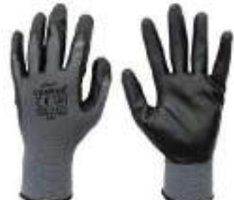
STYLE NO: JAF BRAND: VAULTX NITRILE FOAM COATED GLOVES SIZE: 10 ORIGIN: CHINA