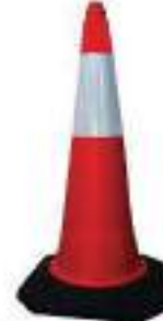
STYLE NO: TC1 BRAND: SCI TRAFFIC CONE - 75CM X 2.2KG ORIGIN: CHINA