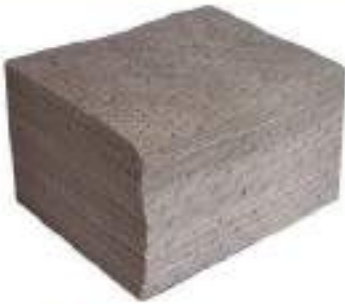
STYLE NO: ORM UNIVERSAL BONDED SORBENT PADS ORIGIN: USA