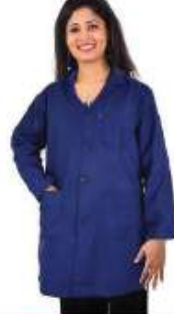
STYLE NO: DMW BRAND: AMERICAN TAG 35/65 LABCOAT SIZE: S-5XL ORIGIN: CHINA