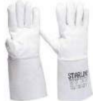
STYLE NO: BLT BRAND: STARLINE TIG WELDING GLOVES ORIGIN: PAKISTAN