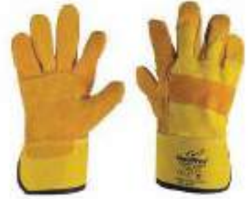
STYLE NO: PFY BRAND: VAULTX PATCHED PALM LEATHER GLOVES ORIGIN: PAKISTAN