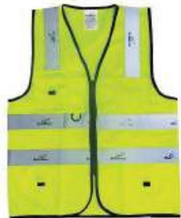
STYLE NO: SBQ BRAND: VAULTX EXECUTIVE FABRIC VEST - 165 GSM SIZE: S-5XL ORIGIN: CHINA