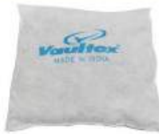
STYLE NO: LLB BRAND: VAULTEX ORGANIC SORBENT PILLOW ( OIL ONLY ) SIZE: 10 X 10 INCH CAPACITY: 3 LITERS PER PC ORIGIN: INDIA