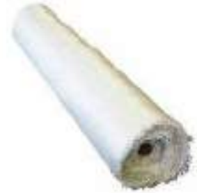
STYLE NO: PNG FIRE BLANKET ROLL SIZE: 0.43MM X 1M X 50M ORIGIN: CHINA