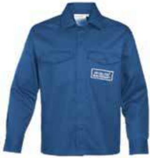
Product Number: 1412205-Shirt

Recommended for electrical maintenance and operations personnel Designed for protection from HRC2 electrical Arc Flash hazards