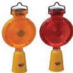
STYLE NO: 81359B BRAND: SCI SOLAR FLASHING LIGHT WITH 6 LEDs ORIGIN: CHINA