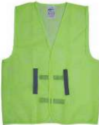
STYLE NO: PRM BRAND: VAULTX REFLECTIVE NET VEST - 45 GSM SIZE: S-5XL ORIGIN: CHINA