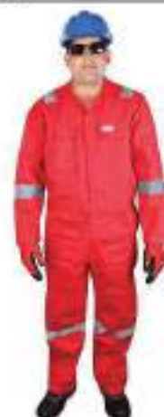
STYLE NO: RDD BRAND: VAULTX 100% COTTON REFLECTIVE COVERALL - 260 GSM SIZE: S-5XL ORIGIN: CHINA