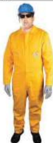
STYLE NO: EIT BRAND: VAULTX 100% COTTON FIRE RETARDANT COVERALL - 320 GSM SIZE: S-5XL ORIGIN: CHINA