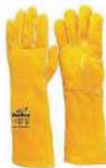
STYLE NO: WG12 BRAND: VAULTEX WELDING GLOVES WITH PIPING 16 INCH ORIGIN: PAKISTAN