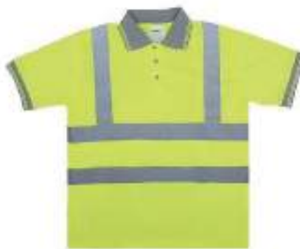
STYLE NO: FKB BRAND: VAULTEX REFLECTIVE POLO T-SHIRT SIZE: S-4XL ORIGIN: CHINA