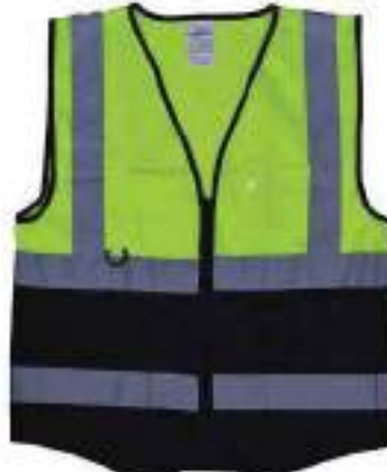
STYLE NO: BKM BRAND: VAULTX EXECUTIVE FABRIC VEST SIZE: S-5XL ORIGIN: CHINA