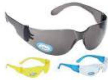
STYLE NO: V71 (ANTI-SCRATCH) BRAND: VAULTEX STANDARD: ANSI Z87.1, 2003/ EN 166 COLOR: CLEAR/DARK/YELLOW ORIGIN: TAIWAN