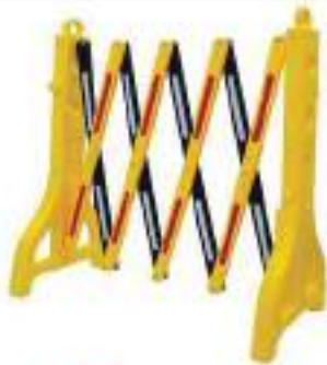
STYLE NO: BTC EXPANDABLE BARRIER L: 2.5M X H: 96CM X WT: 2.4KG ORIGIN: CHINA