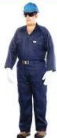
STYLE NO: 1NV BRAND: VAULTX 100% TWILL COVERALL - 190 GSM SIZE: S-5XL ORIGIN: CHINA