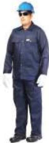
STYLE NO: CNV BRAND: VAULTX 100% TWILL PANT & SHIRT - 190 GSM SIZE: S-5XL ORIGIN: CHINA