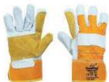
STYLE NO: DPX BRAND: VAULTX DOUBLE PALM LEATHER GLOVES ORIGIN: PAKISTAN