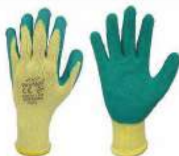
STYLE NO: GRY BRAND: VAULTEX LATEX COATED GLOVES SIZE: 10 ORIGIN: CHINA