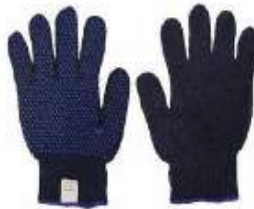
STYLE NO: SDB BRAND: WORKLAND SINGLE SIDE DOTTED GLOVES ORIGIN: PAKISTAN