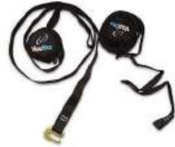
STYLE NO: UBT BRAND: VAULTEX SUSPENSION TRAUMA LENGTH: 1.2 METER ORIGIN: INDIA