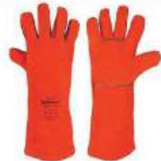
STYLE NO: TAM BRAND: VAULTEX WELDING GLOVES WITH PIPING 16 INCH ORIGIN: PAKISTAN