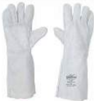
STYLE NO: TPJ BRAND: VAULTEX CHROME WELDING GLOVES - 40 CM ORIGIN: PAKISTAN