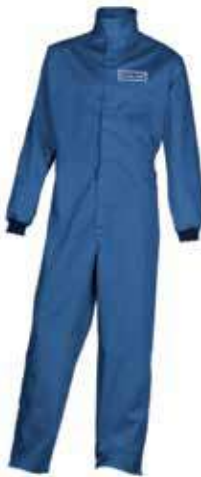
Product Number: 1412209-Coverall