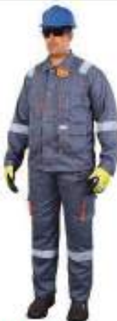
STYLE NO: GEM BRAND: VAULTEX 100% COTTON REFLECTIVE PANT & SHIRT 260 GSM (EUROPEAN STYLE) SIZE: S-5XL ORIGIN: CHINA