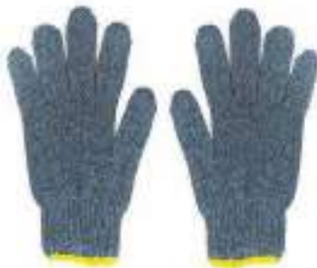
STYLE NO: G70 KNITTED GLOVES APPROX: 640 GMS / DZ ORIGIN: CHINA