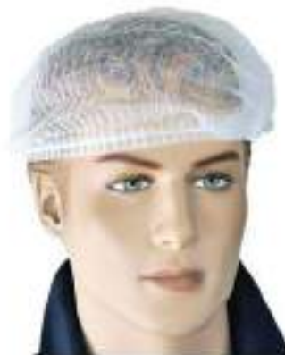
STYLE NO: CAP DISPOSABLE CLIP CAP ORIGIN: CHINA