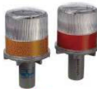
STYLE NO: 81325 BRAND: SCI SOLAR FLASHING LIGHT WITH 4 LEDs LIGHTS ORIGIN: CHINA