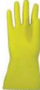
STYLE NO: AAM BRAND: SURF RUBBER FLOCKLINE GLOVES - 29-30 CM SIZE: 7(7.5), 8(8.5), 9(9.5), 10(10.5) ORIGIN: SRI LANKA