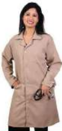
STYLE NO: PMY BRAND: AMERICAN TAG 35/65 LABCOAT SIZE: S-5XL ORIGIN: CHINA