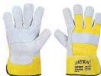
STYLE NO: XLG PATCHED PALM LEATHER GLOVES ORIGIN: PAKISTAN