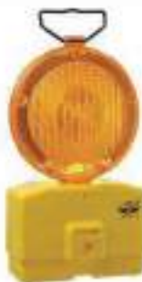
STYLE NO: 81302 BRAND: SCI DOUBLE BATTERY FLASHING LIGHT WITH BRACKET ORIGIN: CHINA