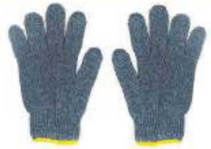
STYLE NO: G46 KNITTED GLOVES APPROX: 550 GMS / DZ ORIGIN: CHINA