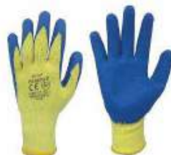
STYLE NO: BGL BRAND: VAULTEX LATEX COATED GLOVES SIZE: 10 ORIGIN: CHINA