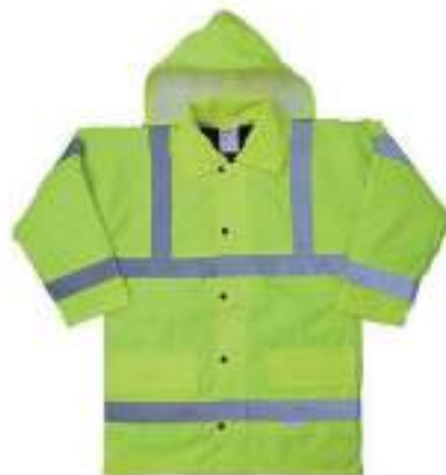
STYLE NO: LUR BRAND: VAULTEX WINTER JACKET WITH VAULTEX REFLECTIVE SIZE: S-5XL ORIGIN: CHINA