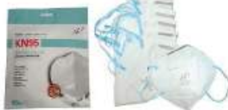
STYLE NO: MHM KN95 FLAT FOLD RESPIRATOR WITH VALVE (VIC824) STANDARD: GB2626-2006 KN95 / EN 355 ORIGIN: CHINA