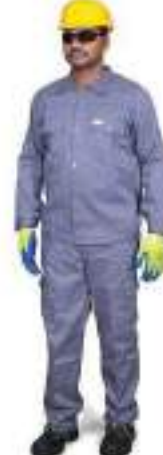
STYLE NO: MJT BRAND: VAULTX 100% TWILL PANT & SHIRT - 190 GSM SIZE: S-5XL ORIGIN: CHINA