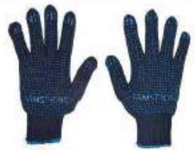
STYLE NO: MRS BRAND: ARMSTRONG DOUBLE SIDE DOTTED GLOVES ORIGIN: CHINA