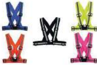
STYLE NO: ADV BRAND: VAULTX ADJUSTABLE REFLECTIVE VEST FREESIZE ORIGIN: CHINA