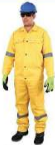
STYLE NO: JFY BRAND: VAULTX 100% TWILL REFLECTIVE PANT & SHIRT 190 GSM SIZE: S-5XL ORIGIN: CHINA