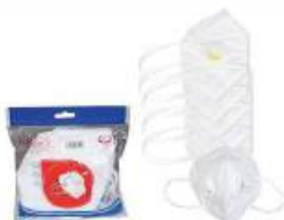
STYLE NO: URB KN95 FLAT FOLD RESPIRATOR MASK WITH VALVE STANDARD: GB2626-2006 KN95 / EN 355 ORIGIN: CHINA