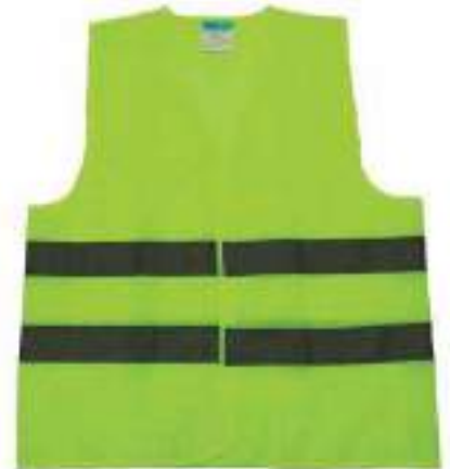
STYLE NO: MDQ BRAND: WORKLAND REFLECTIVE FABRIC VEST - 63 GSM SIZE: S-5XL ORIGIN: CHINA