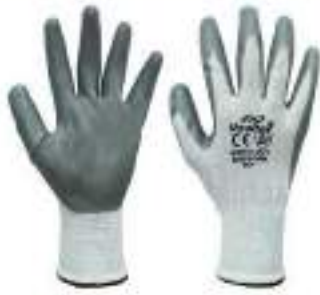
STYLE NO: BKP BRAND: VAULTX NITRILE COATED GLOVES SIZE: 10 ORIGIN: CHINA