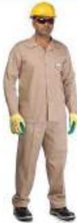
STYLE NO: S2P BRAND: WORKLAND 100% COTTON PANT & SHIRT - 190 GSM SIZE: S-5XL ORIGIN: CHINA