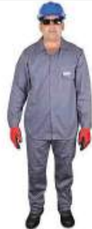
STYLE NO: GHR BRAND: WORKLAND 100% COTTON PANT & SHIRT - 190 GSM SIZE: S-5XL ORIGIN: CHINA