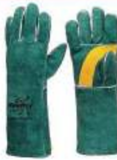
STYLE NO: DPW BRAND: VAULTEX HOCKEY PALM WELDING GLOVES WITH PIPING 16 INCH ORIGIN: PAKISTAN