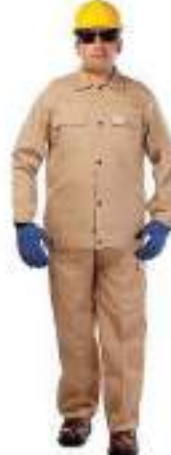
STYLE NO: CBV BRAND: VAULTX 100% TWILL PANT & SHIRT - 190 GSM SIZE: S-5XL ORIGIN: CHINA