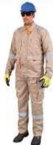
STYLE NO: CSO BRAND: VAULTEX 100% TWILL REFLECTIVE PANT & SHIRT 190 GSM (EUROPEAN STYLE) SIZE: S-5XL ORIGIN: CHINA