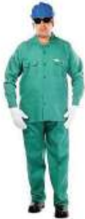
STYLE NO: 2RWL BRAND: WORKLAND 35/65 POLYCOTTON PANT & SHIRT - 135 GSM SIZE: S-5XL ORIGIN: CHINA