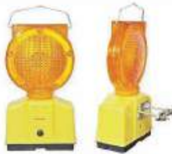
STYLE NO: WNP BRAND: SCI SOLAR FLASHING LIGHT WITH BRACKET ORIGIN: CHINA