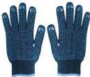
STYLE NO: SDD DOUBLE SIDE DOTTED GLOVES ORIGIN: CHINA