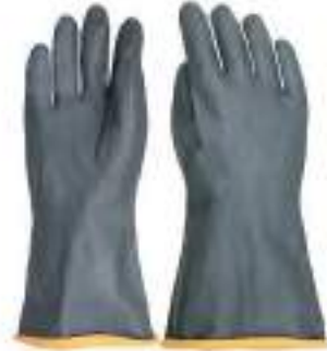
STYLE NO: VB111 BRAND: VAULTX LATEX GLOVES - 140 GRAMS ORIGIN: CHINA