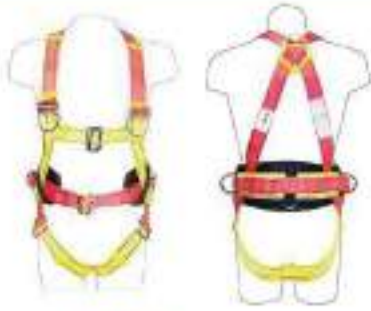
STYLE NO: UB104 BRAND: VAULTEX FULL BODY HARNESS STANDARD: EN361 & CE MARKED ORIGIN: INDIA