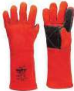
STYLE NO: UKP BRAND: VAULTEX DOUBLE PALM WELDING GLOVES WITH PIPING 16 INCH ORIGIN: PAKISTAN