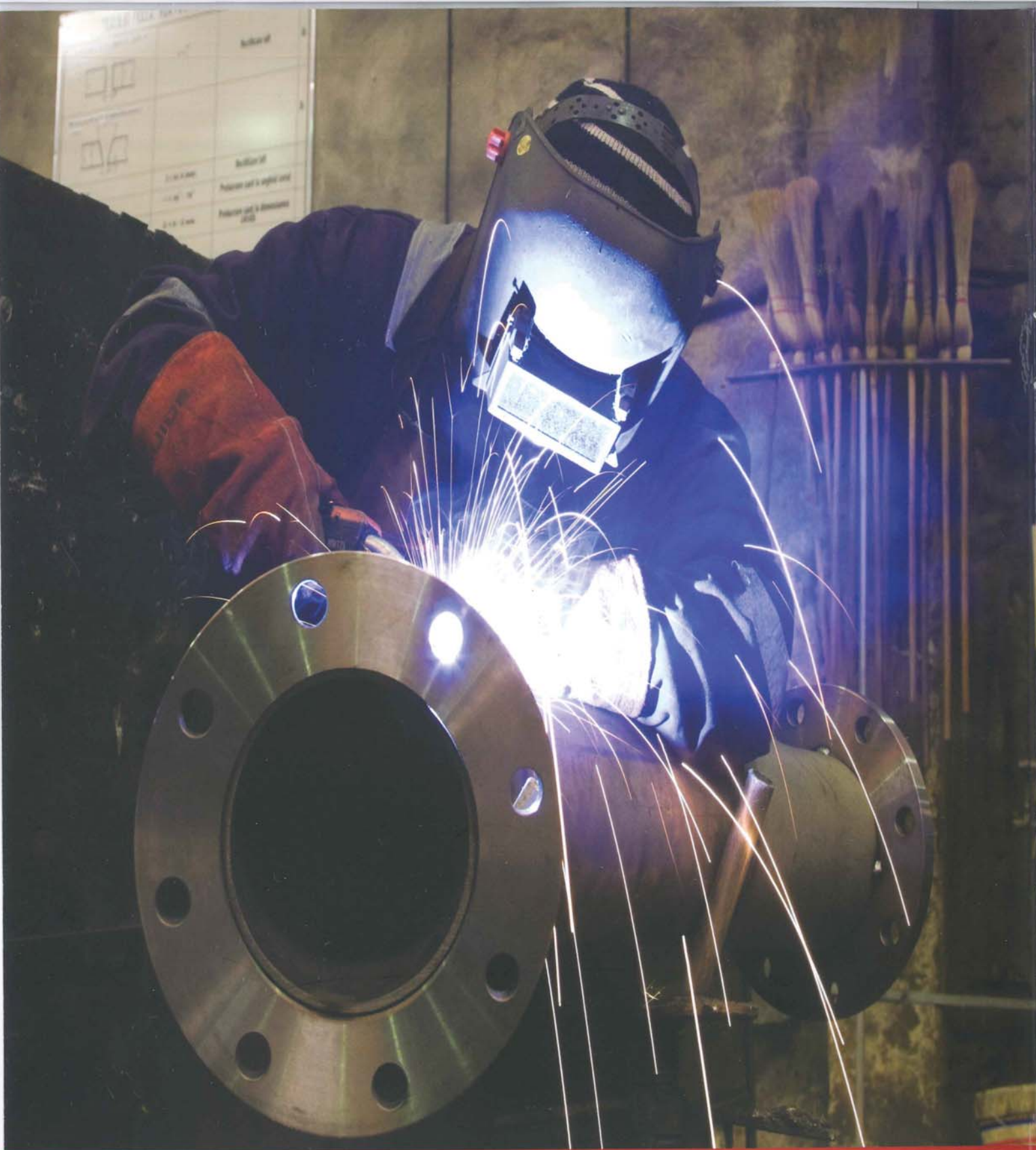
Production Facility - Sharjah - U.A.E.