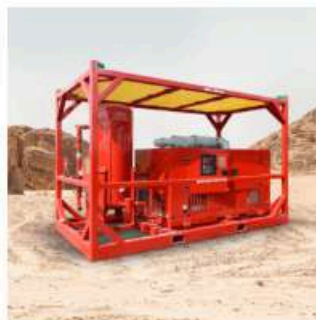
Air Compressor (100, 300, 400, 800 CFM Capacity) Zone-2 rated