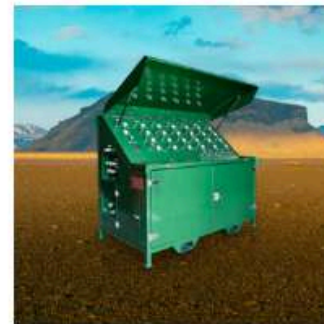
High Pressure Power Units (Air Driven)