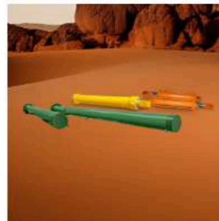
Hydraulic Cylinders Overhaul