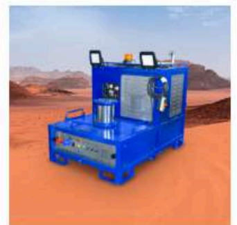
Capstan Mechanism Portable