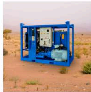
Hydraulic Power Unit (Electric Driven)