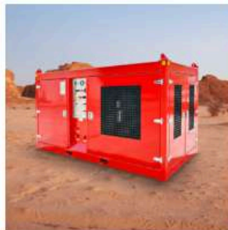
Power Units (Hazardous / Explosion Proof)