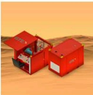
Easy Line (Open Console Wireline Unit)