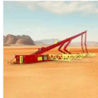
C80 Catwalk & Tubular Handling System