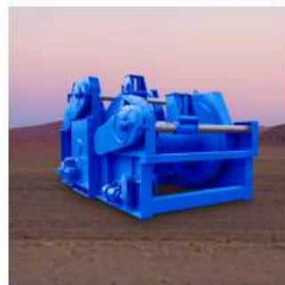
Hydraulic Winch Systems