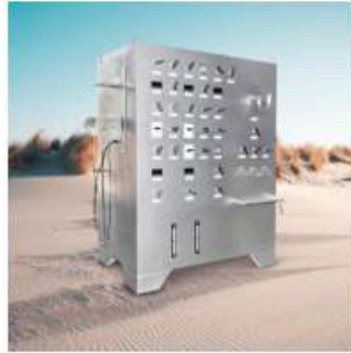
Pressure Testing Unit