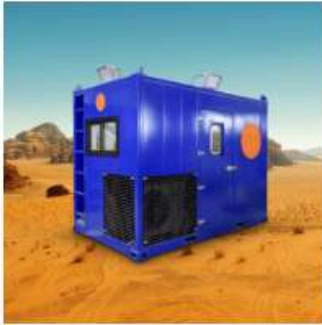
Pressurized Modules Zone 2