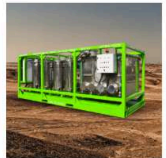
Chemical Cleaning & Lube Oil Flushing Unit