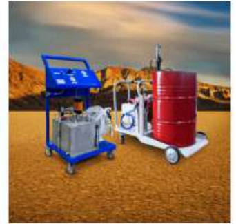
Oil Filling Unit