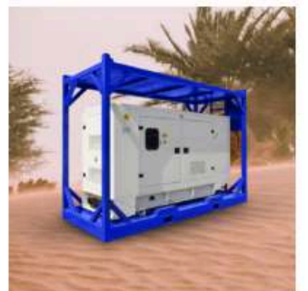
Zone2 Generator (Dual Frequency)