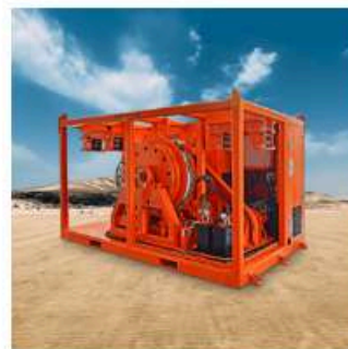
Single Capstan Pulling Mechanism (ESP Cable / 7 Tonnes / Zone 2)