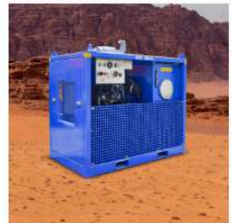
Hydraulic Power Unit (Engine Driven)