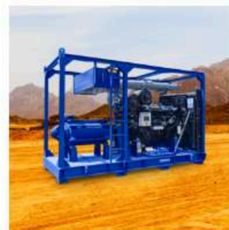
Diesel Engine Filling Unit