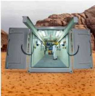
40 Feet Containerized Pressure Test Unit