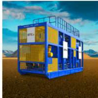
Batch Mixer Cementing / Acidizing