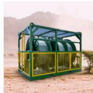
Hose Reel Twin Drum