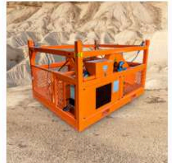
Cable Spooler Pneumatic Driven