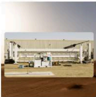
Marine Screed Frame