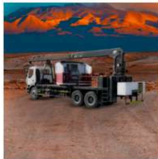
Integrated Wireline Crane Truck