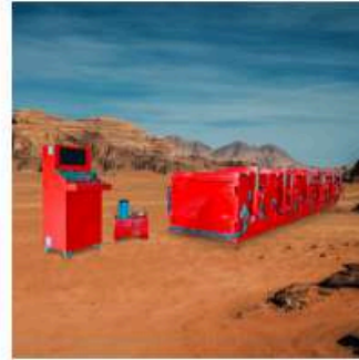
Pressure Test Bay (20,000 PSI Rated)