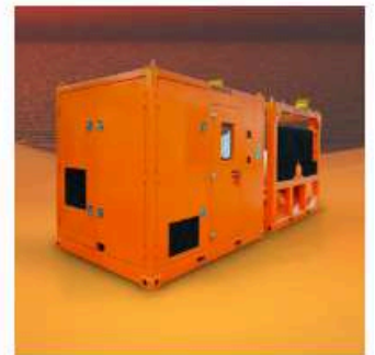
ESP Deployment Unit Zone 2