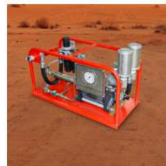
Chemical Injection Pump Pneumatic Operated