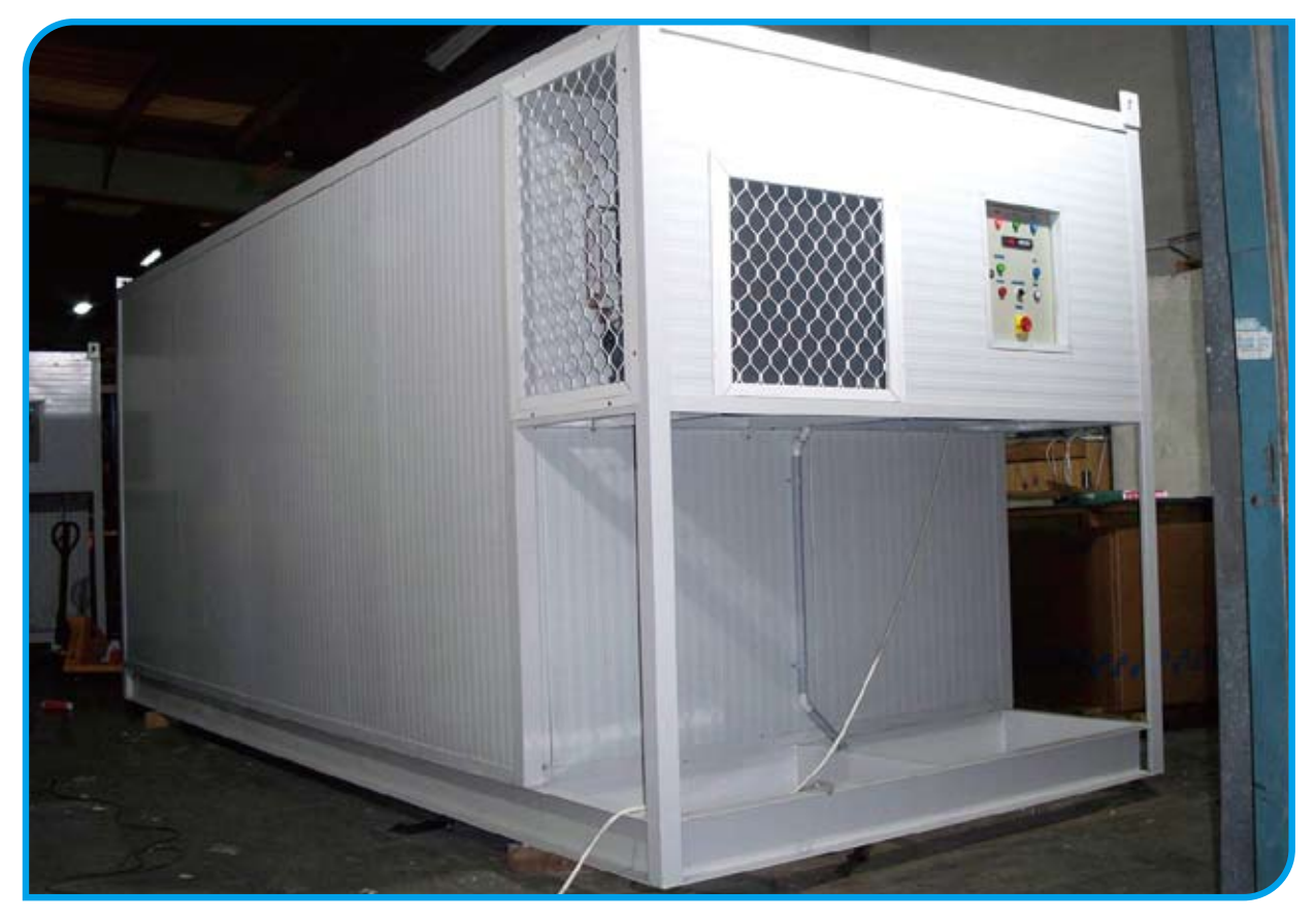
Portable Cold Room