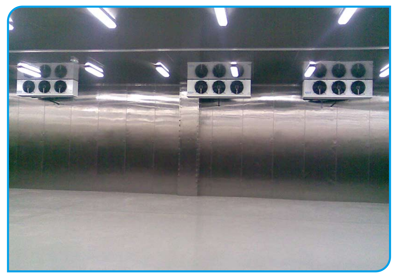
Cold Room with SS Finish