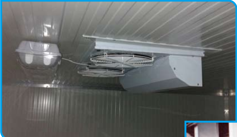
Monoblock Ceiling Type