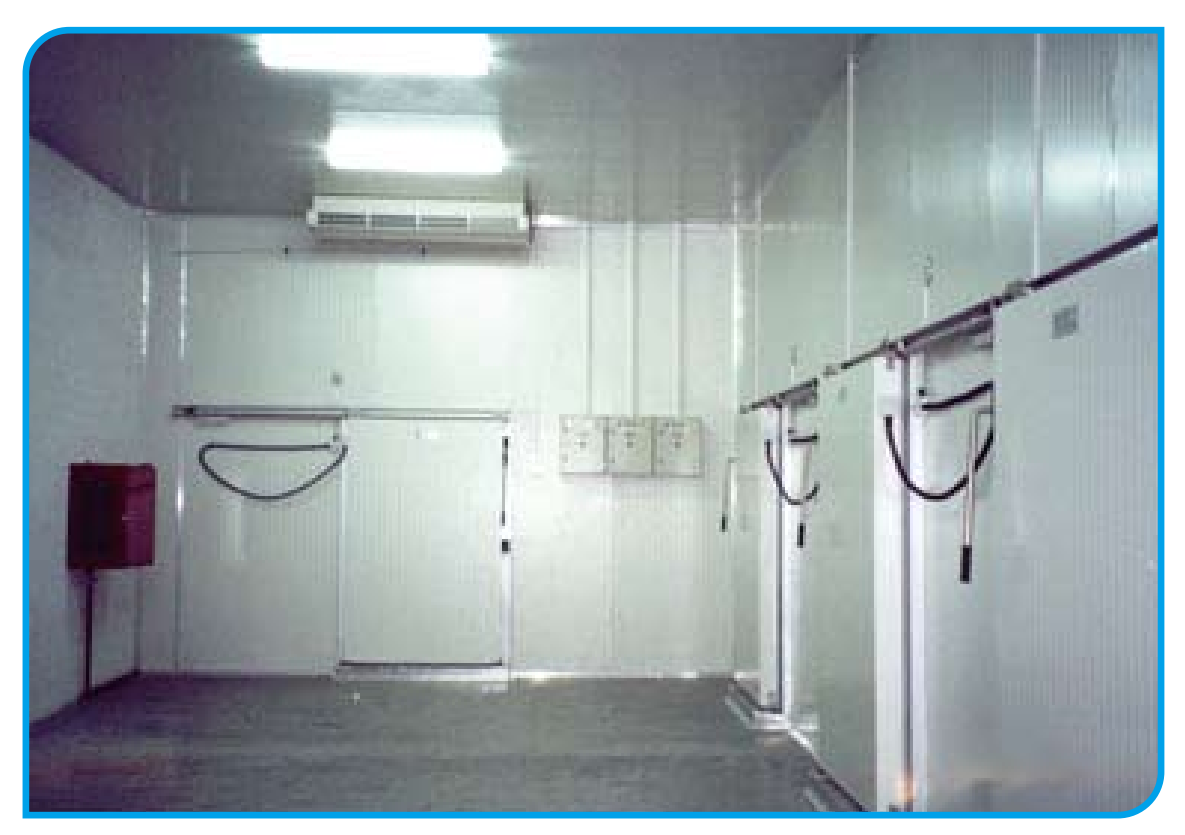
Sliding Doors PP Finish