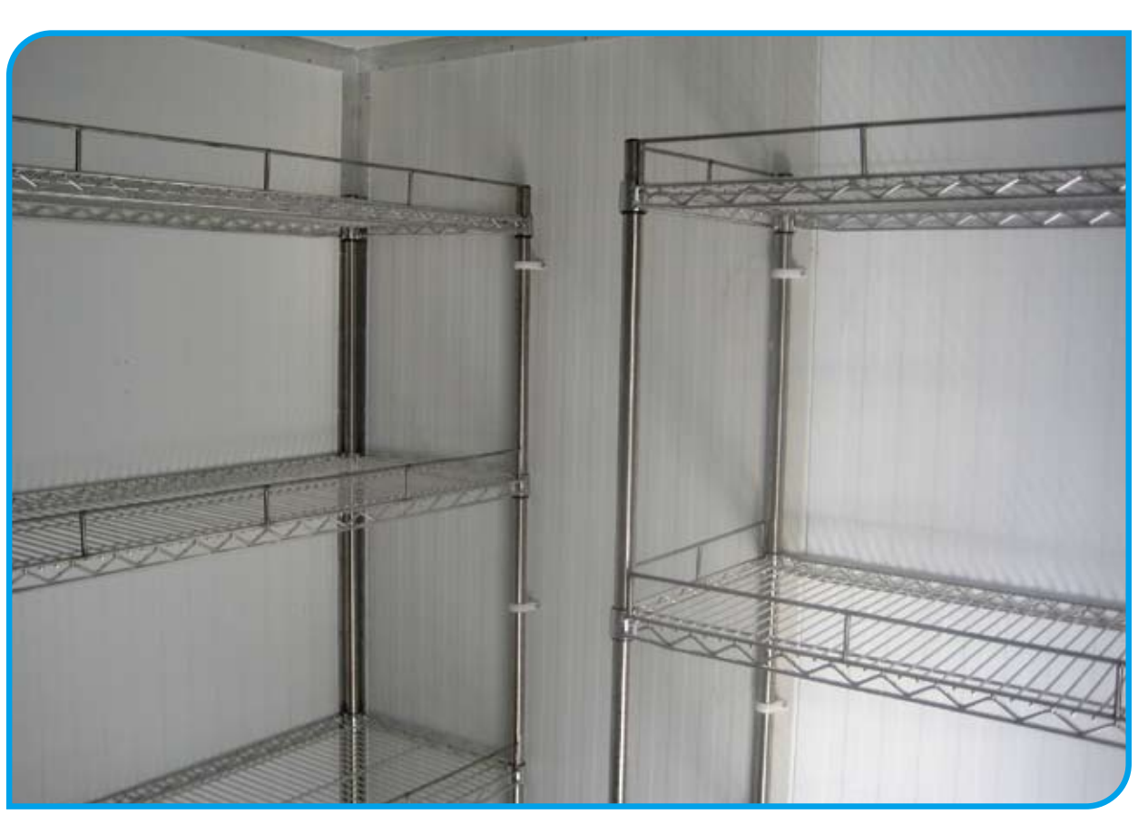
Cold Room with SS Shelving