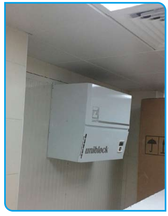
Mono Block Wall Type