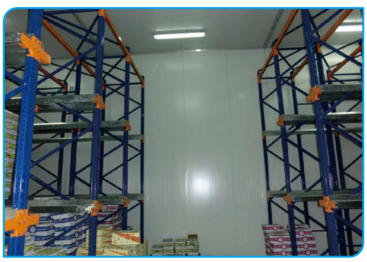
Cold Store with Racking