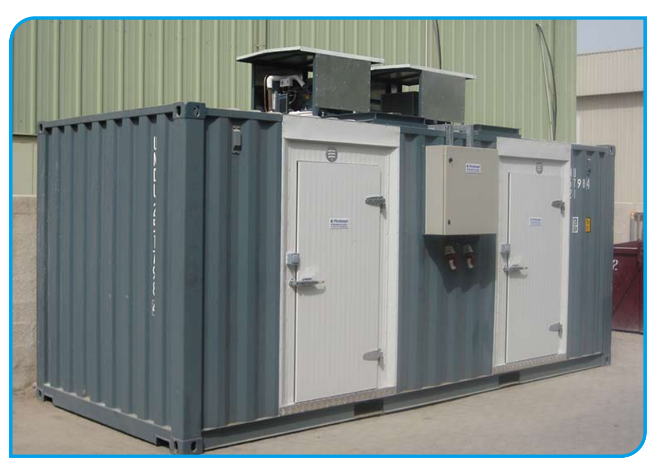
Cold Room Inside Container