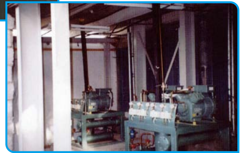
Water Cooled Units