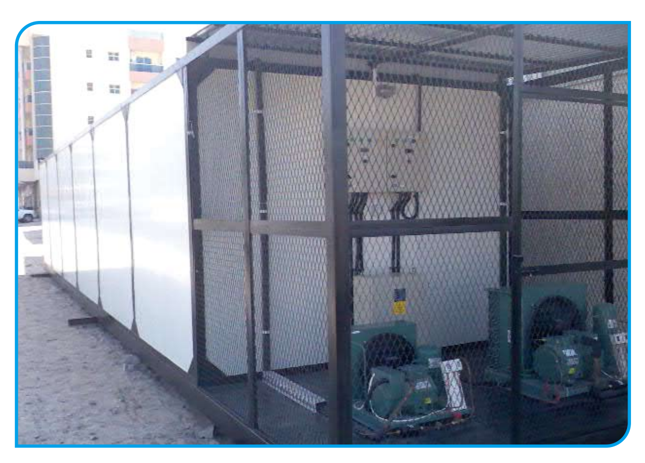
Portable Cold Room