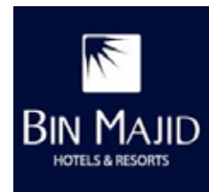
BIN MAJID RESORTS