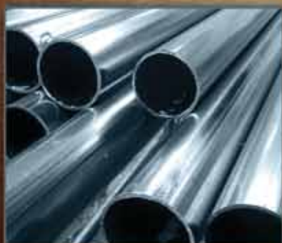
SEAMLESS / ERW PIPES