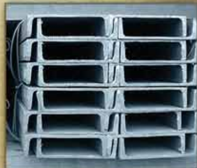
CHANNELS (UPN, PFC, JIS)