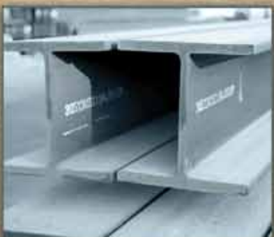
UNIVERSAL BEAMS / COLUMNS