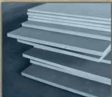
1.219/1.5/2 METER WIDTH HOT ROLLED PLATES