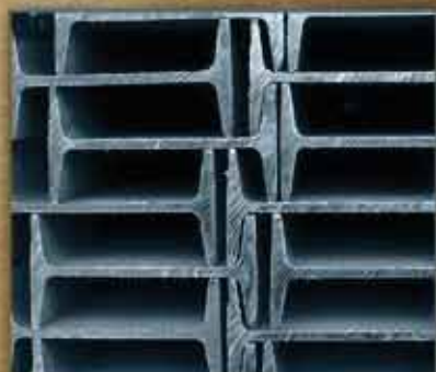
EUROPEAN SECTIONS (HEA, HEB, IPE / IPN)