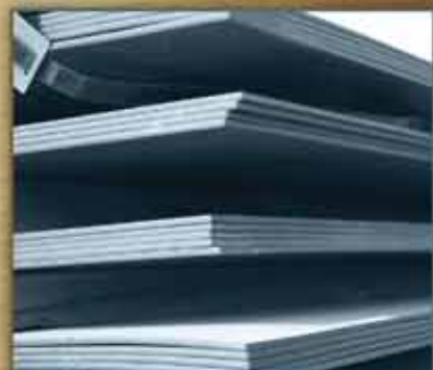
2.5 / 3.05 METER WIDTH PLATES