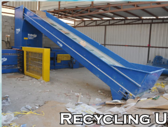
RECYCLING UNIT STATION