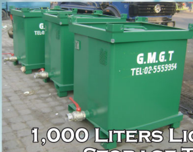
1,000 LITERS LIQUID STORAGE TANK