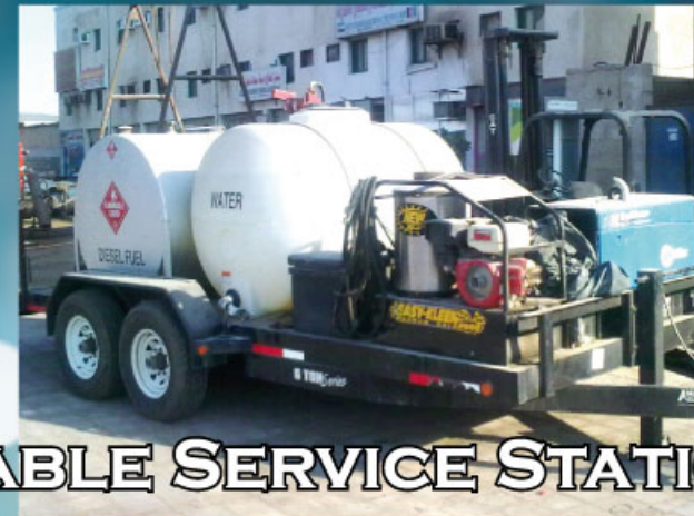
PORTABLE SERVICE STATION