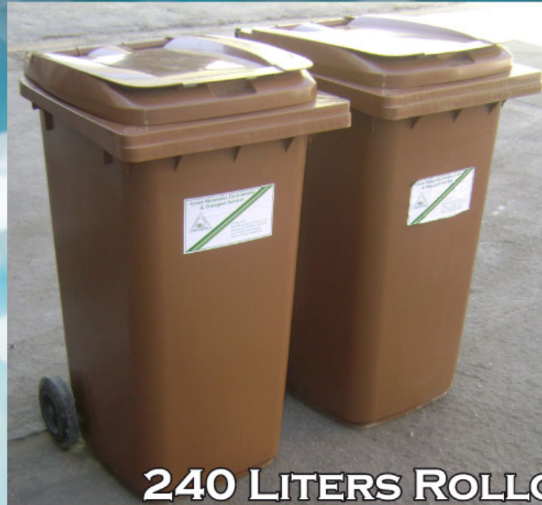
240 LITERS ROLLO BIN