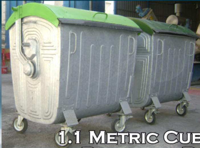
1.1 METRIC CUBE PORTABLE BIN