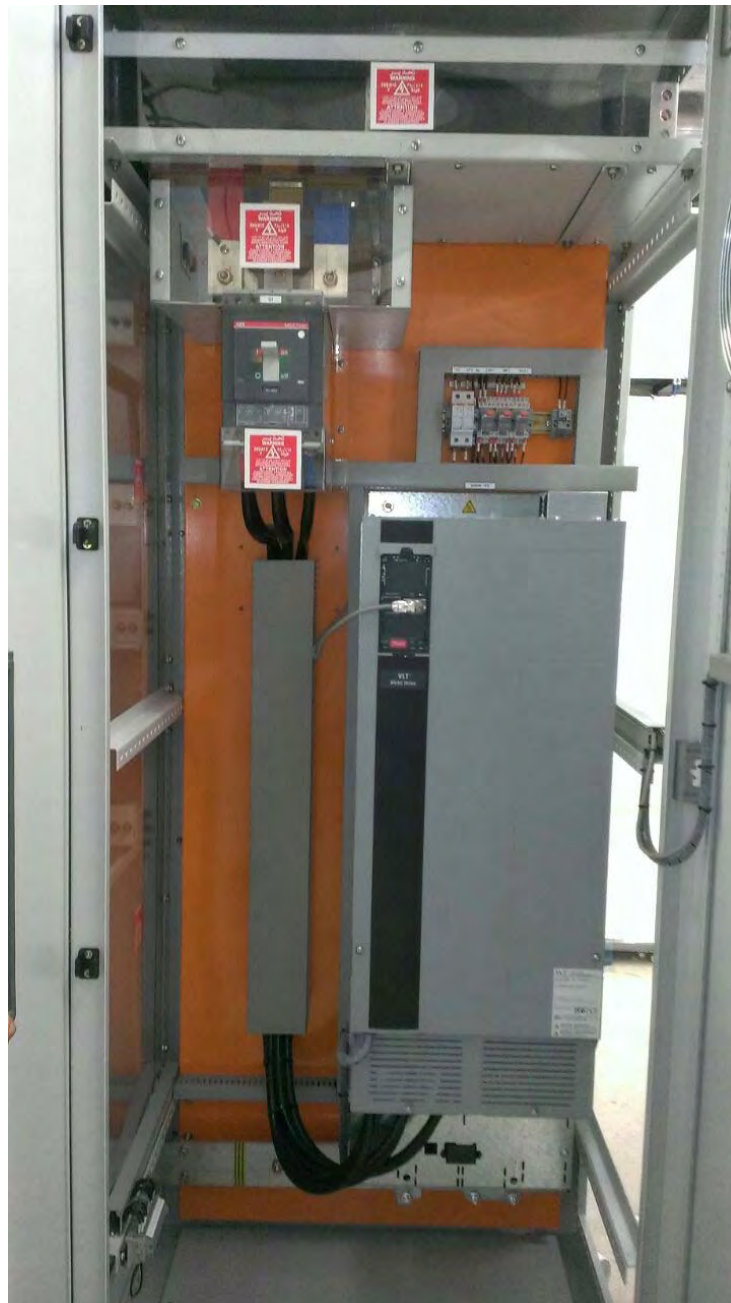
VFD Starter Panel – General Arrangement