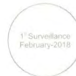
Certification Manager Bureau of Assessment Services

Certificate issue date : 13-February-2017 Certificate valid till : 12-February-2020 Certificate No : AE-BAS-Q0004942