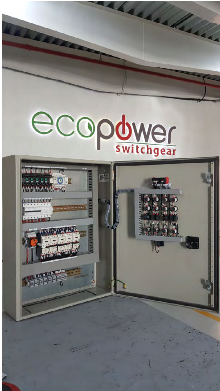
DOL Starter Panel