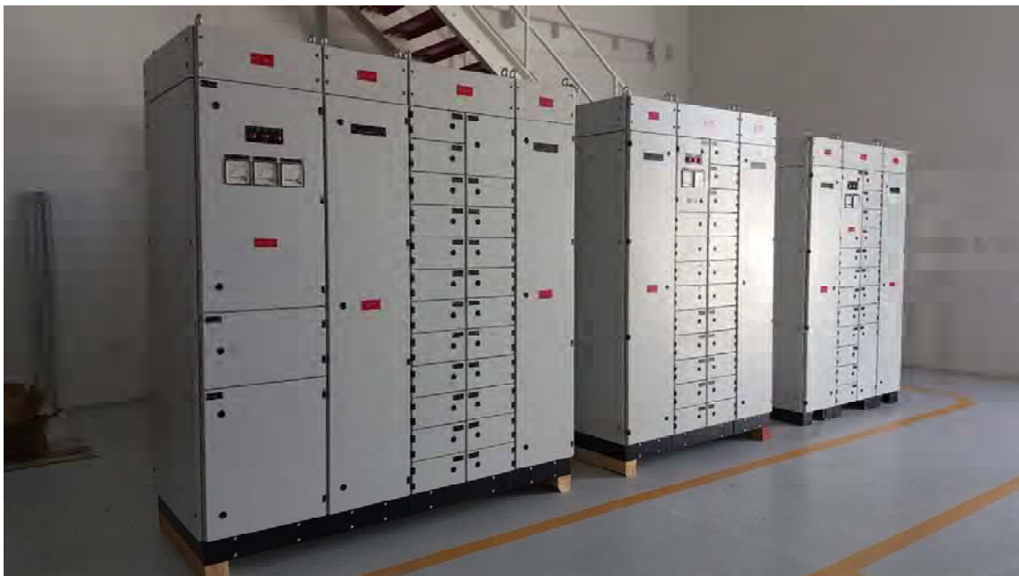
AC/DC Distribution Board