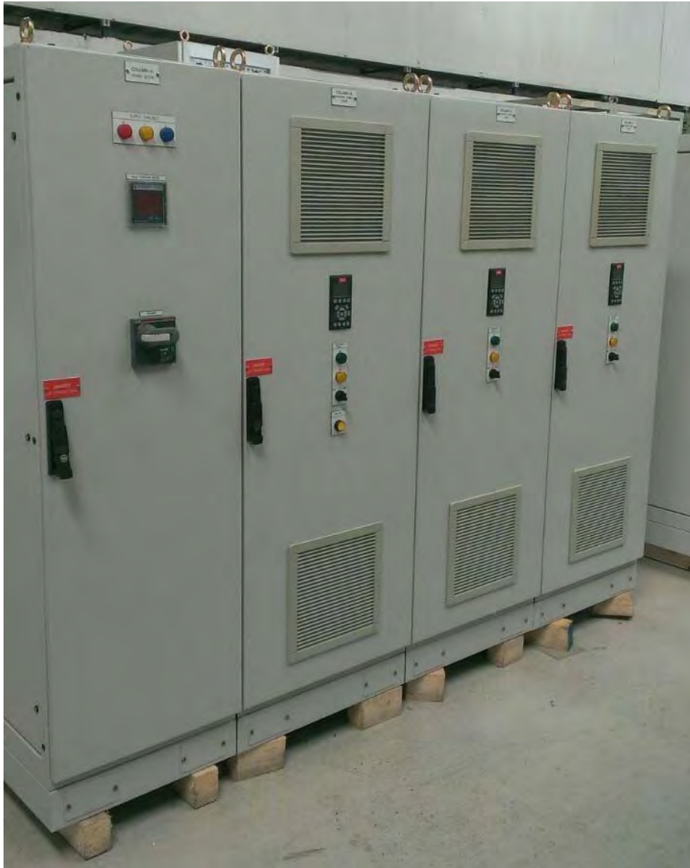
VFD Starter Panel