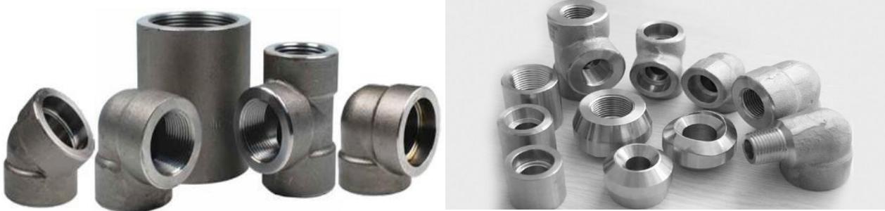
Carbon steel/Stainless Steel (Forged)