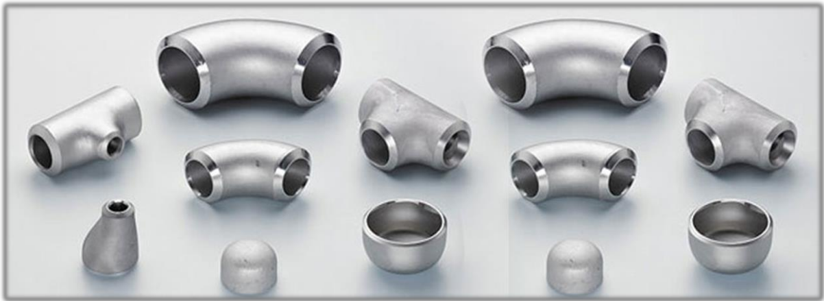
SS Welded fittings