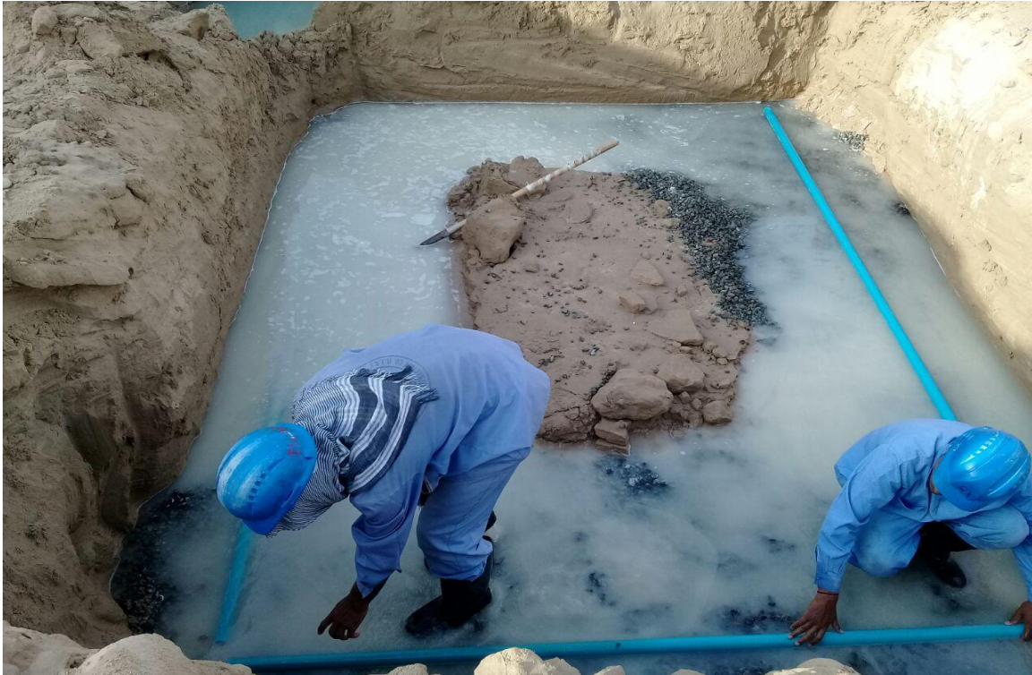
French Drain Pipe Installation