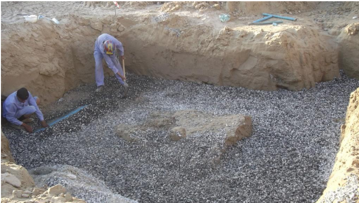
French Drain Layout