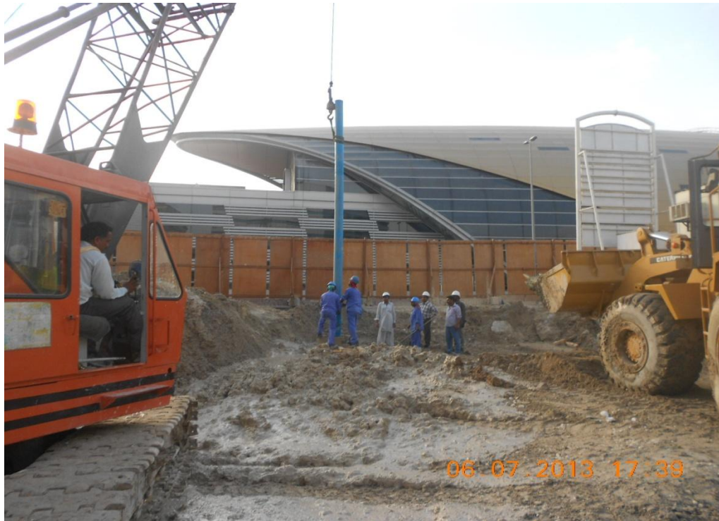
Deepwell Pipe Installation